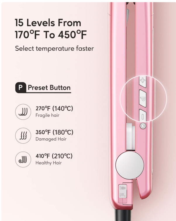
Figure 4: Digital display with 15 temperature levels from 170°F to 450°F and a preset button for quick selection.