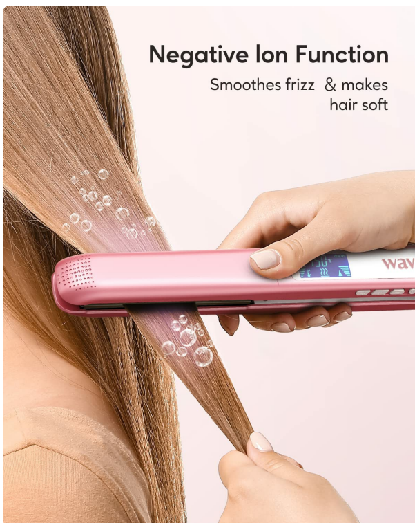
Figure 2: The negative ion function helps smooth frizz and makes hair soft.