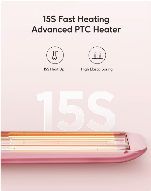
Figure 5: Advanced PTC heater ensures 15-second fast heating.