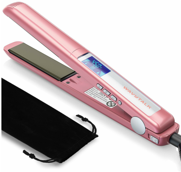
Figure 1: The Wavytalk Salon Flat Iron Hair Straightener in Bright Rose Gold.