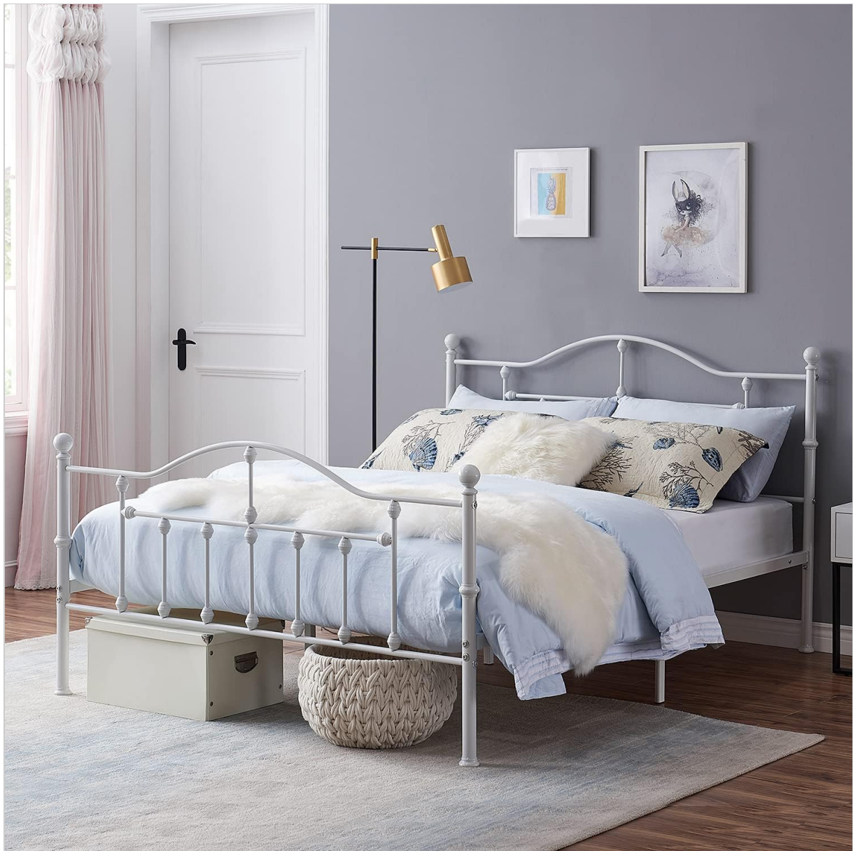
Figure 4: The VECELO bed frame with a mattress and bedding, showcasing its Victorian style.