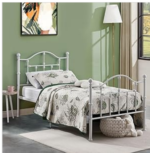
Figure 2: Square steel slats provide strong support and minimize noise.

Once all components are in place, go back and fully tighten all bolts and screws. Your bed frame is now ready for use.