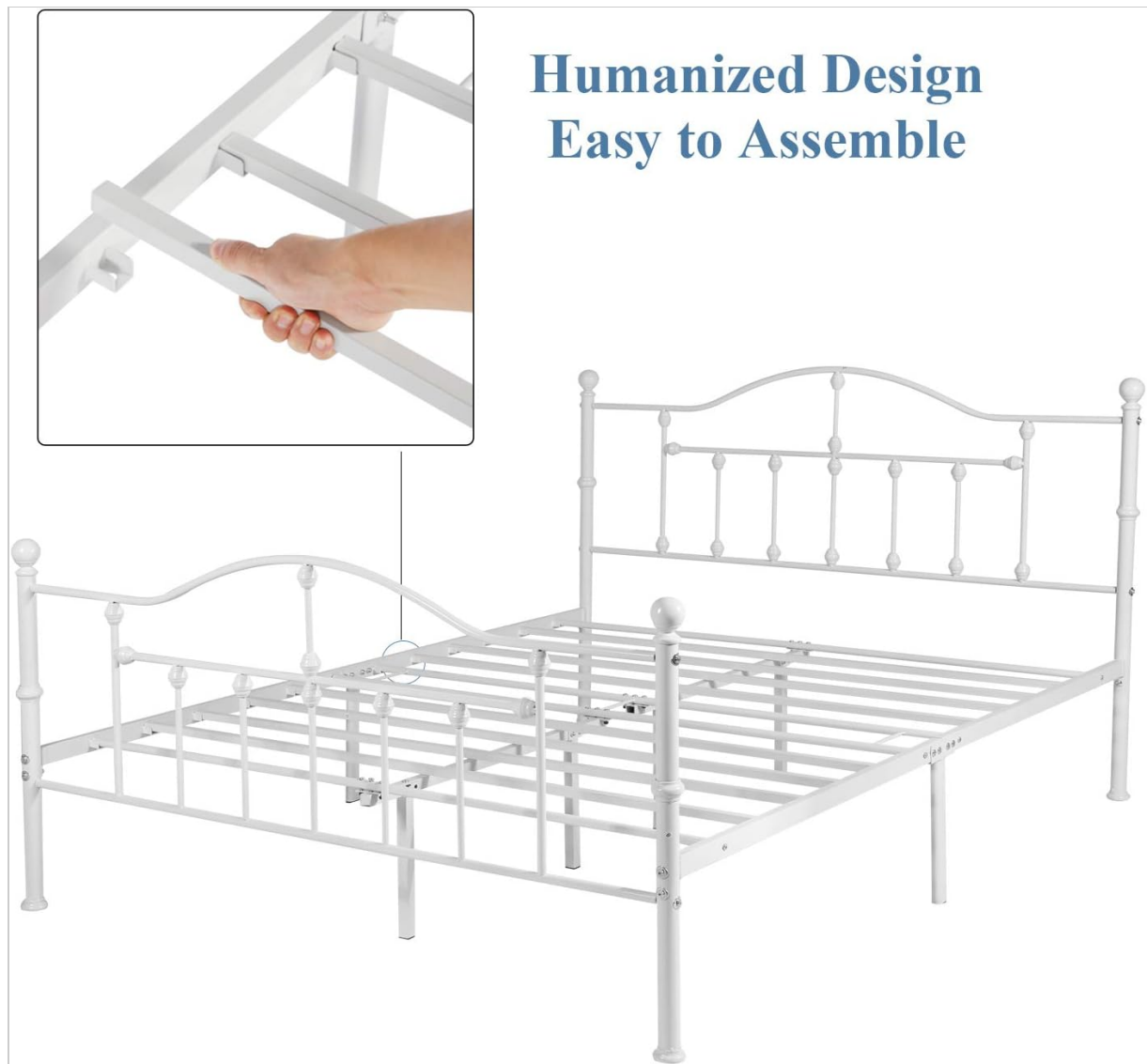
Figure 1: Humanized Design for Easy Assembly. All parts are clearly labeled for a quick and simple setup.