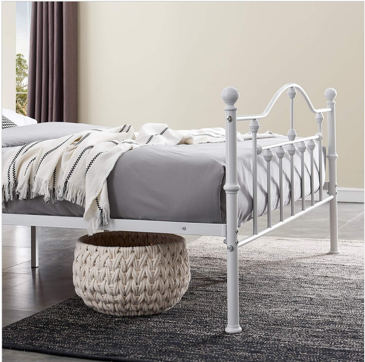
Figure 3: Ample under-bed storage space for various items.

provides convenient storage space underneath for bins, baskets, or luggage.