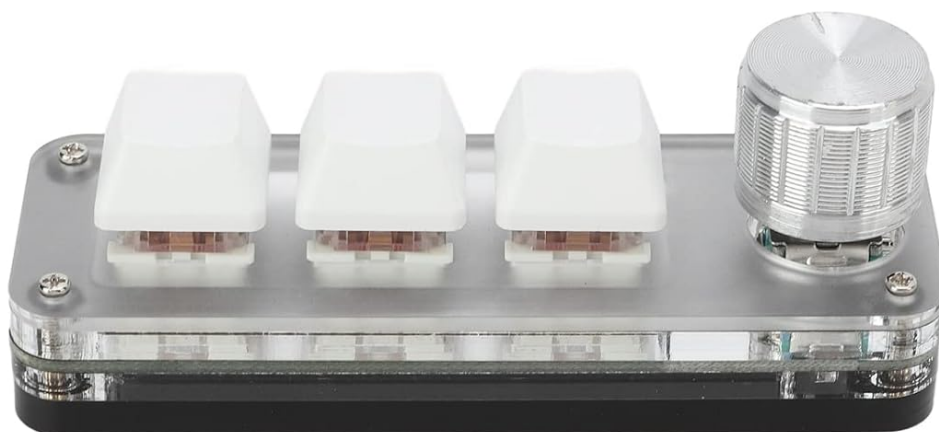
Image: The Dioche One Handed Gaming Keyboard with an overlay text describing its multifunctional capabilities, including knob functions and shortcut key programming.

the knob can enlarge and reduce the screen switch the song, increase or decrease the volume, pause, play one key to achieve cumbersome and complex combination of shortcut keys