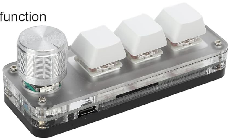
Image: The Dioche One Handed Gaming Keyboard and its USB cable, with text emphasizing its driver-free, plug-and-play functionality and storage capability.