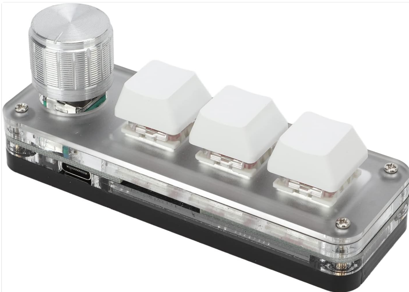
Image: The Dioche One Handed Gaming Keyboard, featuring three white keys and a silver rotary knob, presented on a clear acrylic base.