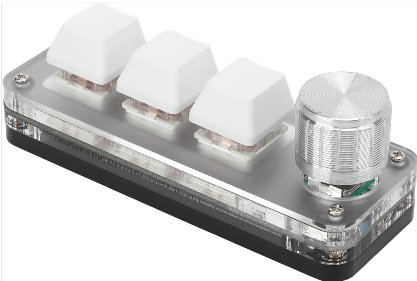
Image: The Dioche One Handed Gaming Keyboard shown alongside its white USB Type-C cable, ready for connection.