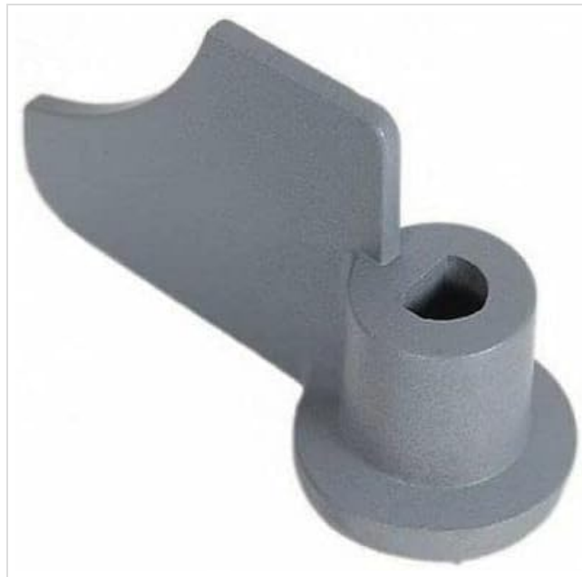
Image: A close-up view of the kneading paddle's base, highlighting the attachment point designed to fit onto the bread pan's drive shaft.