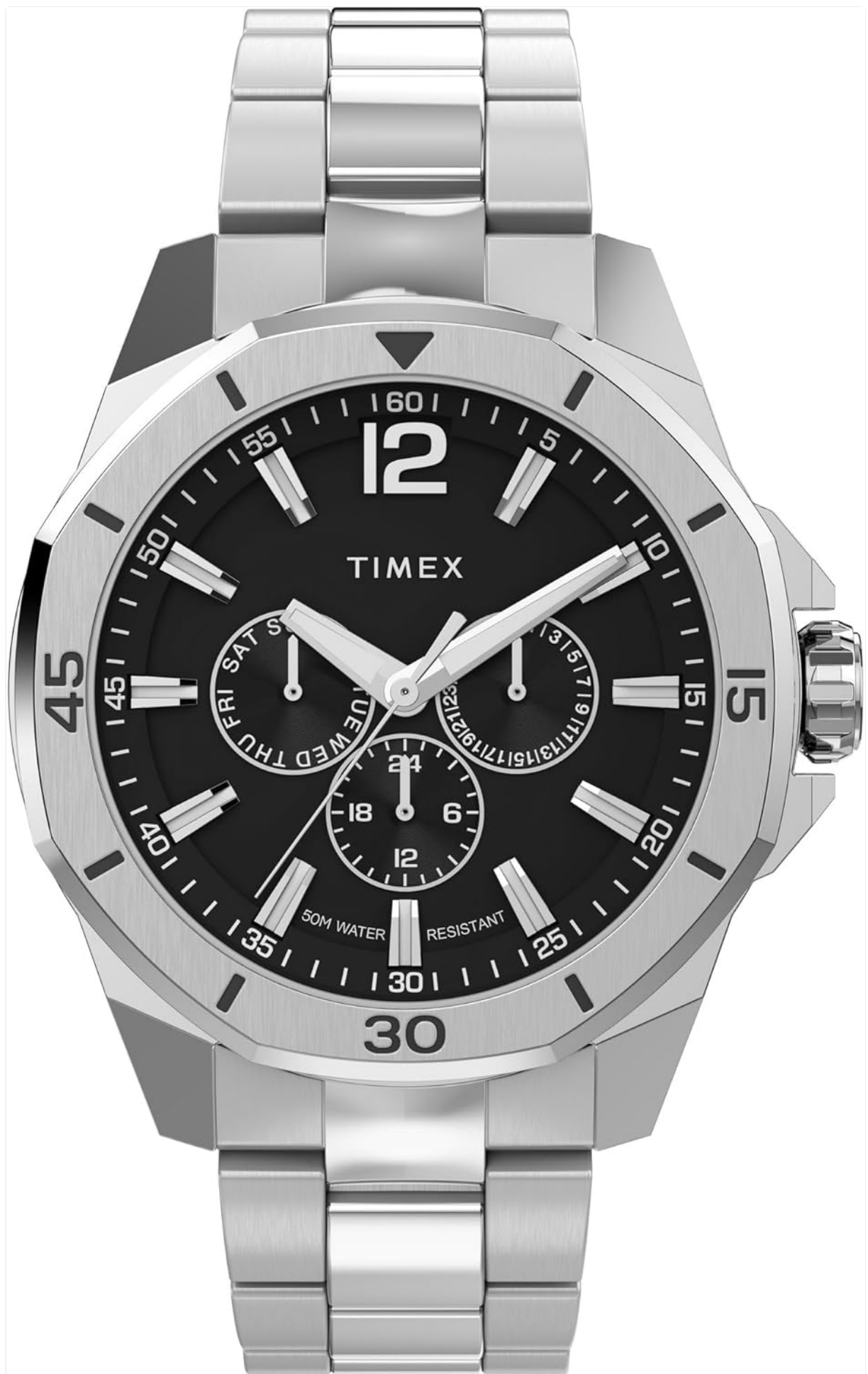
Figure 1: Front view of the Timex Essex Avenue Day-Date 44mm Quartz Watch. This image displays the watch face with its black dial, silver-tone case, and metal bracelet. The day and date subdials are visible, along with the main hour, minute, and second hands.