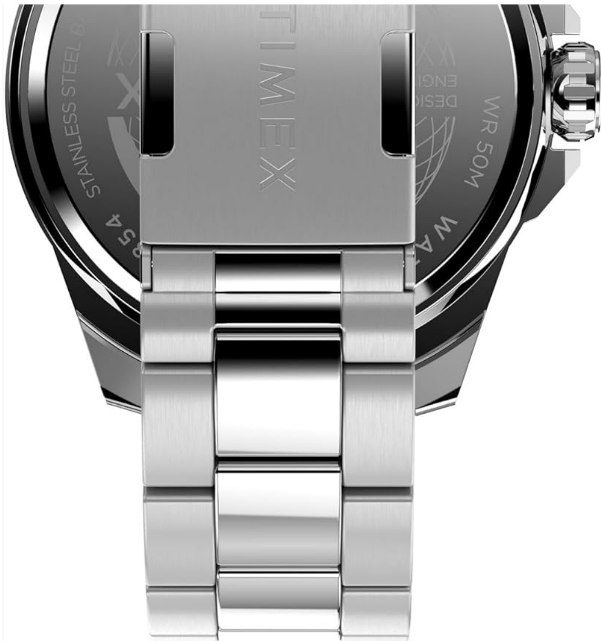
Figure 2: Rear view of the Timex Essex Avenue watch, showing the metal bracelet and clasp mechanism. The clasp features the Timex logo.

The metal link bracelet may require adjustment for a comfortable fit. This typically involves removing or adding links. It is recommended to have this procedure performed by a qualified jeweler or watch technician to prevent damage to the bracelet or clasp.