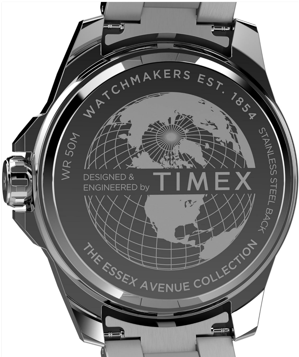
Figure 3: Close-up of the watch's case back, indicating "WR 50M" for water resistance up to 50 meters. Other engravings include "WATCHMAKERS EST. 1854" and "THE ESSEX AVENUE COLLECTION".

Your Timex Essex Avenue watch is water resistant up to 50 meters (5 ATM). This rating means the watch is suitable for short periods of recreational swimming, showering, or general water splashes. It is not suitable for diving, snorkeling, or high-impact water sports. Always ensure the crown is fully pushed in before any contact with water.