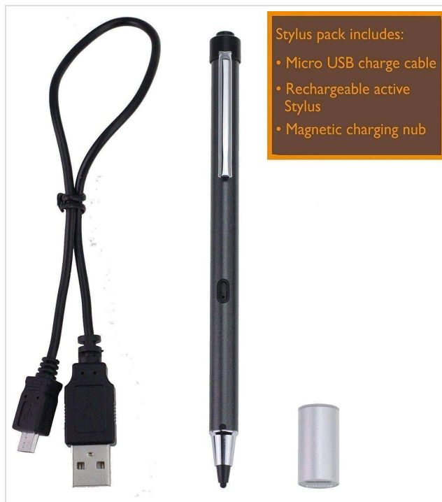
Image: The complete stylus package contents, including the stylus, a Micro USB charging cable, and a magnetic charging nub.