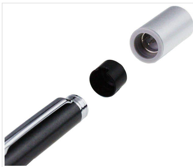
Image: A close-up view of the stylus's charging port, showing the cap removed to reveal the charging interface.