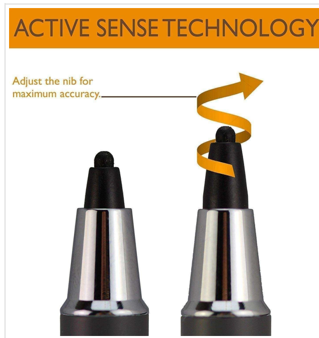
Image: A diagram illustrating the concept of adjusting the stylus nib for maximum accuracy, highlighting the precision capability.

While specific adjustment methods vary, ensure the nib is securely seated and clean for the best performance.