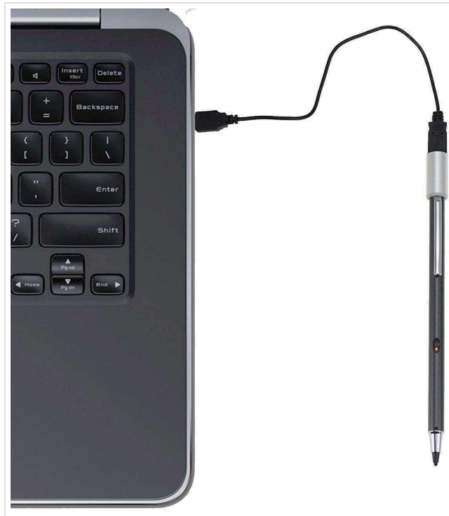
Image: The stylus connected via its Micro USB cable to a laptop's USB port, illustrating the charging process.