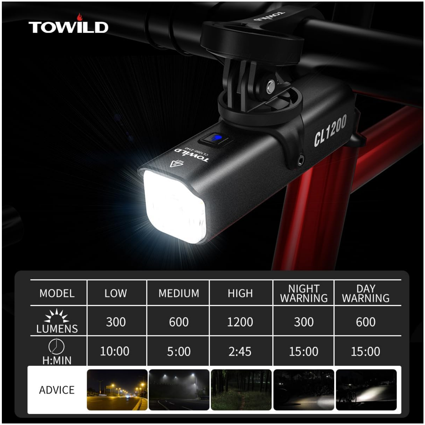
Image: Table illustrating different brightness modes, lumen output, and corresponding runtimes.

For added convenience, the CL1200 can be paired with an optional wireless remote control.