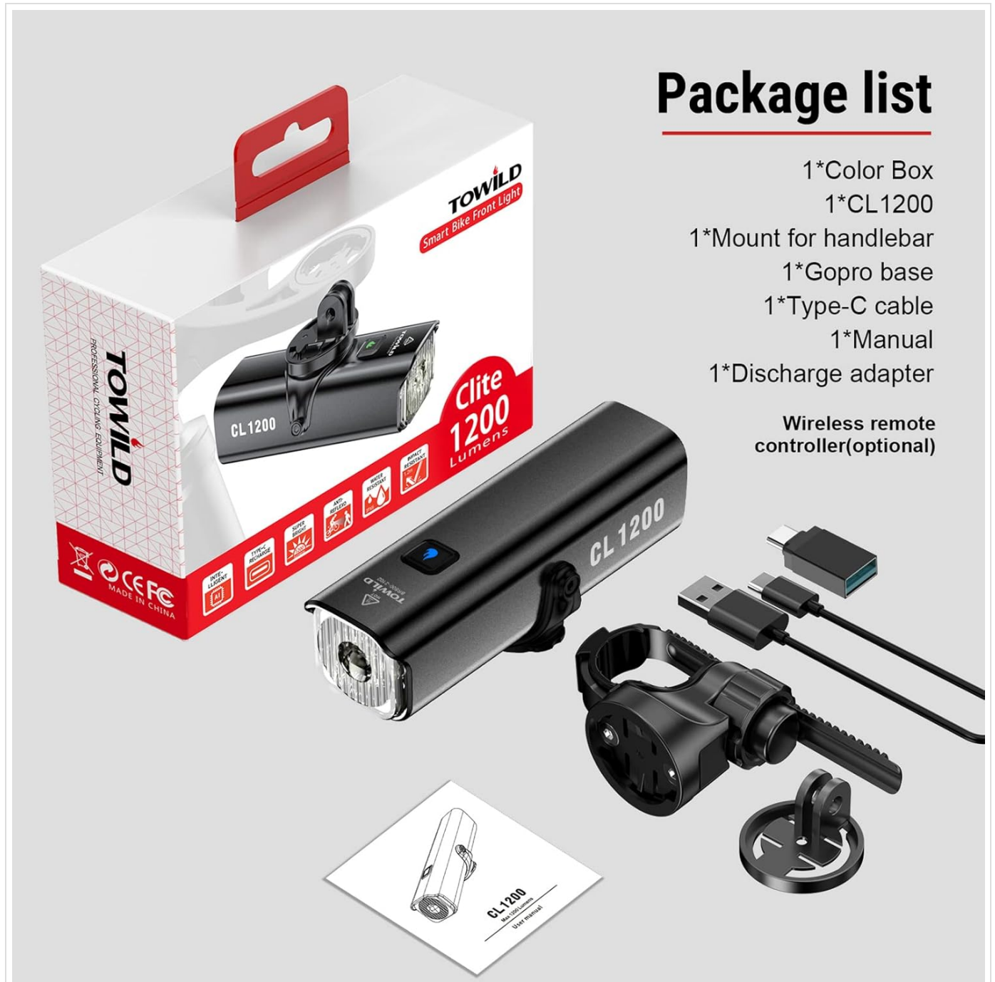
Image: All components included in the TOWILD CL1200 Bike Light package.