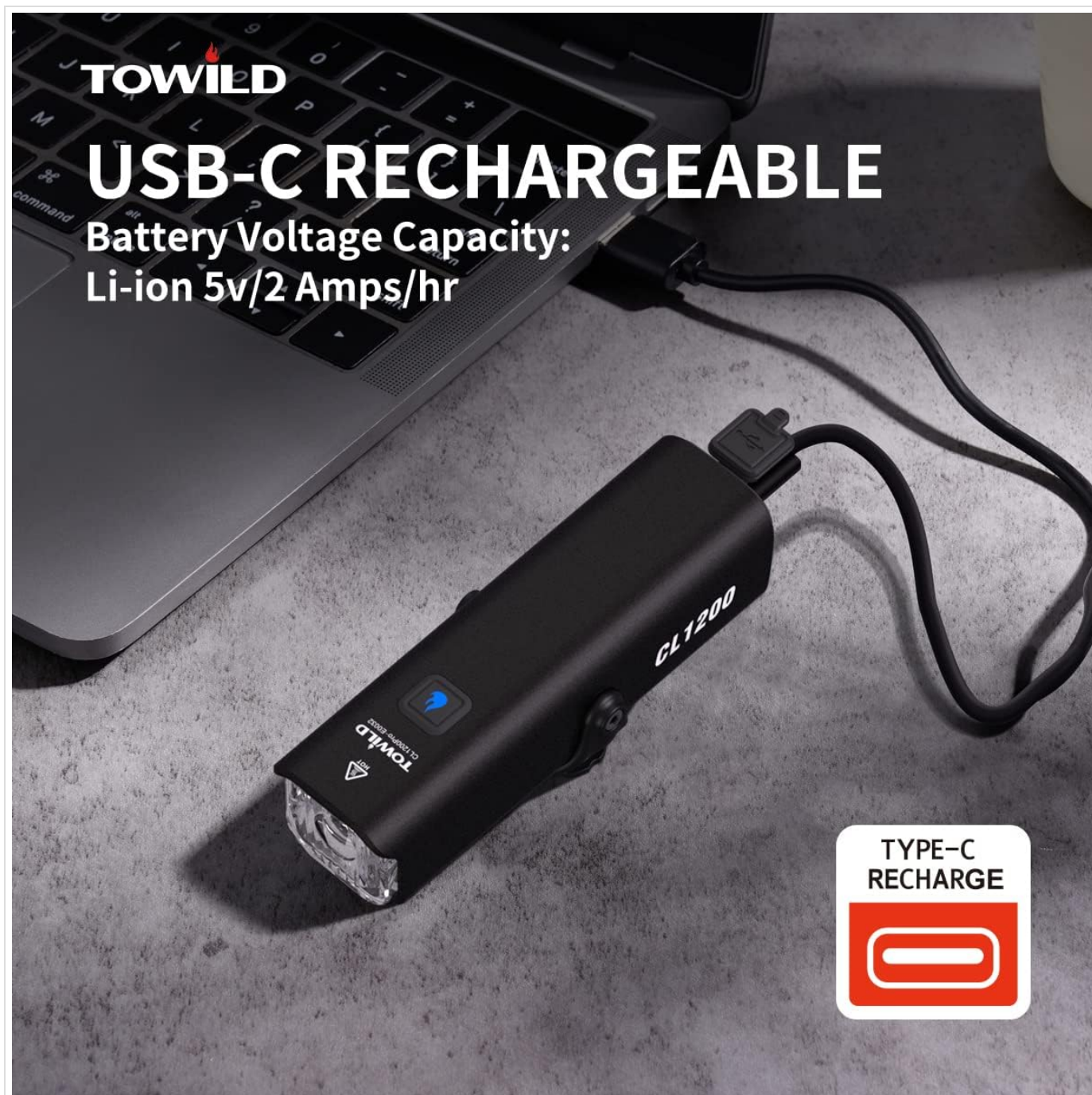
Image: The CL1200 light connected for USB-C charging.