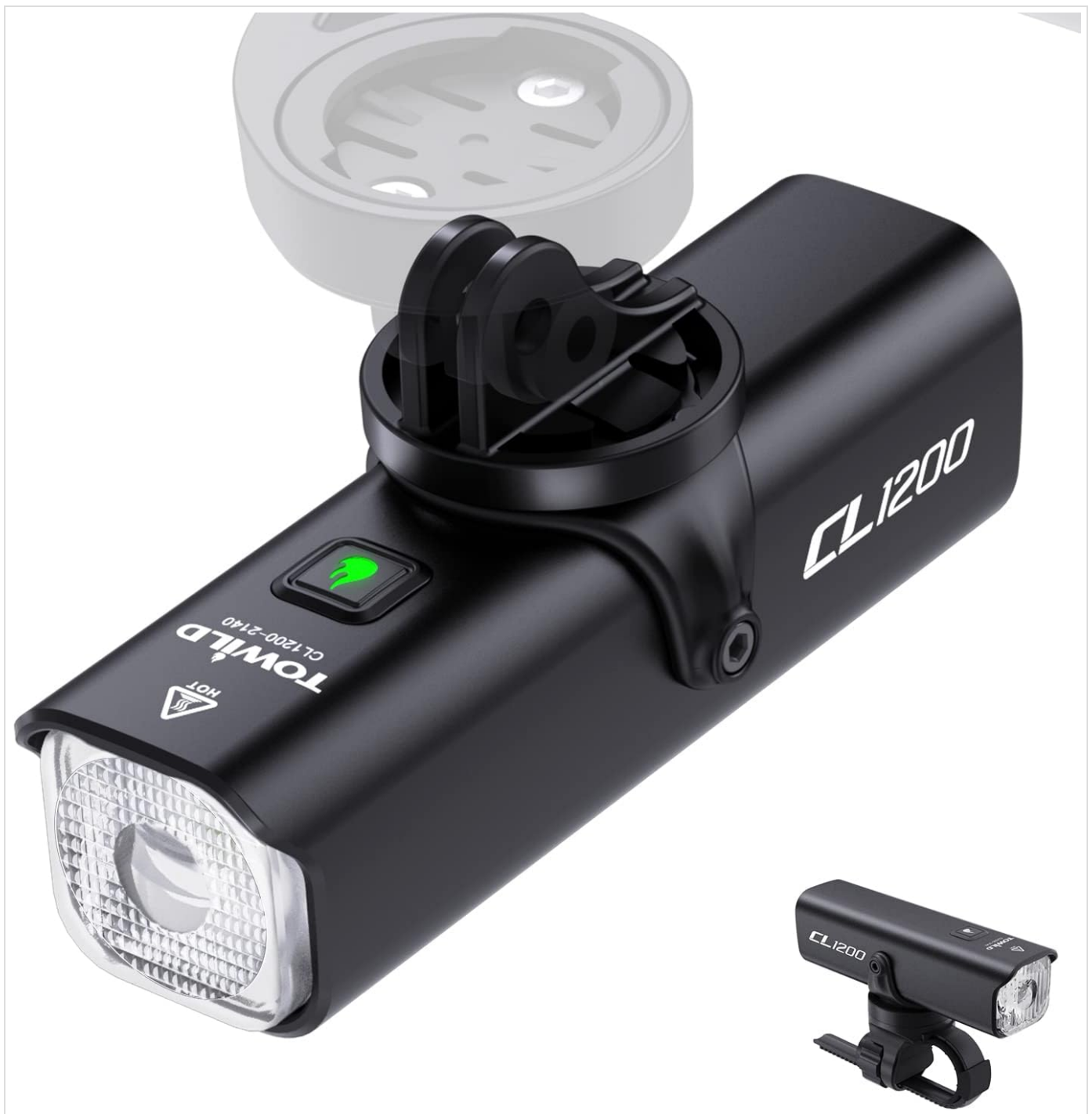
Image: The TOWILD CL1200 Bike Light, showcasing its compact design and compatibility with Garmin/GoPro mounts.