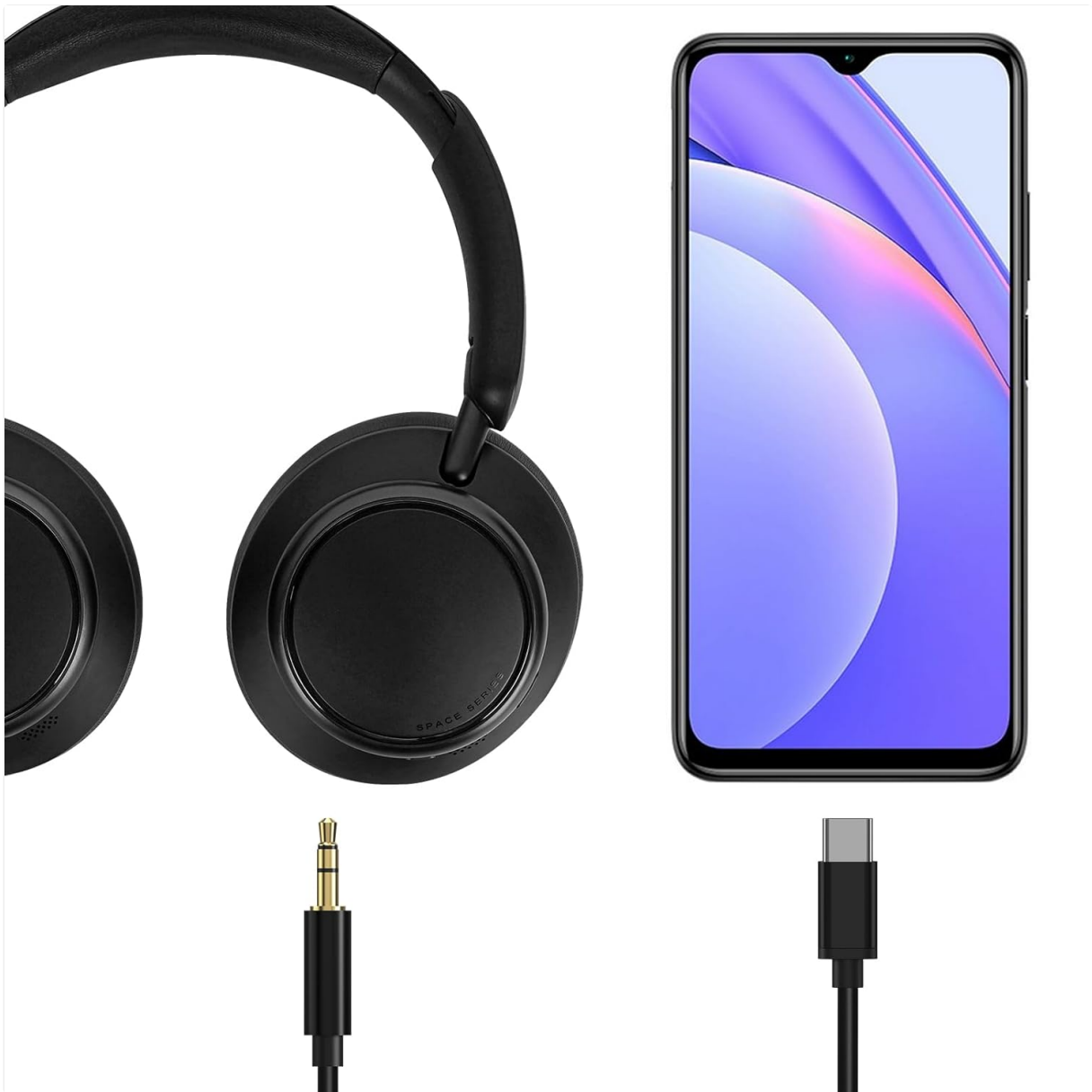
Figure 3: Connection Diagram

This diagram illustrates the connection process. It shows a smartphone with a USB-C port and a pair of headphones with a 3.5mm jack, with the Linkidea cable connecting the two devices, demonstrating a typical setup.