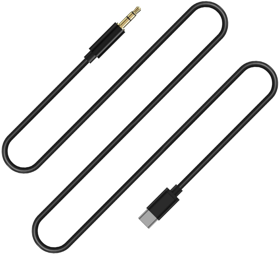
Figure 5: Cable Length Illustration

This image displays a single black audio cable coiled to demonstrate its full length, which is clearly labeled as 3.3 feet (100 cm).