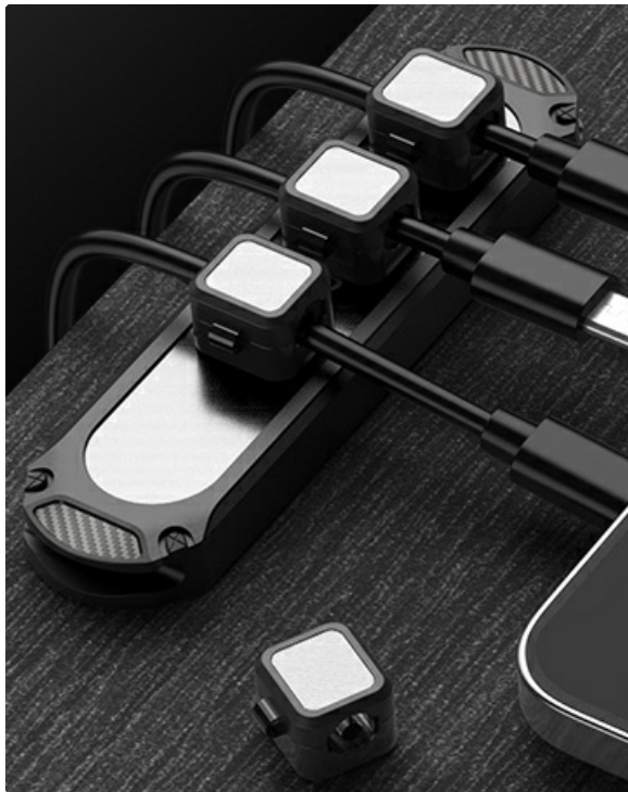
Image: A USB-C charging cable is shown, illustrating the connection point for charging the keyboard case.