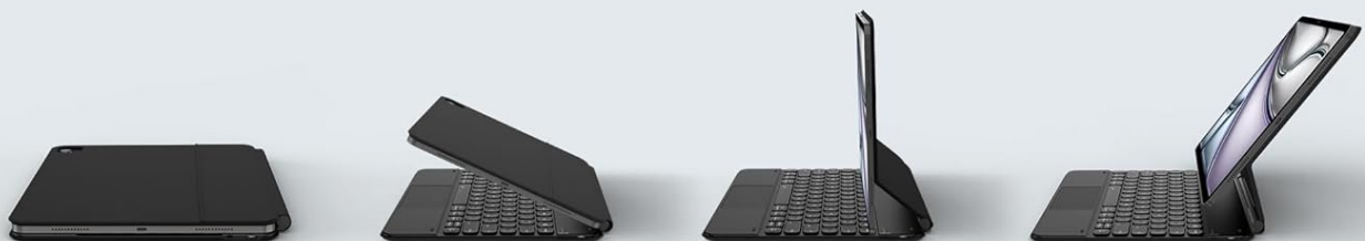
Image: The iPad Pro 12.9 inch is shown securely attached to the keyboard case via strong magnets, illustrating the magnetic attachment feature.