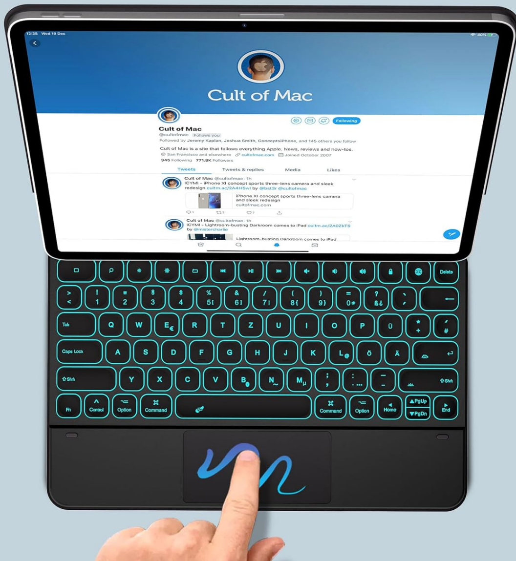
Image: The keyboard case with an iPad Pro 12.9 inch demonstrates its adjustable viewing angles, highlighting the 135-degree range for optimal screen positioning.

Mühelesses Navigieren durch Tippen, Ziehen, Auf- und Zuziehen oder Wischen