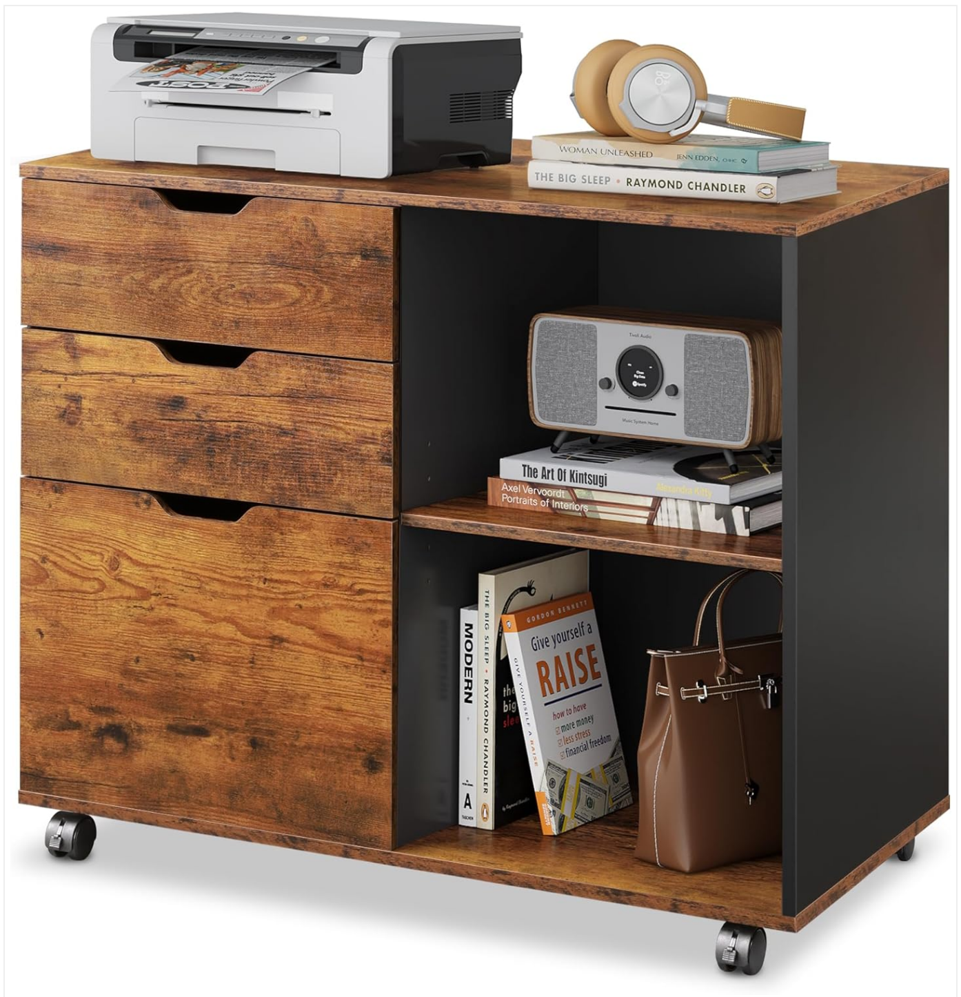
Image: The DEVAISE 3-Drawer Wood File Cabinet, showcasing its rustic brown finish, three drawers, and open storage compartments, with a printer on top.