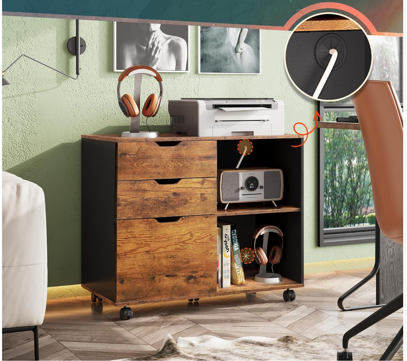
Image: Dual cable management holes for organized wiring.