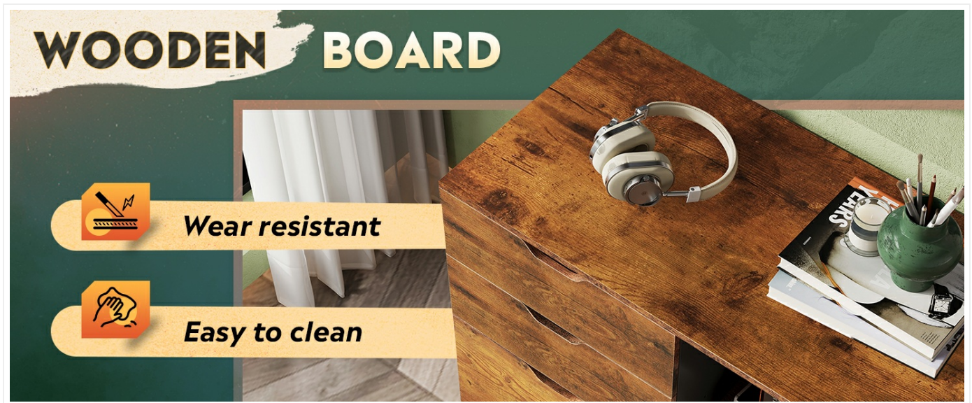
Image: Features of the wooden board material, emphasizing durability and ease of cleaning.