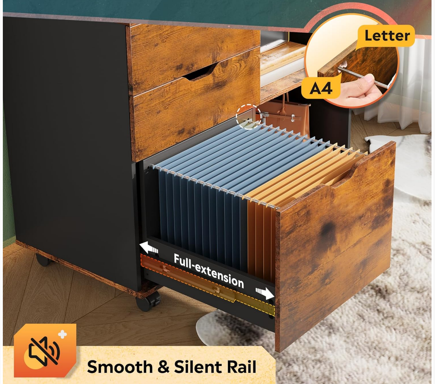
Image: The bottom drawer fully extended, demonstrating easy access for letter and A4 size files.