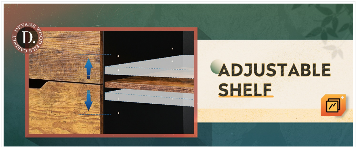
Image: Illustration of the adjustable shelf mechanism.