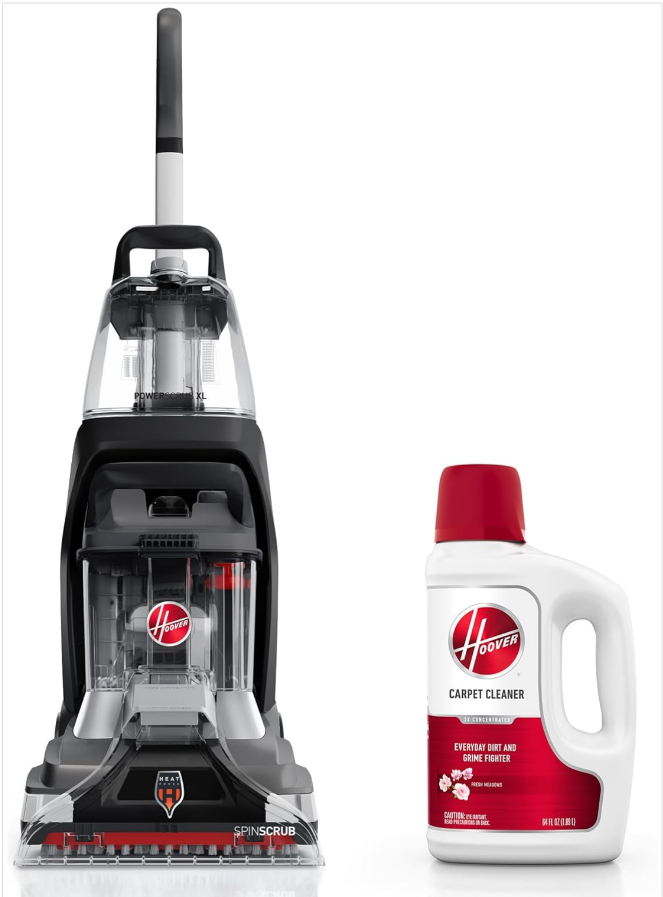
Figure 1: The Hoover PowerScrub XL Pet Carpet Cleaner Machine shown alongside a bottle of Hoover carpet cleaning solution.