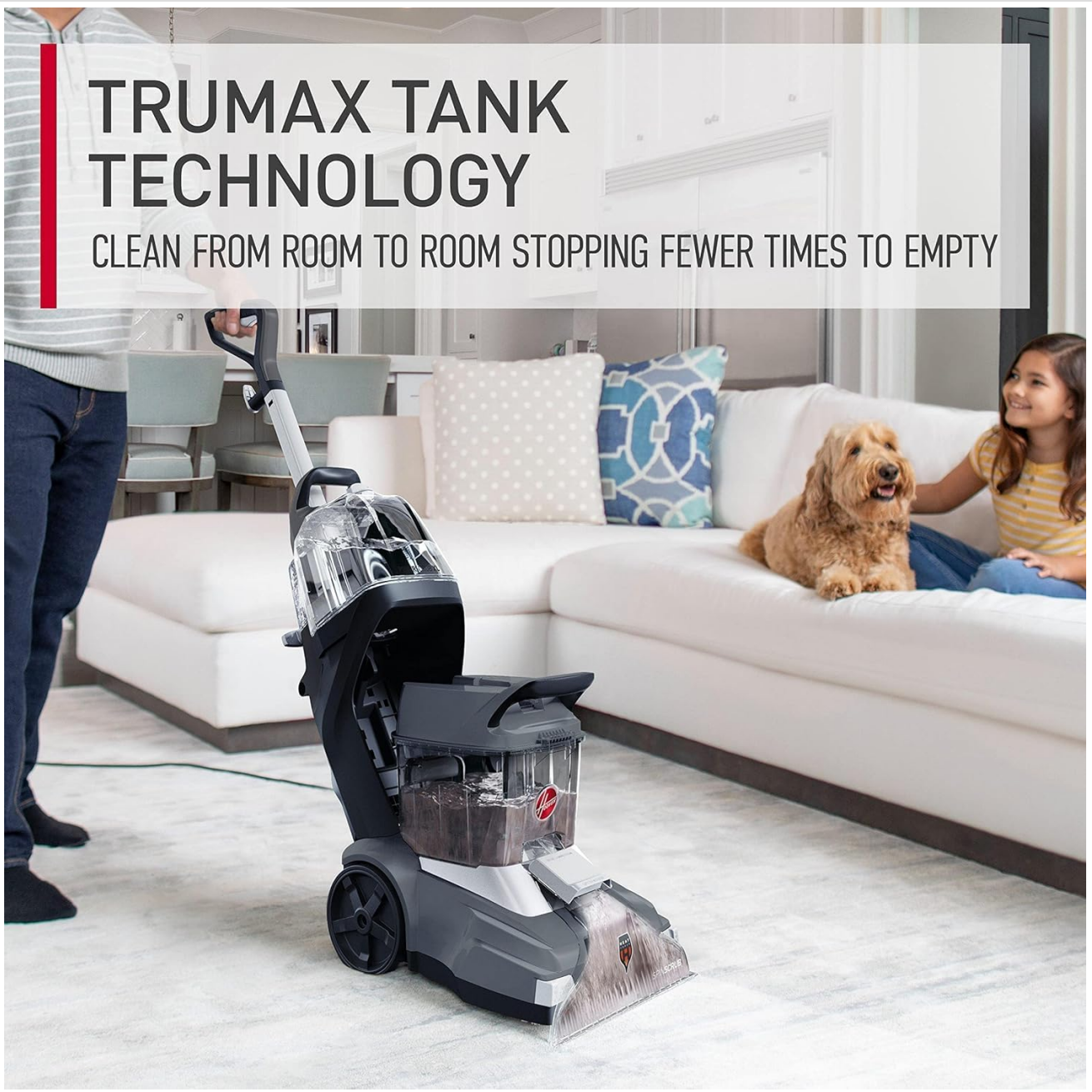
Figure 5: The TruMax Tank Technology allows for extended cleaning sessions by minimizing the need for frequent emptying and refilling of tanks.

CLEAN FROM ROOM TO ROOM STOPPING FEWER TIMES TO EMPTY