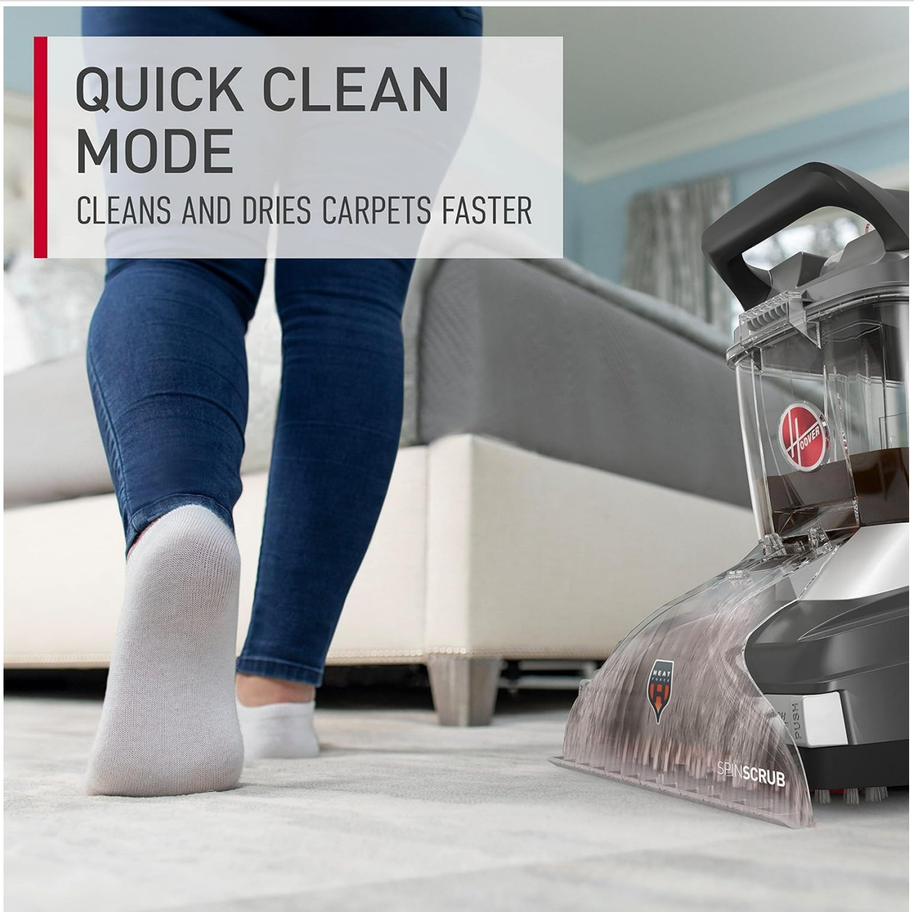
Figure 6: The Quick Clean Mode is optimized for faster cleaning and drying of carpets, ideal for light cleaning or quick refreshes.

For lighter cleaning needs or quick refreshes, the Quick Clean Mode cleans and dries carpets faster, allowing for rapid turnaround of cleaned areas.