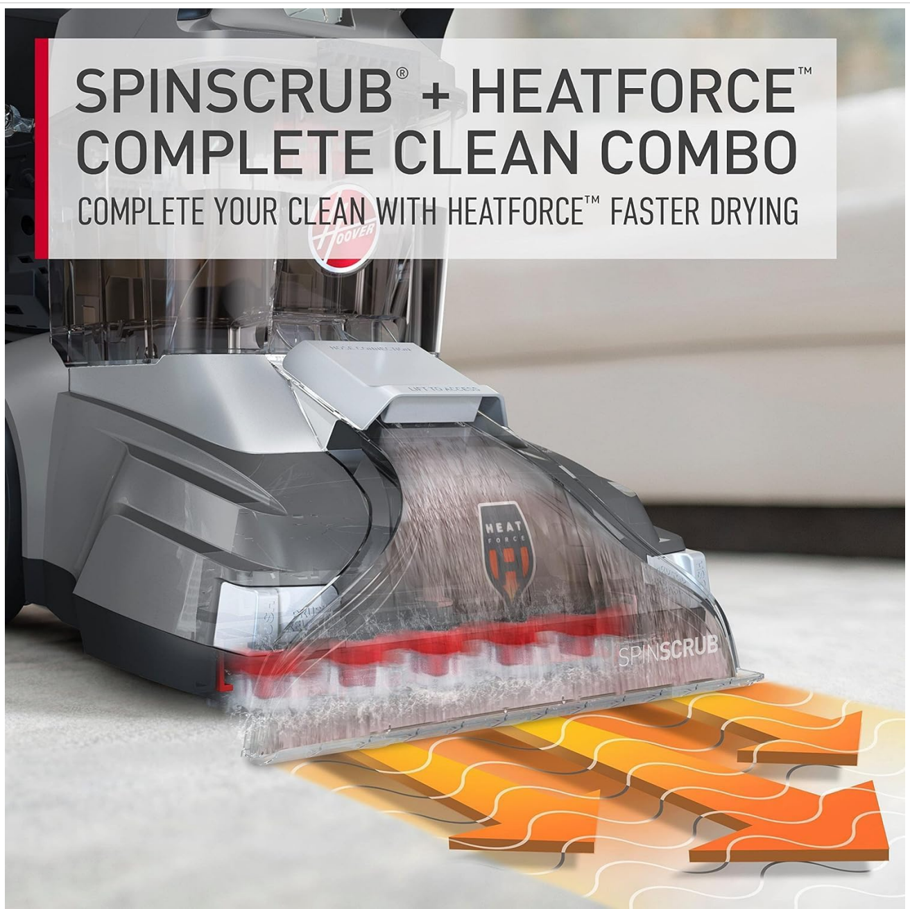
Figure 3: HeatForce technology applies warm air to the cleaned area, accelerating the drying process for carpets.

COMPLETE YOUR CLEAN WITH HEATFORCE™ FASTER DRYING