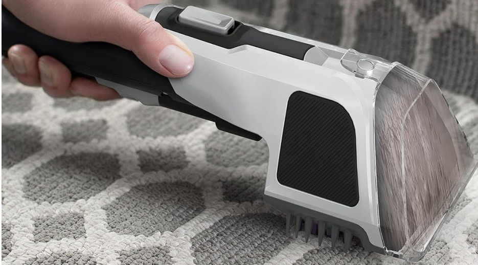
Figure 4: The versatile tools, such as the pet tool and upholstery tool, extend cleaning capabilities beyond floors to furniture and stairs.

FOR DEEP CLEANING POWER ON THE FLOOR & MORE