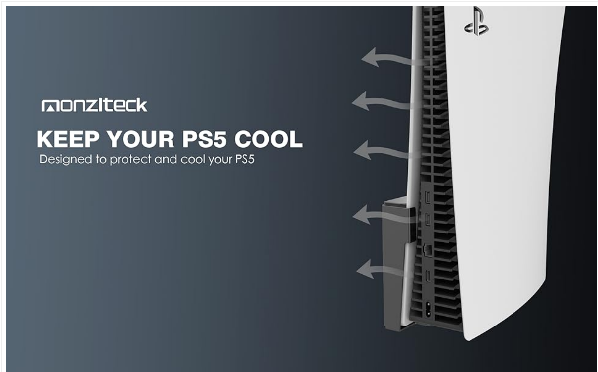
Figure 6: Airflow for console cooling.