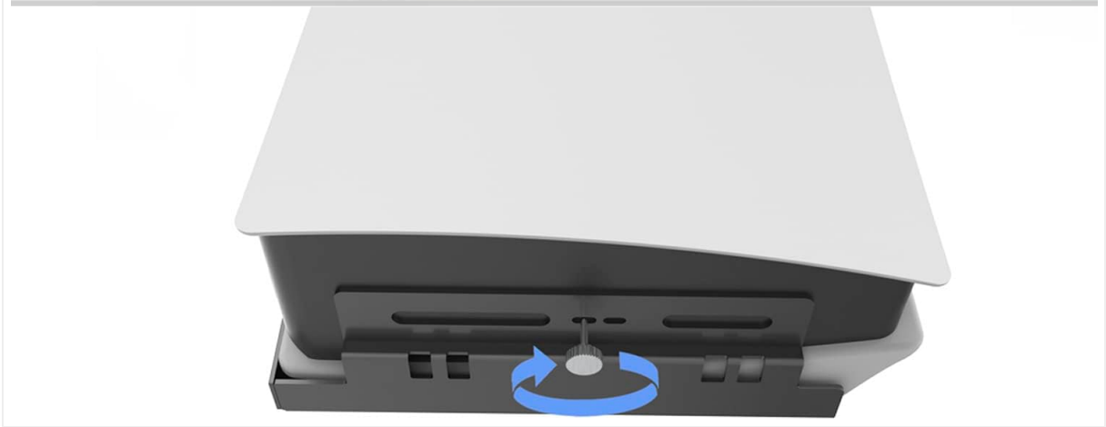
Figure 4: Console secured to the mount with a screw.