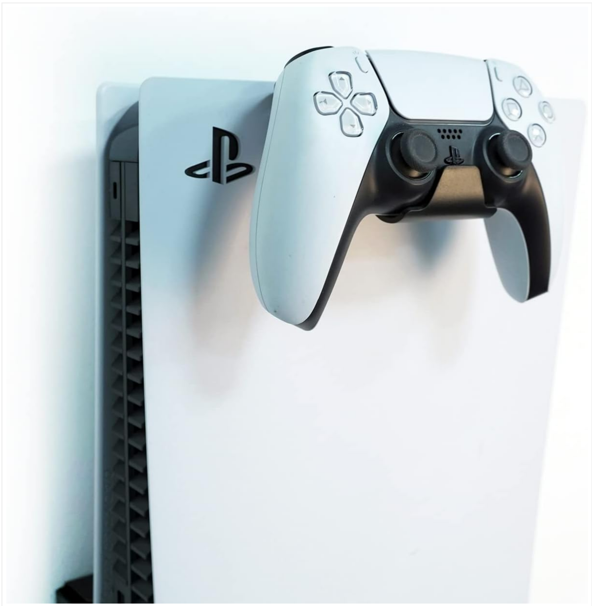
Figure 5: Controller holder attached to the mounted PS5.