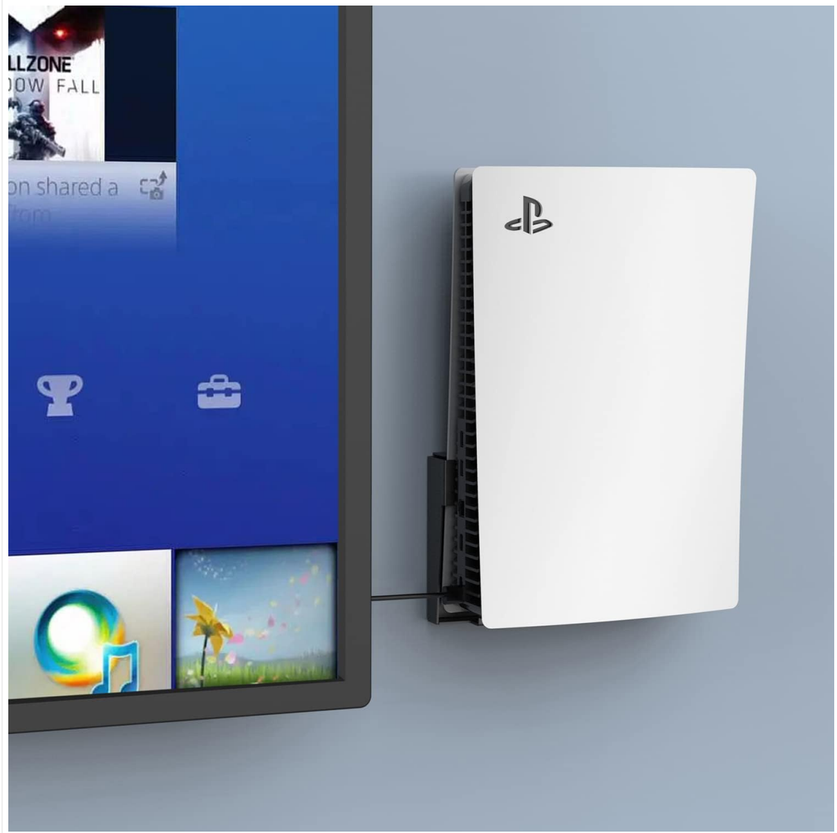
Figure 2: PS5 console mounted vertically on the wall.

Video: Official Monzlteck installation guide for the PS5 wall mount.