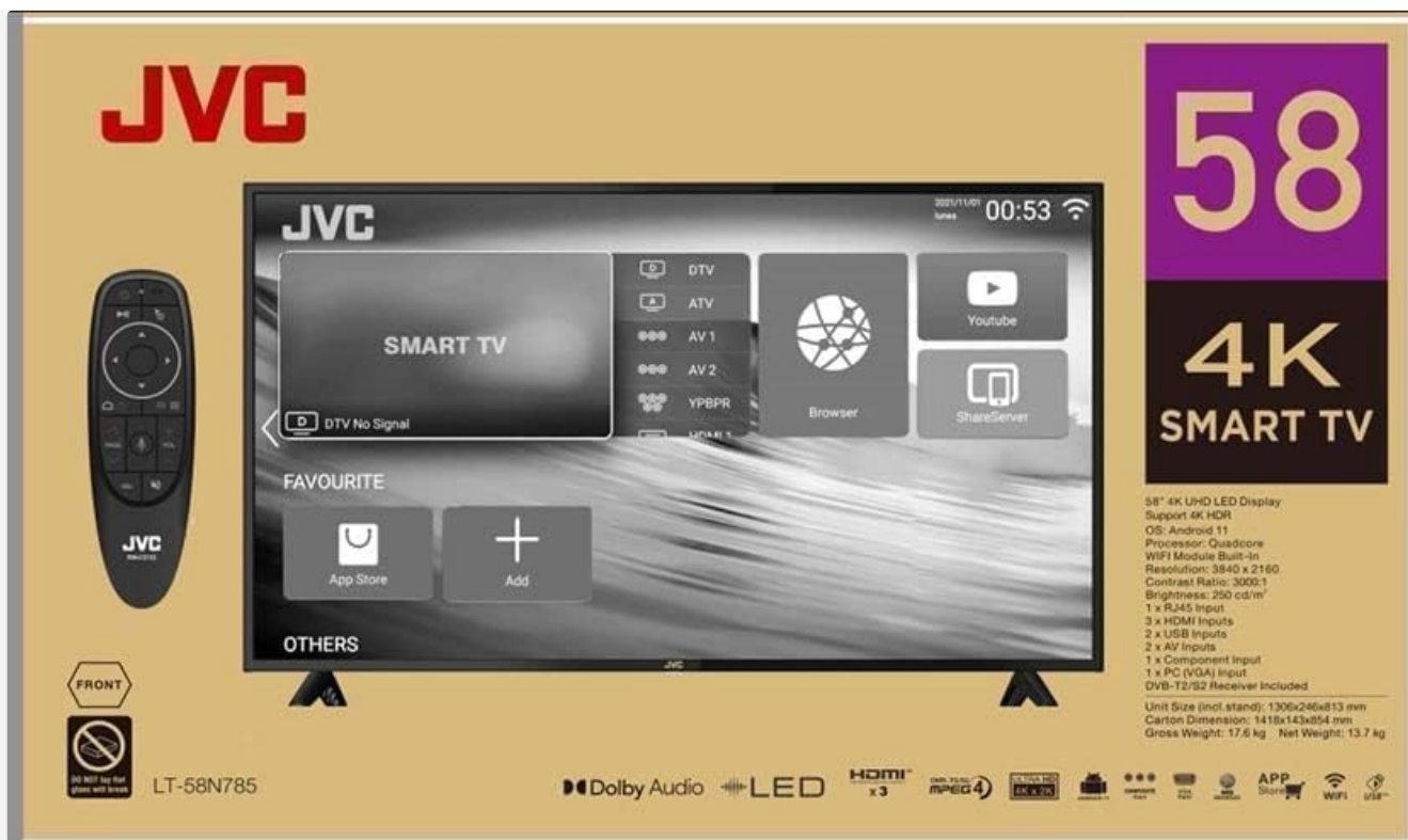
Image: JVC 58 Inch 4K UHD Smart TV packaging contents, showing the TV and remote control.