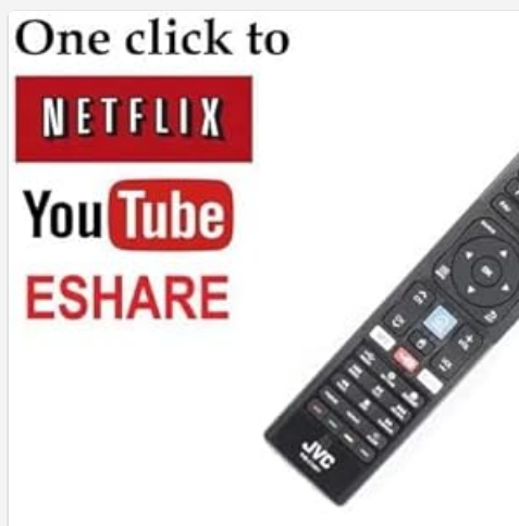
Image: Close-up of the JVC Smart TV remote control, highlighting dedicated streaming service buttons.