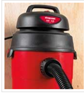
Figure 3: Wall-mounted setup for convenient storage and access.