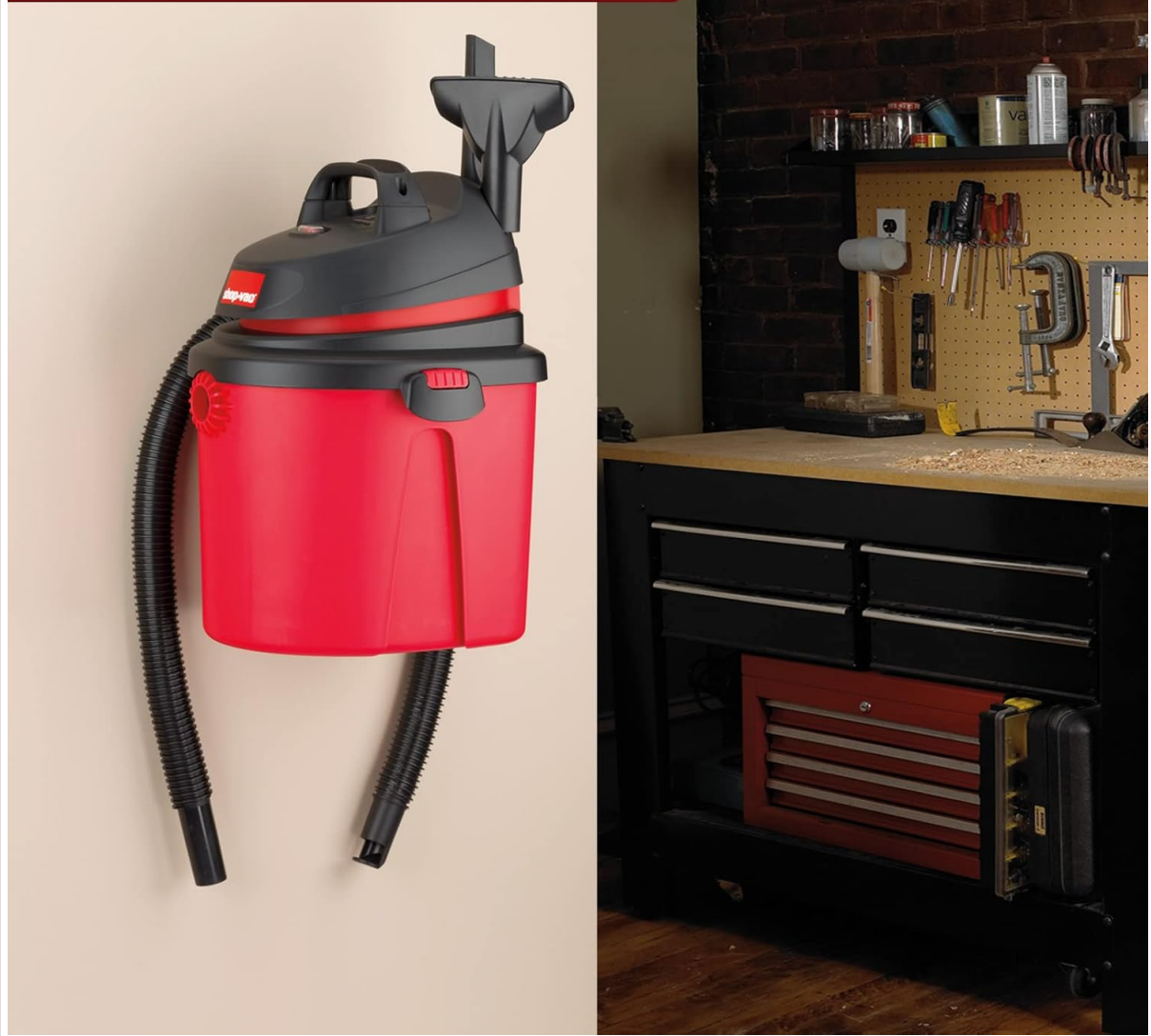
Figure 1: Main view of the Shop-Vac 4 Gallon 4.0 Peak HP Wet/Dry Vacuum.