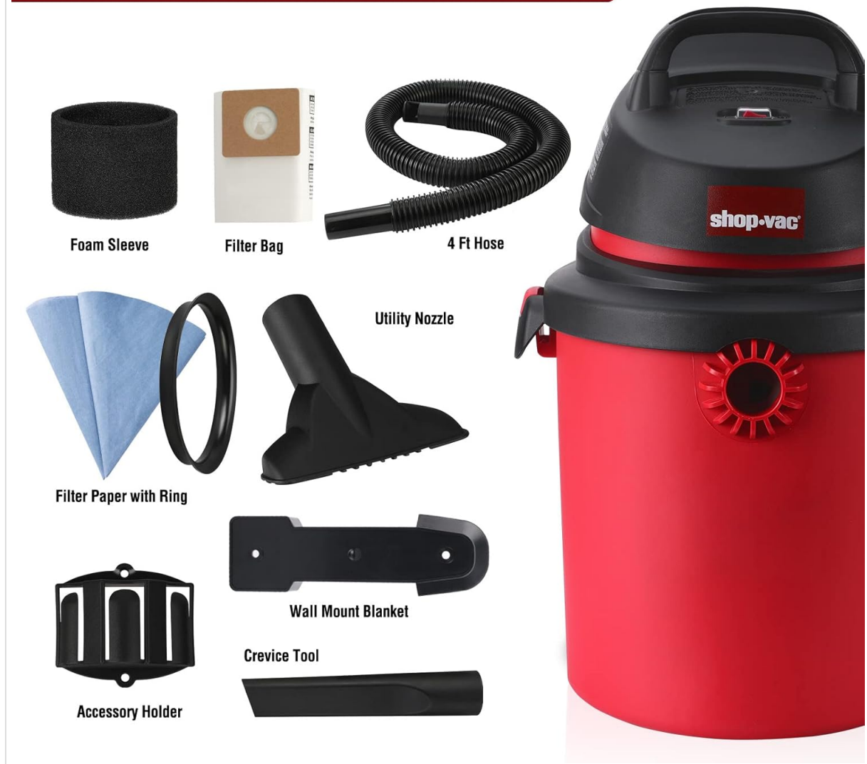
Figure 6: Ideal for workshop cleanup, including wood chips.