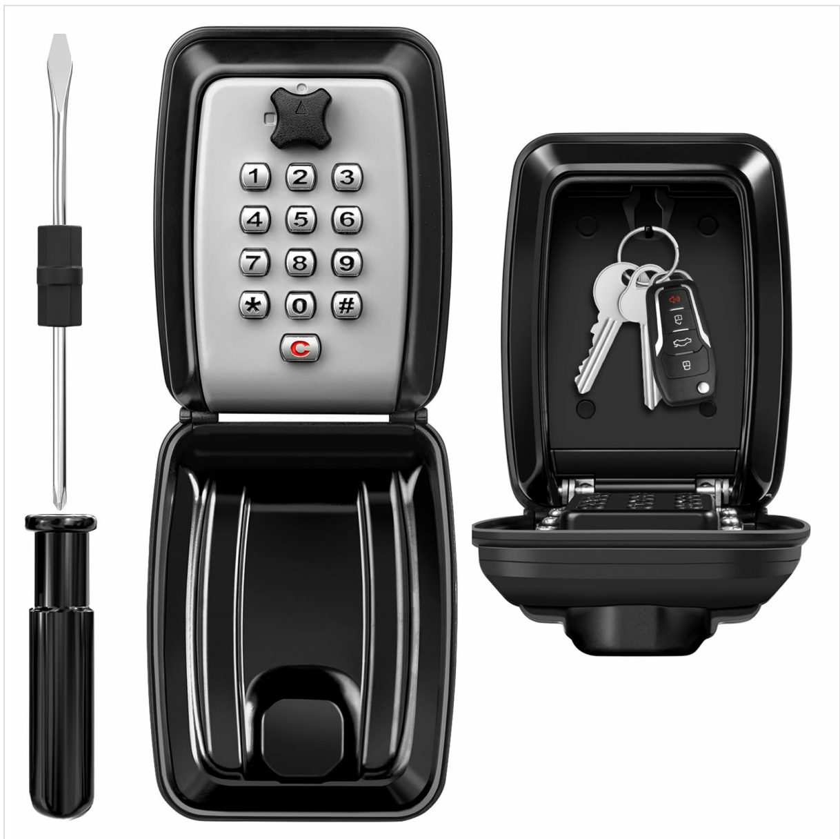
The HUANLANG G14 Wall Mounted Key Lock Box, designed for secure key storage.