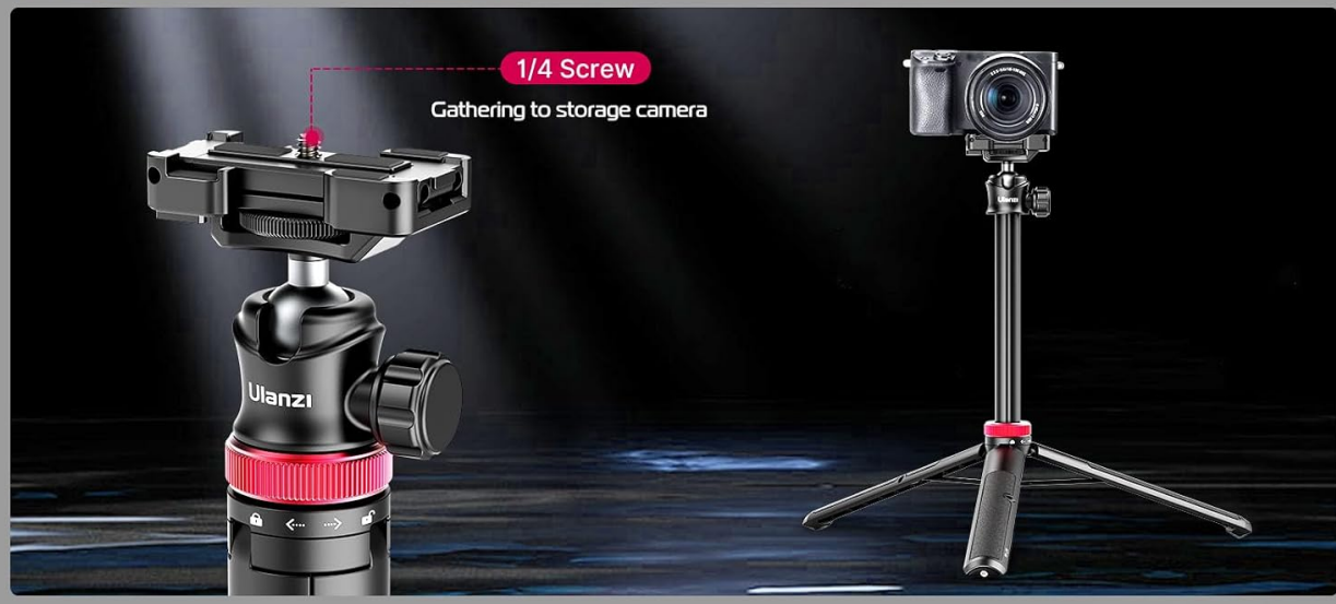
Image: Detailed view of the 2-in-1 integrated clip design, illustrating how it converts between a phone holder with a cold shoe mount and a 1/4-inch screw for camera attachment.