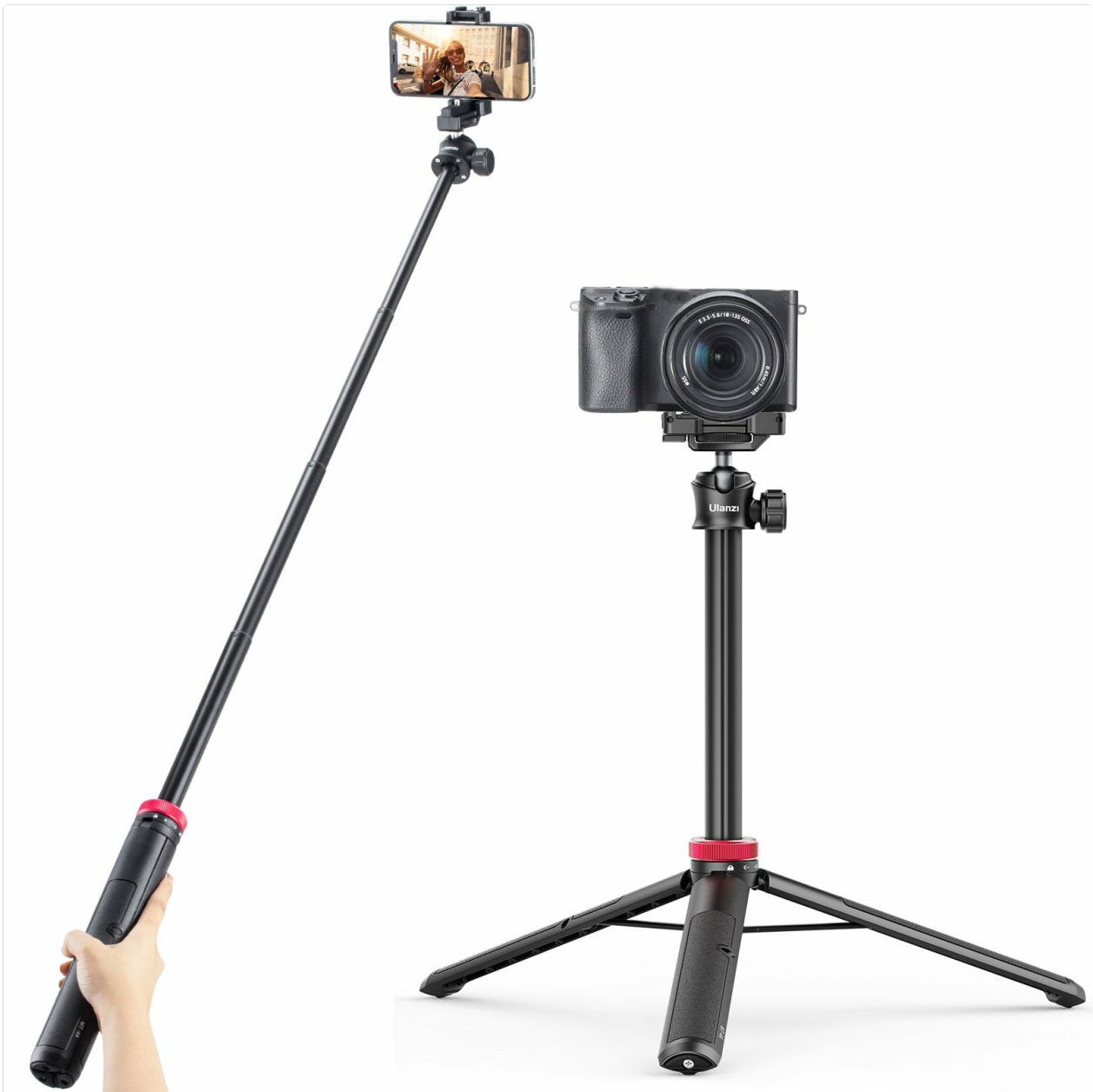
Image: The ULANZI MT-44 tripod in its compact, folded state, showcasing its portable design.