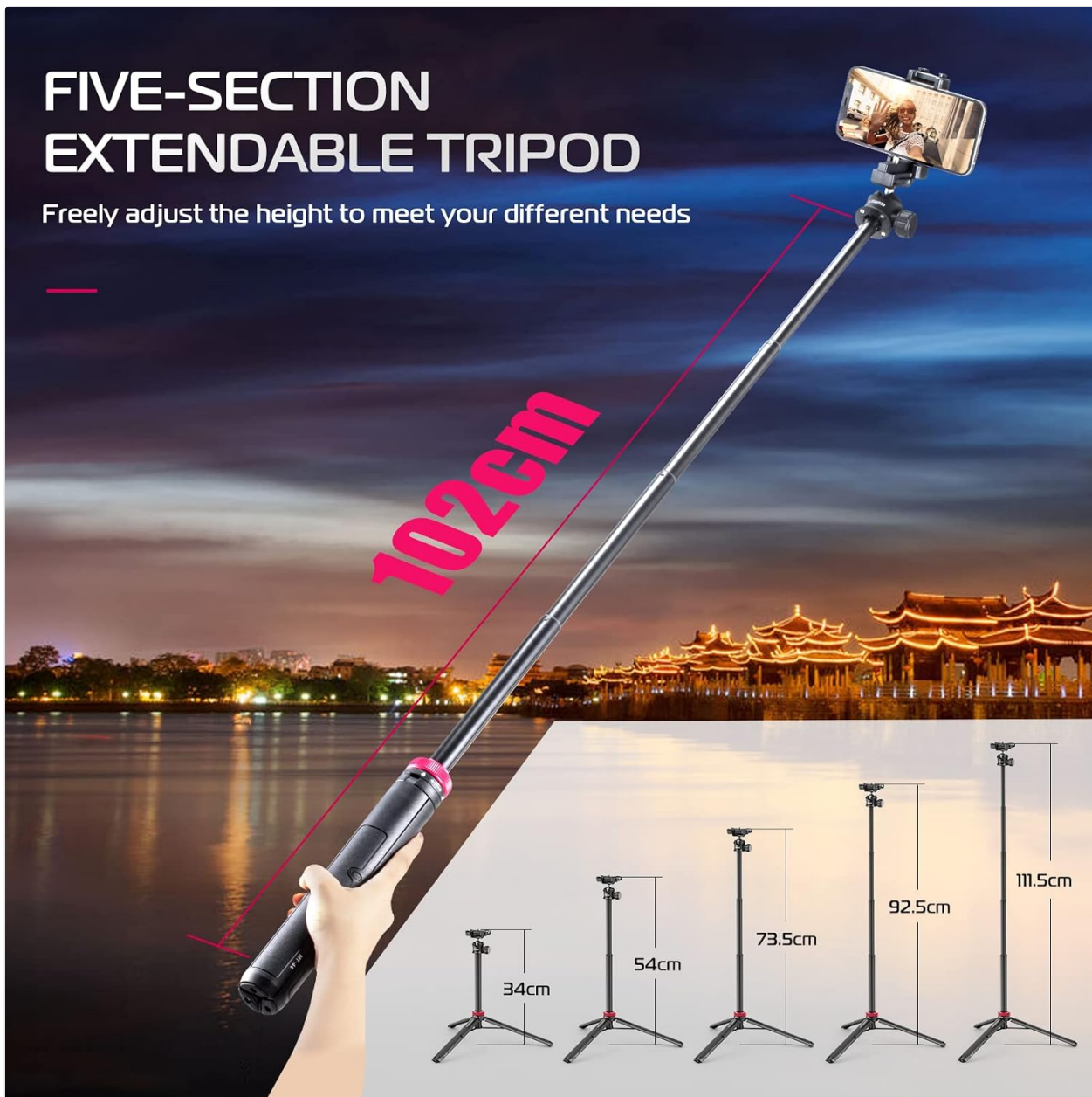
Image: The ULANZI MT-44 tripod illustrating its five-section extendable design, showing different height options from compact to fully extended.

Freely adjust the height to meet your different needs