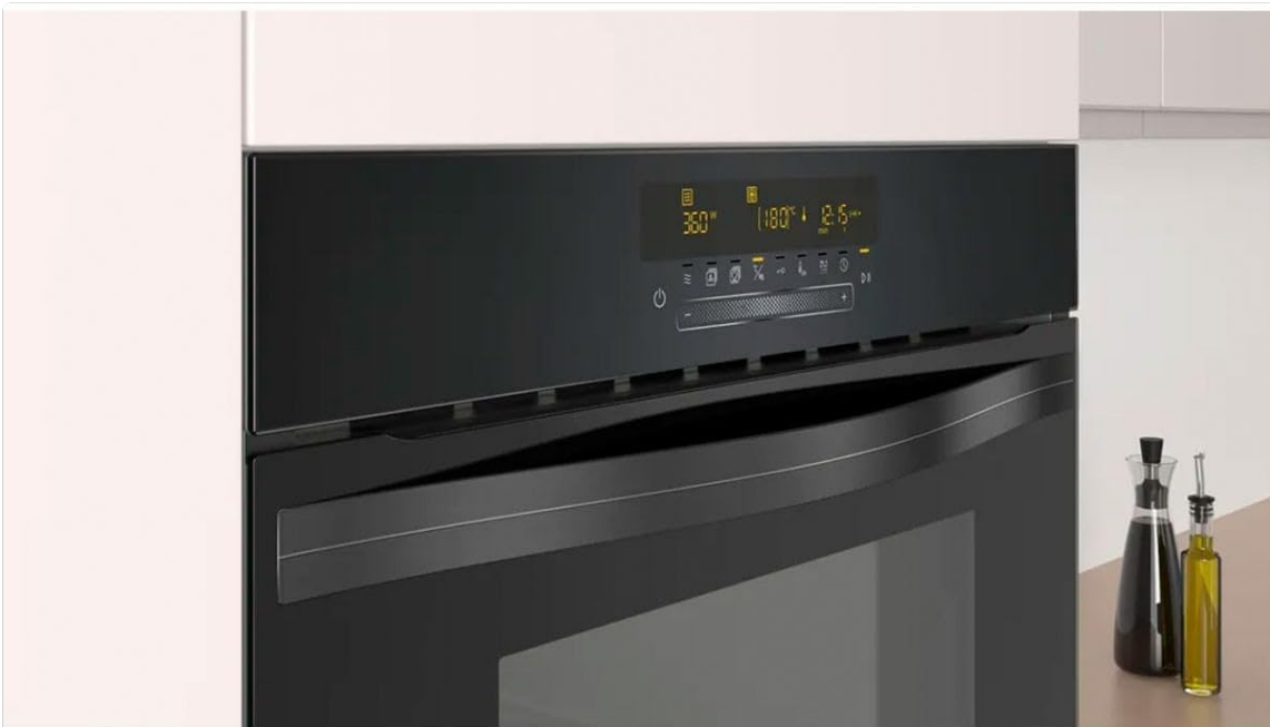
Image Description: A detailed close-up of the oven's control panel. The digital display shows "360°", "180°C", and "12:15", indicating various settings and the current time. Below the display are several touch buttons and a central rotary selector for adjusting functions and values.

The appliance is controlled via an intuitive interface featuring buttons and a digital display. Specific functions are selected and adjusted using these controls.