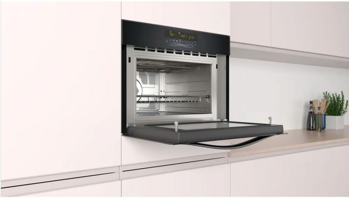
Image Description: The Balay built-in microwave oven is shown with its door fully open, revealing the interior cavity. The inside appears spacious, with a ceramic lining and a metal rack, indicating its 44-liter capacity.