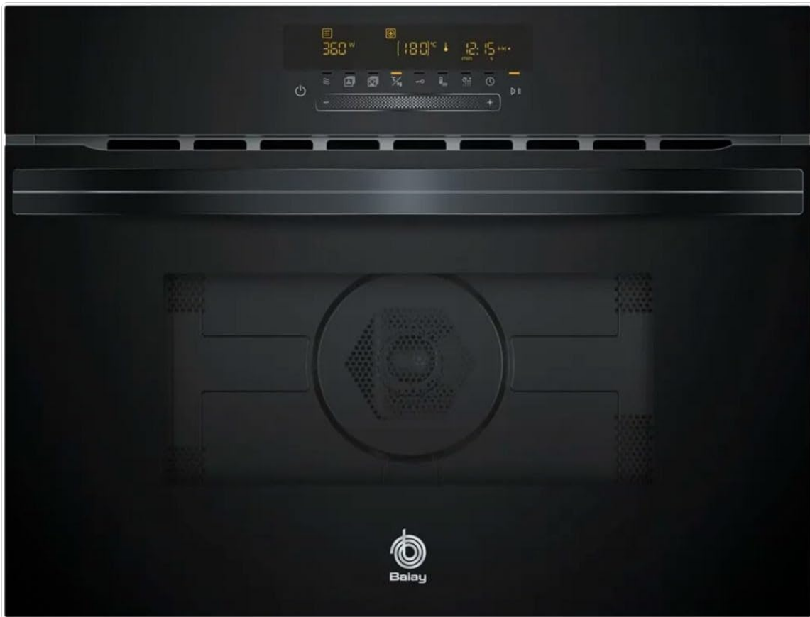
Image Description: A full front view of the Balay built-in microwave oven. It features a sleek black design with a digital display showing time and settings, and a row of touch-sensitive buttons and a rotary knob for control.