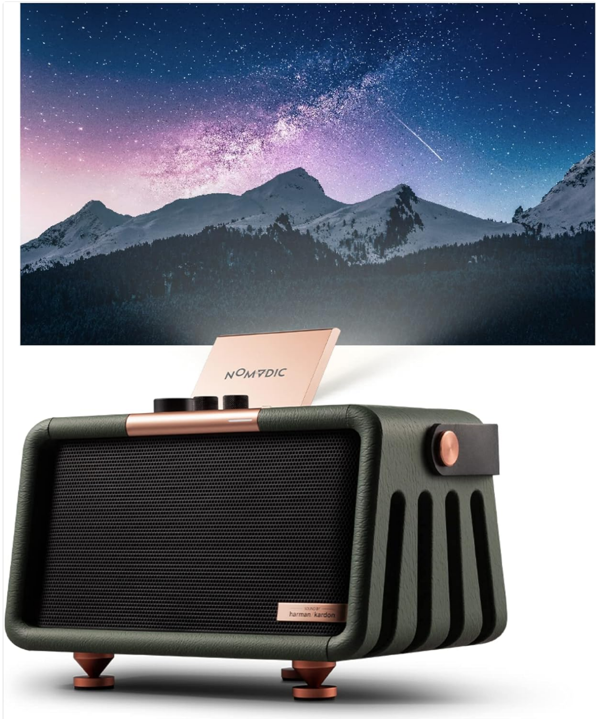
The NOMVDIC X300 projector, showcasing its compact design and front speaker grille.

Familiarize yourself with the components and ports of your NOMVDIC X300 projector.