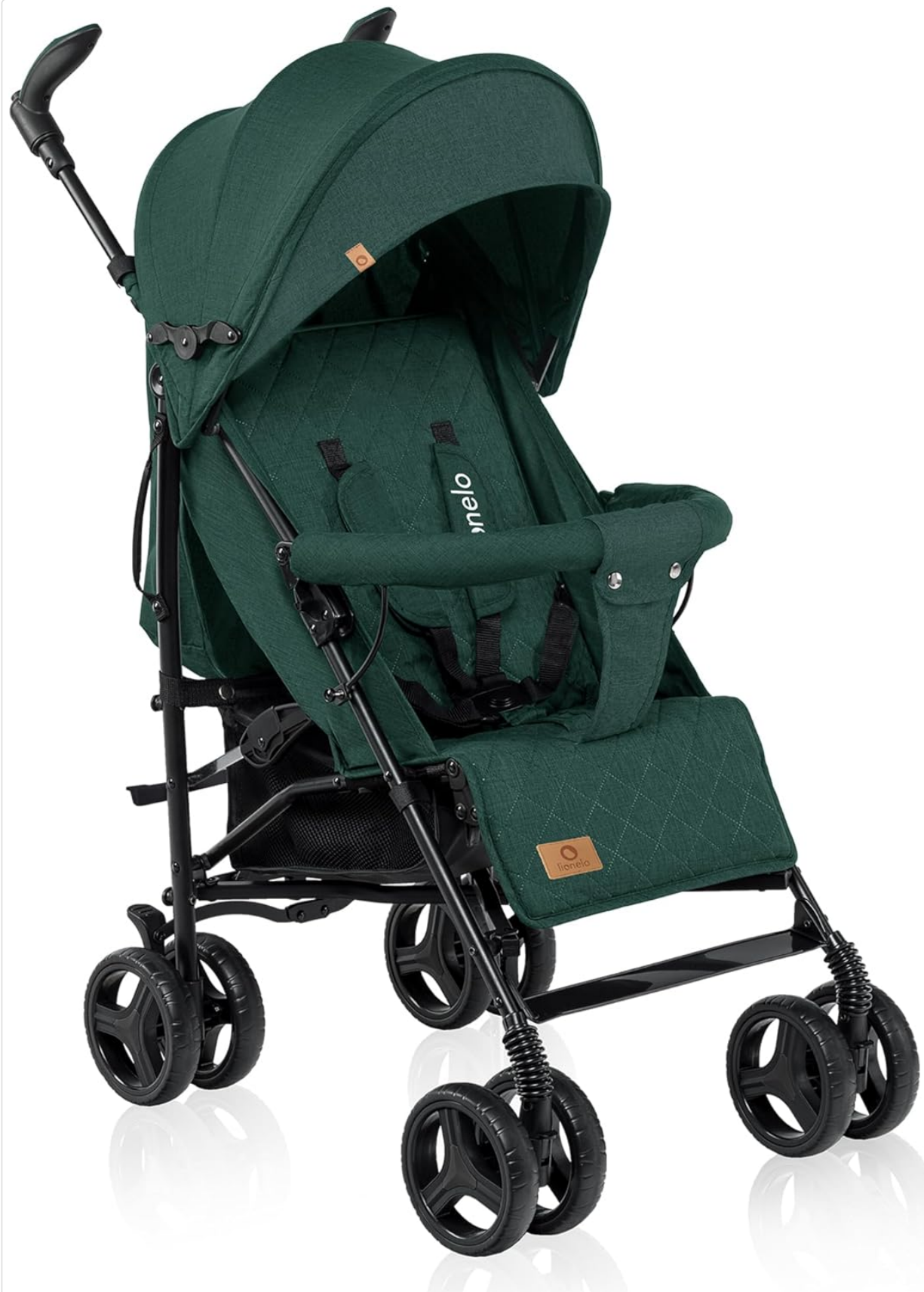
Image 3.1: The LIONELO Irma Stroller in Green Forest color, showcasing its overall design and features.