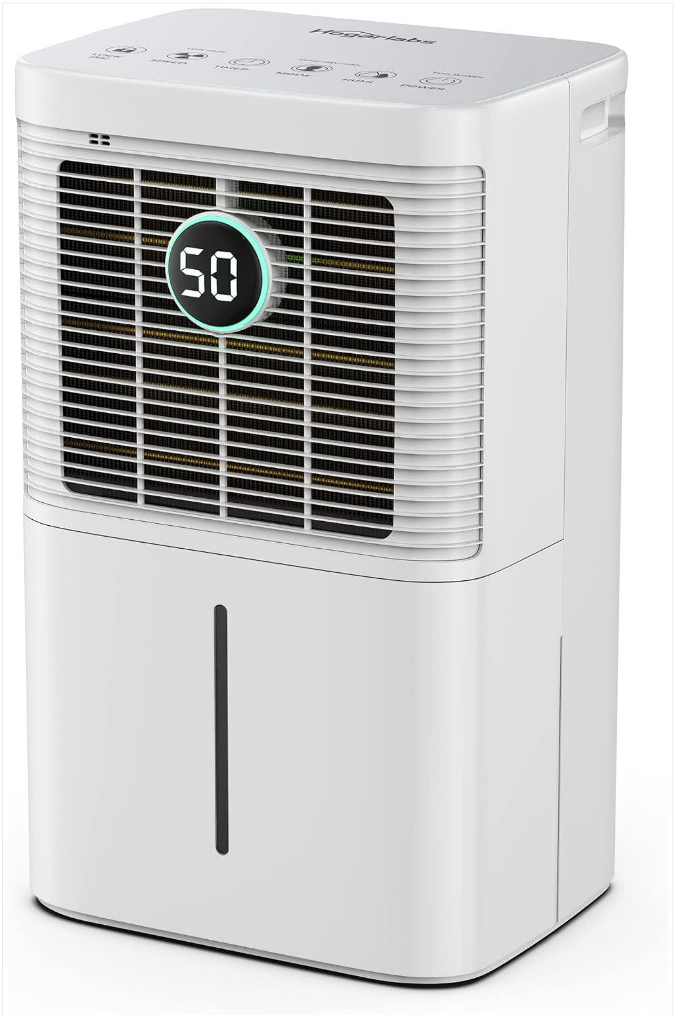
Figure 1: HOGARLABS 25 Pints Dehumidifier

Excess humidity can lead to various issues such as mold growth, allergens, floor damage, wet clothes, damp