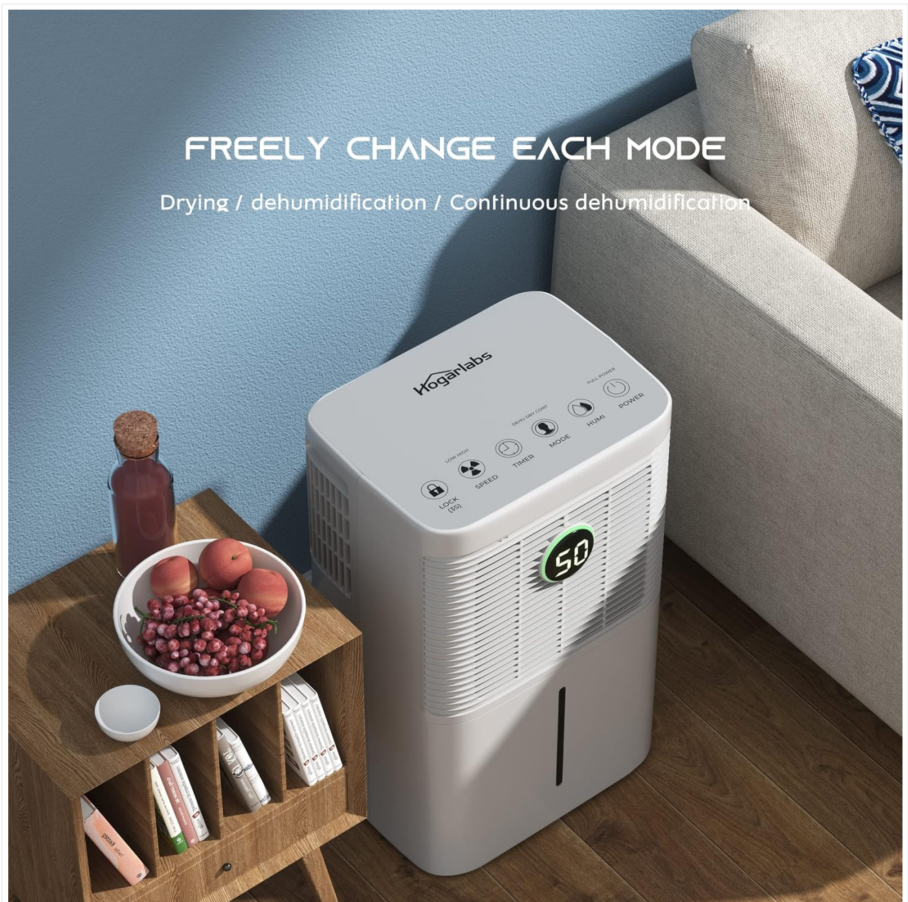
Figure 4: Control Panel Overview