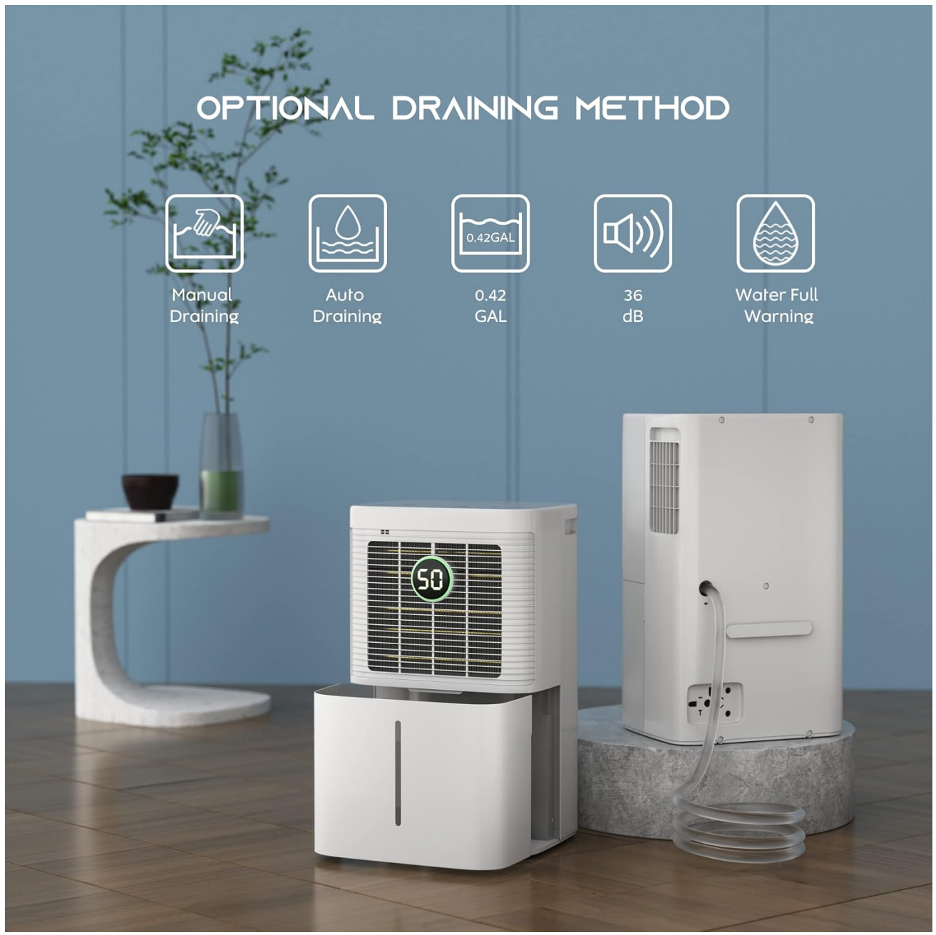
Figure 3: Drainage Options

to allow gravity to drain water into a suitable floor drain or container.