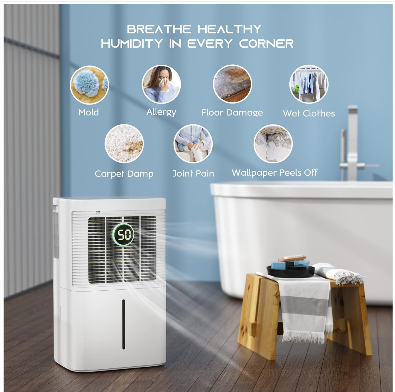
Figure 2: Impact of Humidity on Home and Health

carpets, joint pain, and wallpaper peeling. This dehumidifier helps mitigate these problems by maintaining optimal humidity levels.