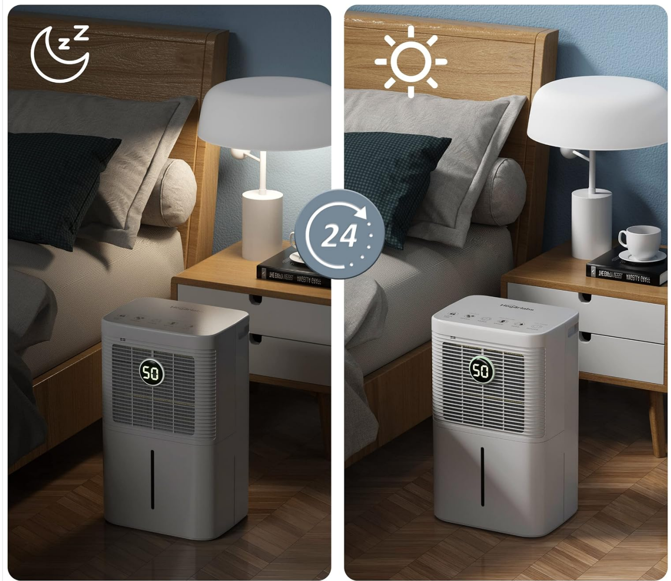
Figure 6: 24-Hour Operation