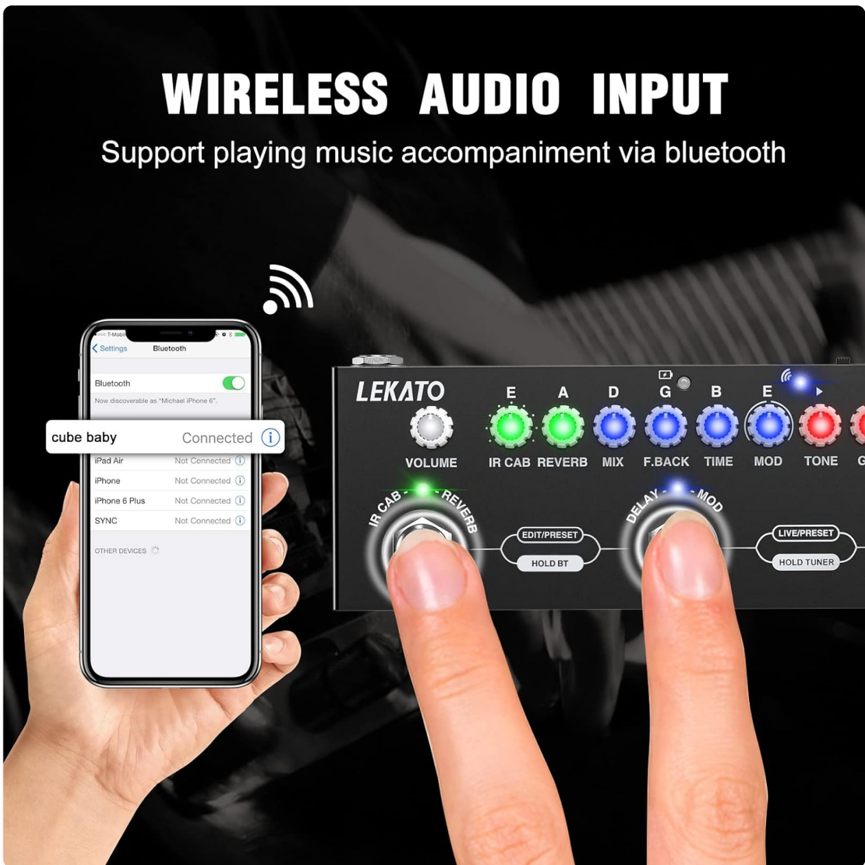
An image showing a hand interacting with the pedal while a smartphone displays a Bluetooth connection screen, indicating wireless audio input support.