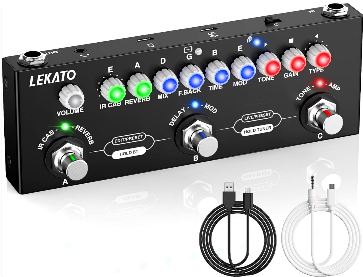
A black multi-effects guitar pedal with various knobs and footswitches, accompanied by a USB cable and a 3.5mm audio cable.