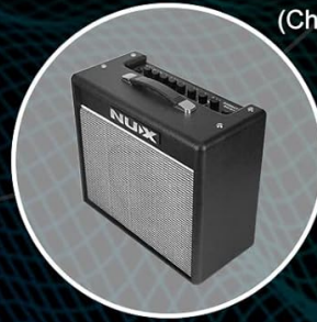
IR CABINET MODULE (8 Classic Cabinet simulations)

Diagram illustrating the pedal's features including AMP Module (9 classic preset preamp), Effect Module (Chorus, Phaser, Delay, Reverb), Volume Adjustment, Tuner, and IR Cabinet Module (8 Classic Cabinet simulations).