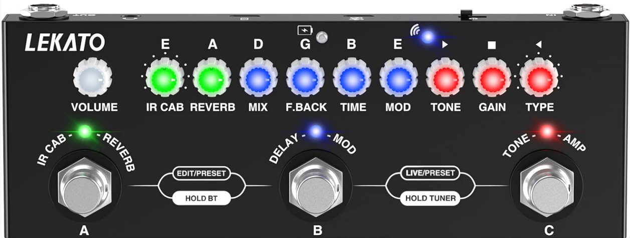
Top-down and front views of the LEKATO Cube Baby pedal, highlighting the IN, OUT, USB, and headphone ports.