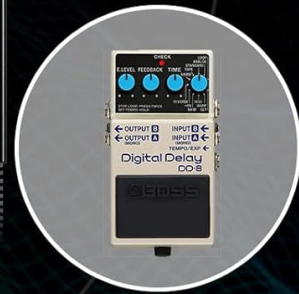
EFFECT MODULE (Chorus, Phaser, Delay, Reverb)