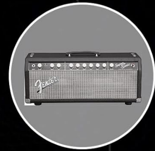
AMP MODULE (9 classic preset preamp)