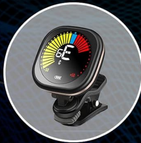
TUNER (Long press "B+C" )