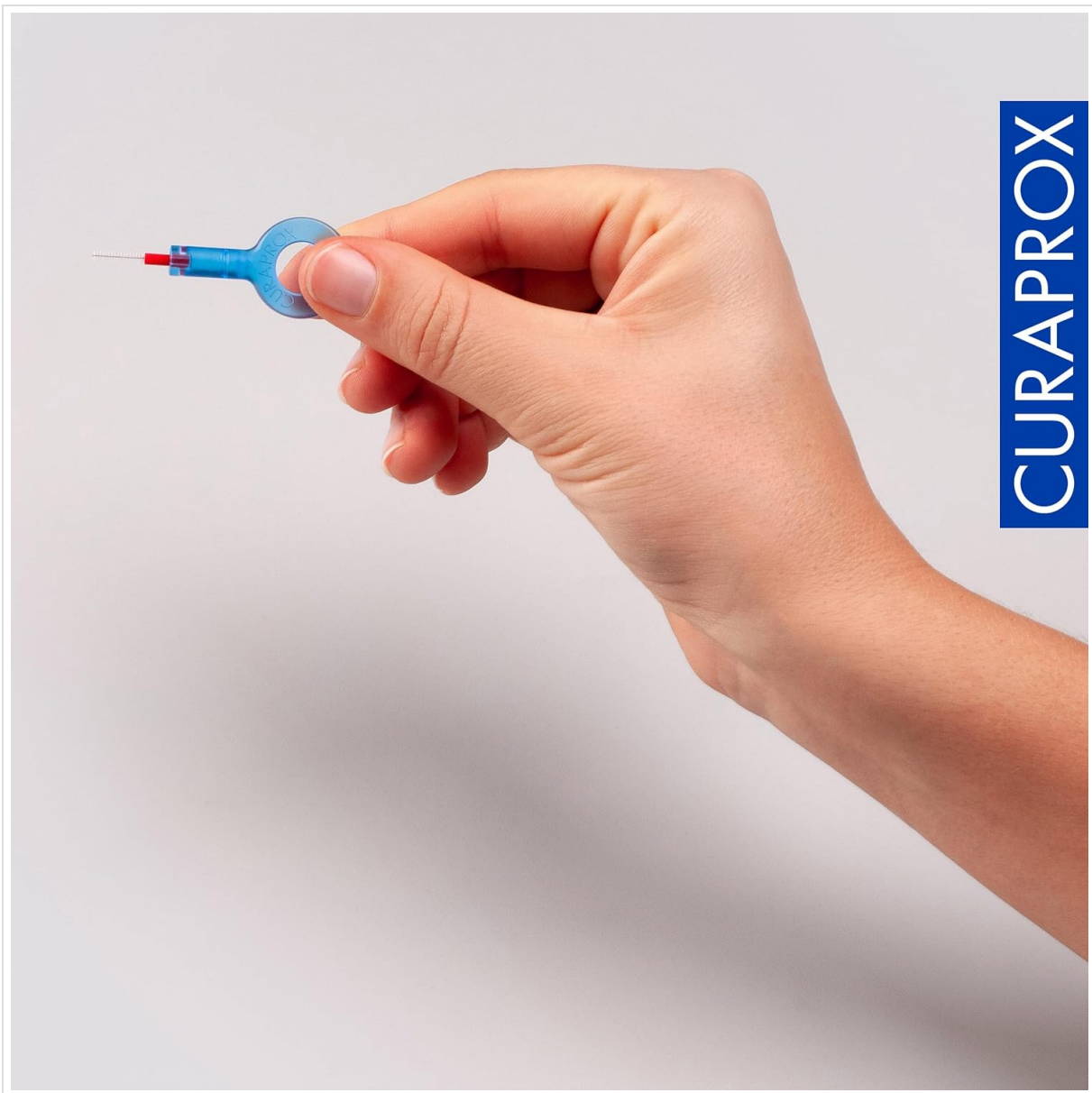
Figure 4: Demonstrating the use of a Curaprox interdental brush.