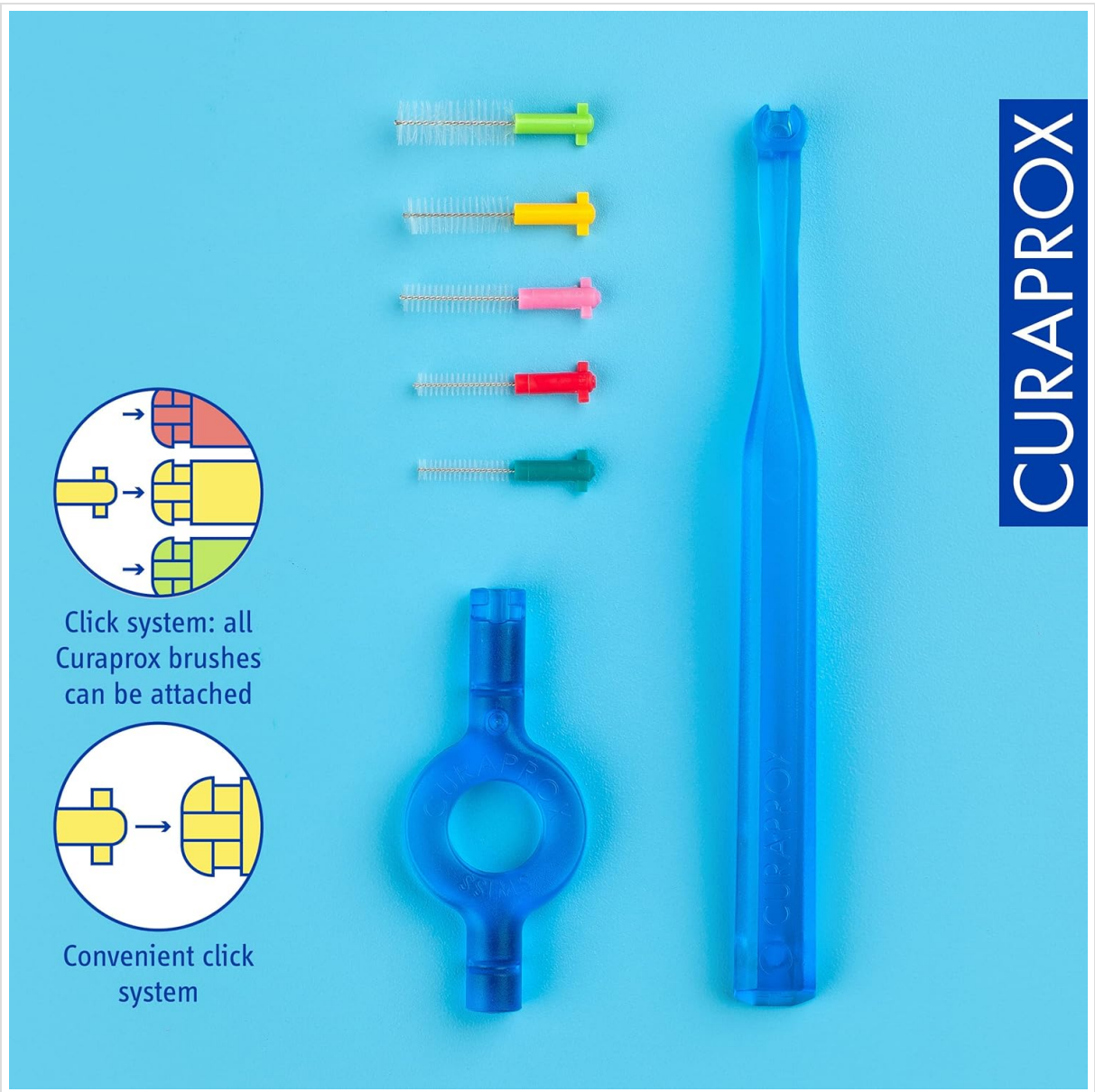
Figure 2: Interdental brushes and holders with click system.