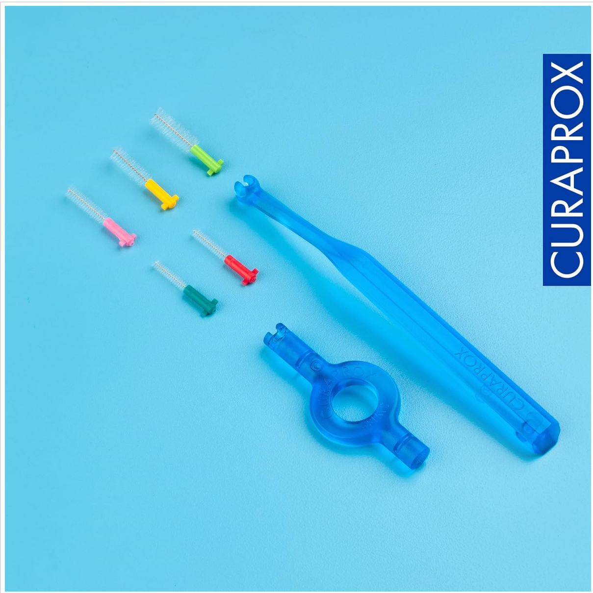
Figure 3: All components of the Curaprox CPS Prime Start set.