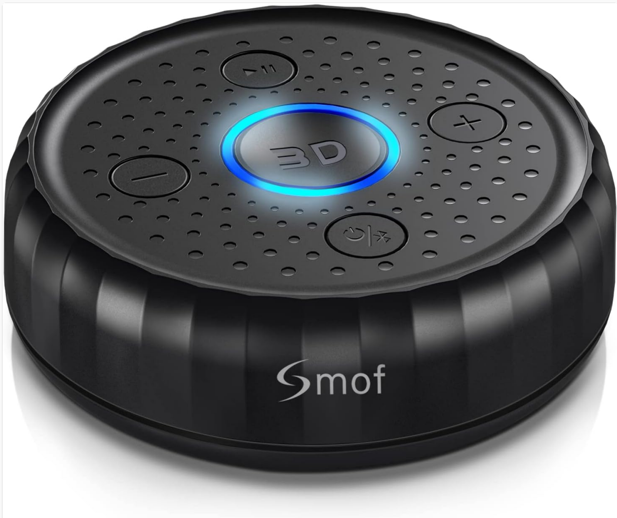
Image: The Smof Fino1 Bluetooth 5.0 Audio Receiver.

The Smof Fino1 Bluetooth 5.0 Audio Receiver is designed to upgrade traditional wired audio systems with Bluetooth connectivity. This device allows you to wirelessly stream audio from your smartphone, tablet, or