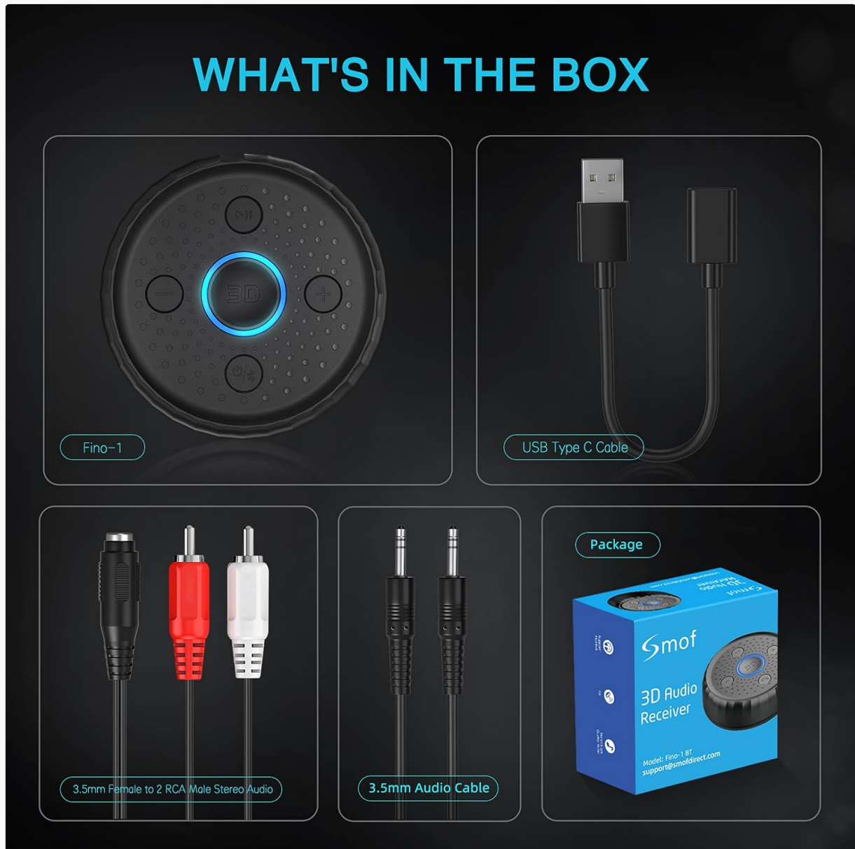
Image: Contents of the Smof Fino1 Bluetooth Audio Receiver package.