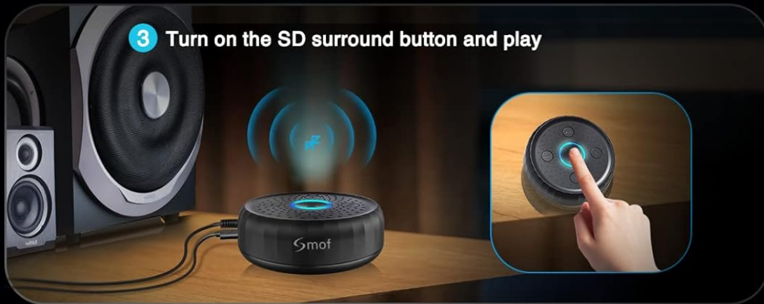
Image: Step-by-step setup guide for the Smof Fino1 Bluetooth Receiver.