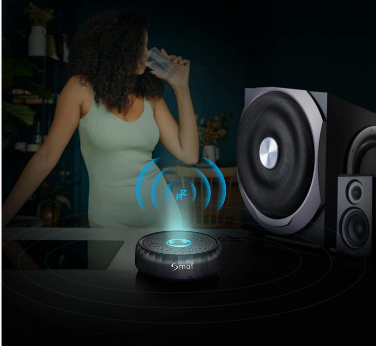
Image: The Smof Fino1 receiver highlighting the 3D button.