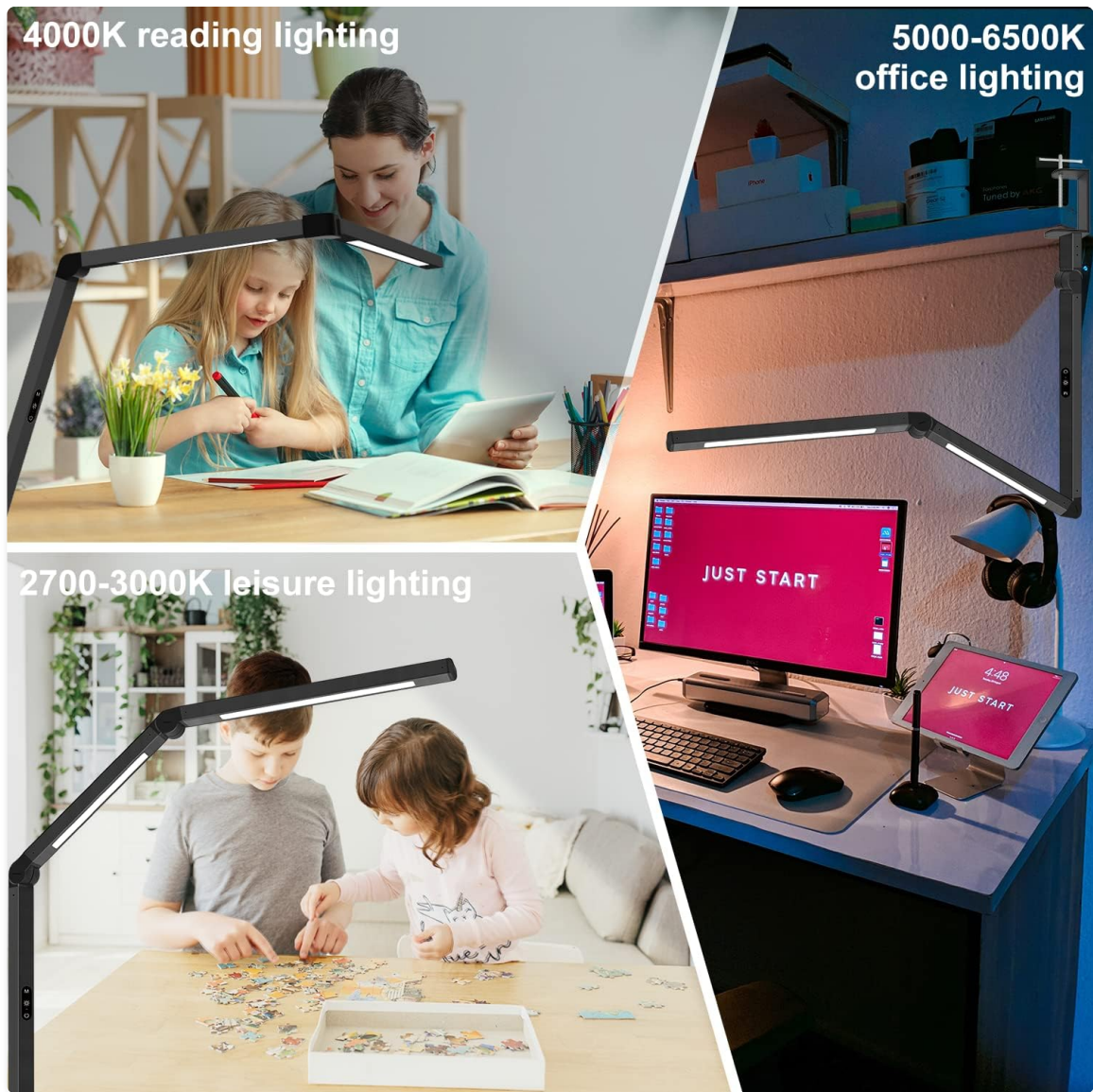
Image: Depicts the lamp providing appropriate lighting for different activities: 4000K for reading, 2700-3000K for leisure, and 5000-6500K for office work.