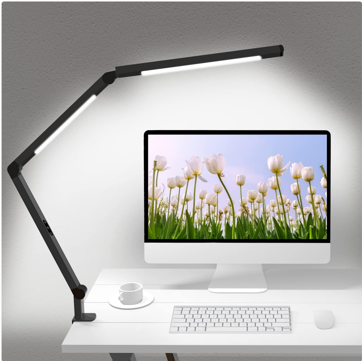
Image: The Micomlan LED Desk Lamp in use, providing wide illumination over a desk setup.