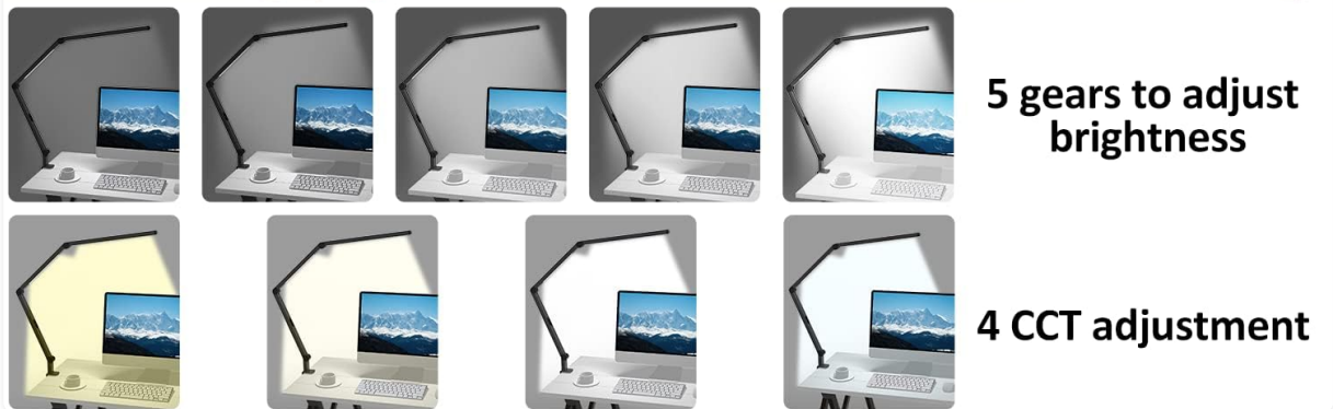
Image: Visual representation of the lamp's 5 brightness settings and 4 color temperature options.

Your browser does not support the video tag.