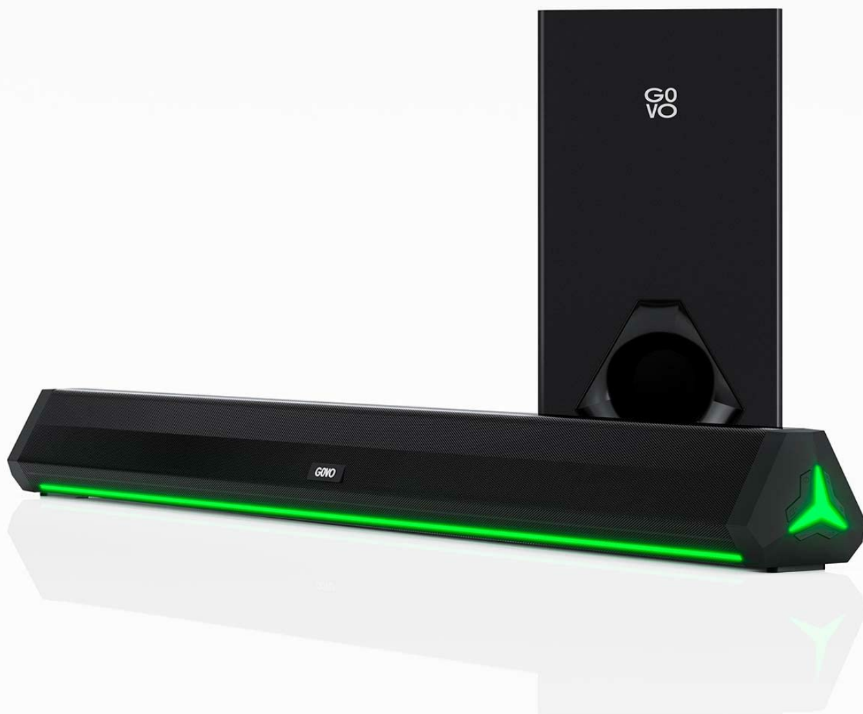
Image 1.1: The GOVO GOSURROUND 900 Soundbar and its accompanying wired subwoofer, presented in a platinum black finish.