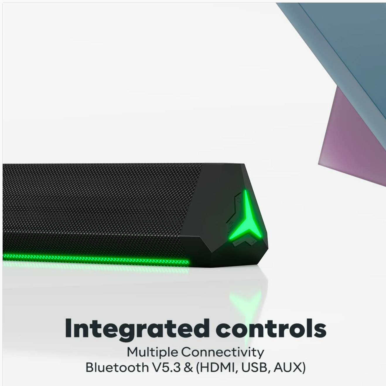
Image 6.1: A detailed view of the soundbar's integrated control panel and various connectivity ports, including HDMI, USB, and AUX.

Insert a USB flash drive (FAT32 format) containing MP3 audio files into the USB port. The soundbar will automatically switch to USB mode and begin playback.