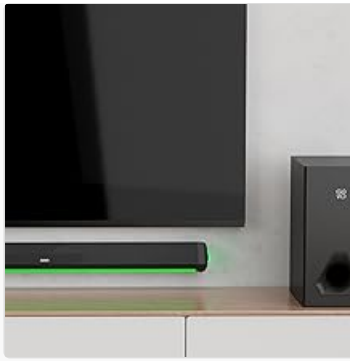
Image 4.2: The soundbar mounted on a wall beneath a television, with the subwoofer placed on a nearby shelf.