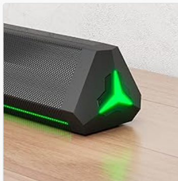
Image 5.3: A close-up view of the soundbar's end, showcasing its integrated green LED lighting.

The soundbar features dynamic LED lighting. Control or disable these lights using the remote control if desired.