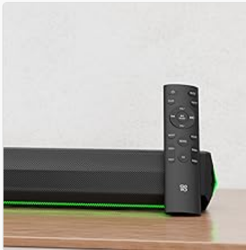
Image 5.1: The soundbar and its remote control, used for adjusting settings and selecting input sources.

Use the 'Input' button on the remote or the soundbar's integrated controls to cycle through available input sources: Bluetooth, HDMI (ARC), AUX, USB.