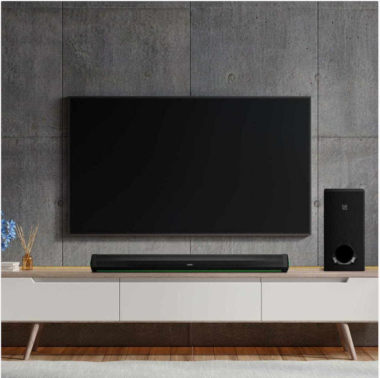
Image 4.1: Example placement of the soundbar on a TV stand and the subwoofer beside it.