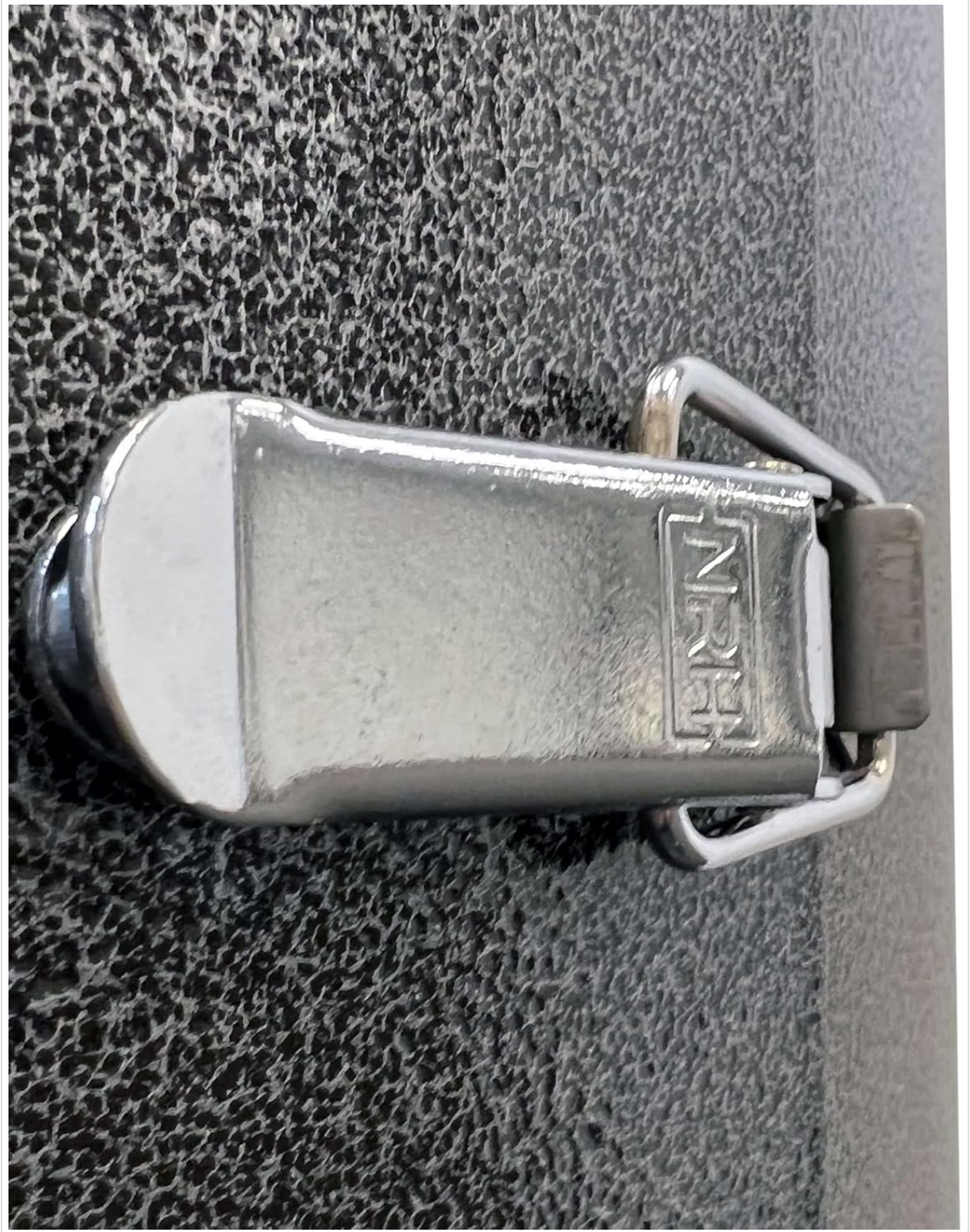
Image: A close-up view of the secure latch mechanism on the heater's base, which provides access to the propane tank compartment.