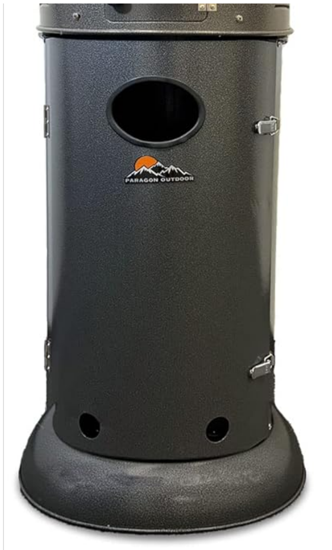
Image: The Paragon Outdoor Vulcan Propane Patio Heater, showcasing its tall, cylindrical design with a visible flame tube and protective cage.