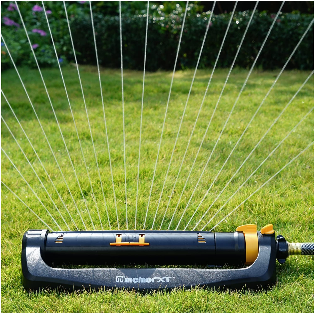
The sprinkler operating with a broad, even spray pattern.