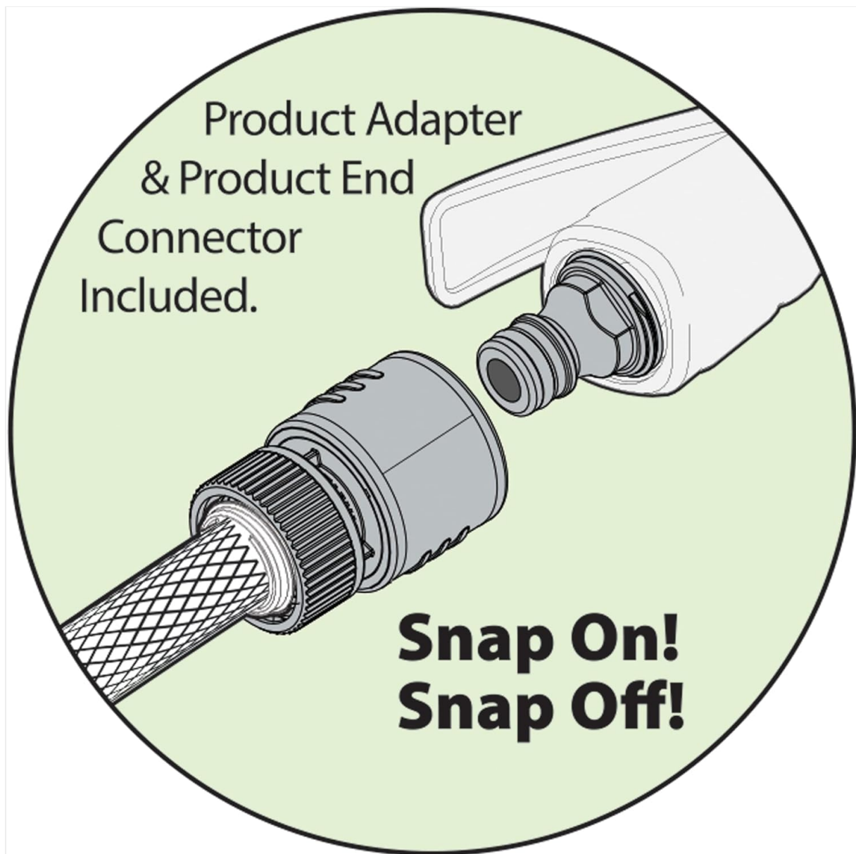
Illustration of the Quick Connect system for easy hose attachment.