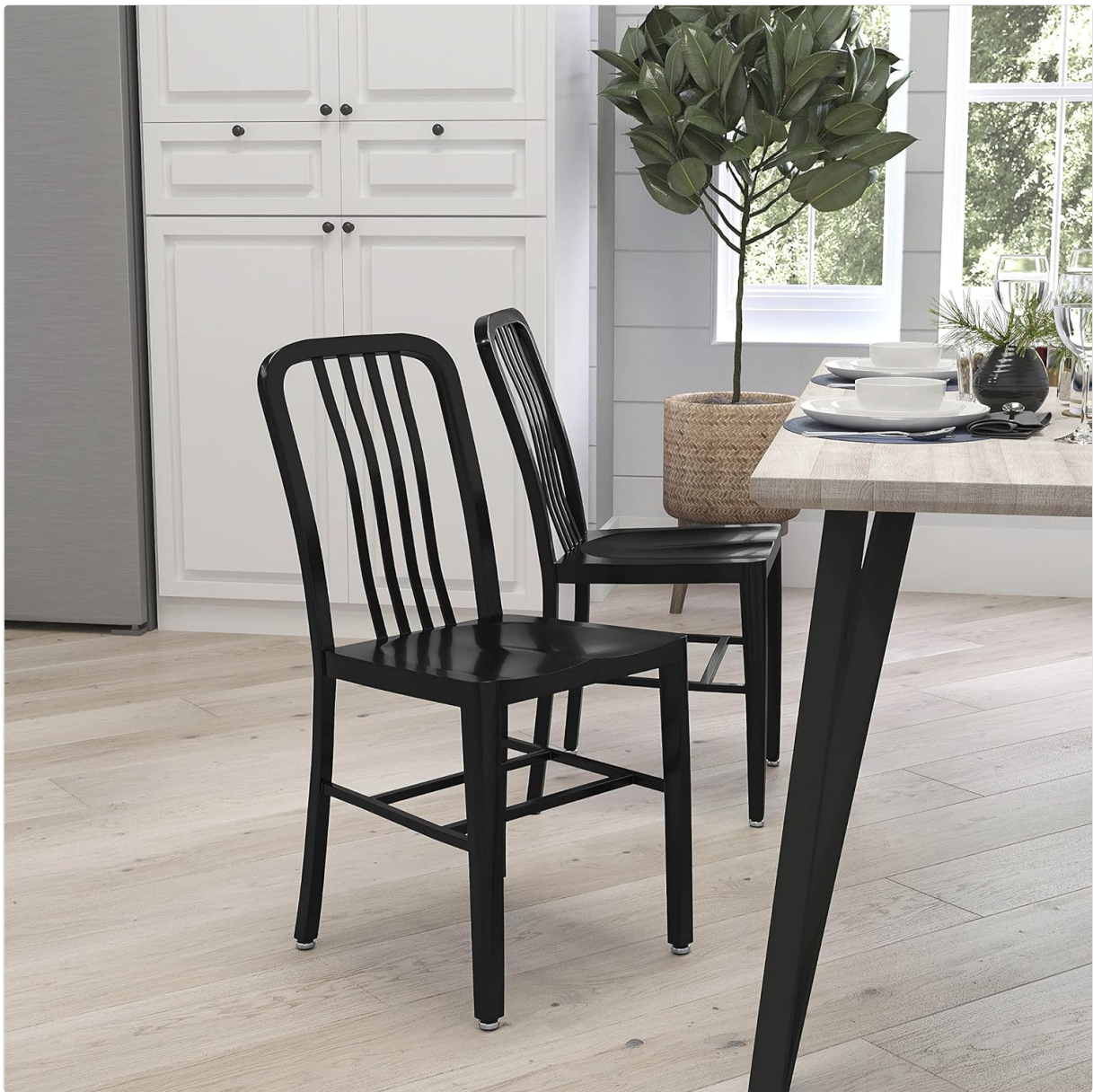
Image 1.1: The Merrick Lane Santorini Dining Chair in a contemporary dining environment, showcasing its sleek black design and slatted back.