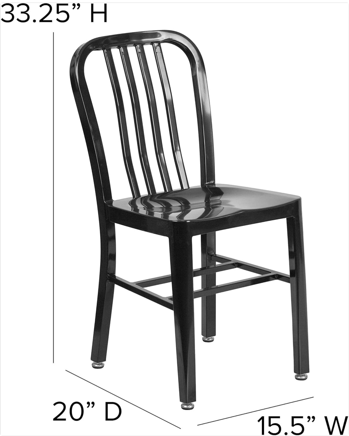
Image 6.1: Dimensional drawing of the Merrick Lane Santorini Dining Chair, indicating its height (33.25"), depth (20"), and