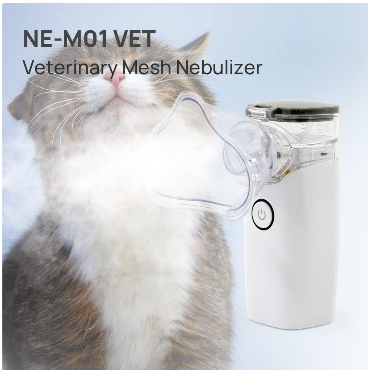
Image: The CONTEC NE-M01VET Nebulizer Machine, a compact white device with a clear mask, positioned next to a cat, highlighting its veterinary application.