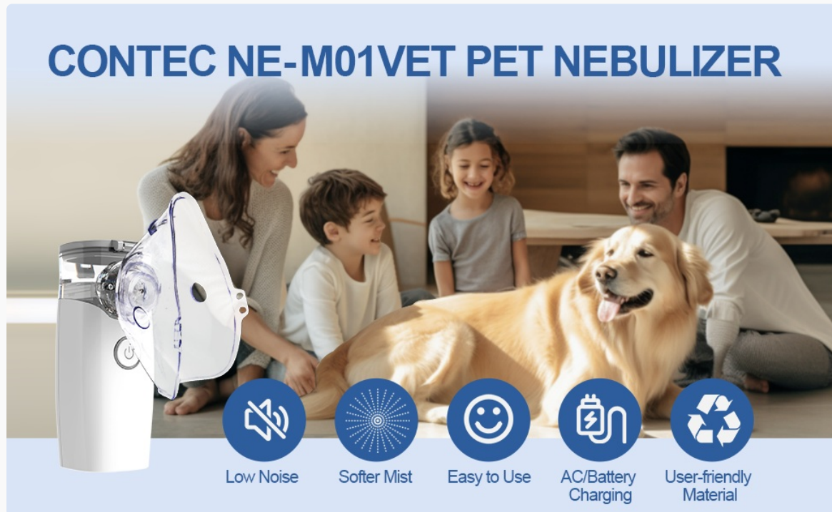
Image: A banner showcasing the CONTEC NE-M01VET Pet Nebulizer with icons representing its key features: Low Noise, Softer Mist, Easy to Use, AC/Battery Charging, and User-friendly Material.

The CONTEC NE-M01VET Nebulizer Machine is a portable and efficient device designed to deliver medication in the form of a fine mist for veterinary applications. Its compact size and quiet operation make it suitable for use at home, during travel, or in outdoor settings, providing a comfortable experience for animals requiring respiratory support. This manual provides essential information for the safe and effective operation, maintenance, and troubleshooting of your nebulizer.