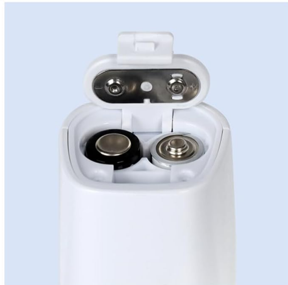
Image: A visual guide demonstrating the two power supply options for the nebulizer: via a plug-in adapter or using two AA batteries.