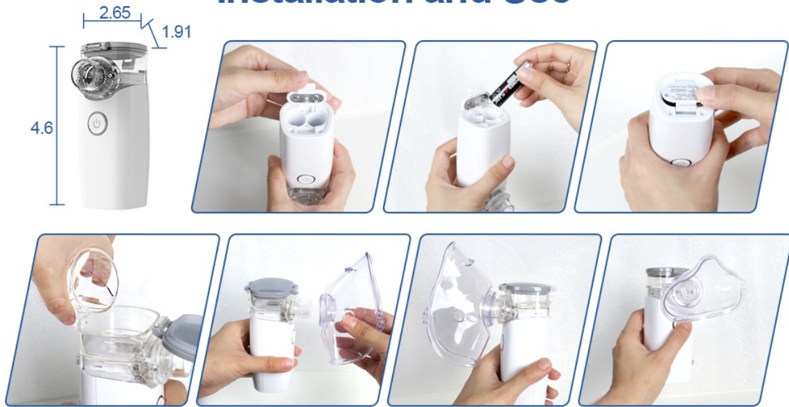
Image: A series of six images demonstrating the installation and use steps, including battery insertion, liquid filling, and mask attachment.