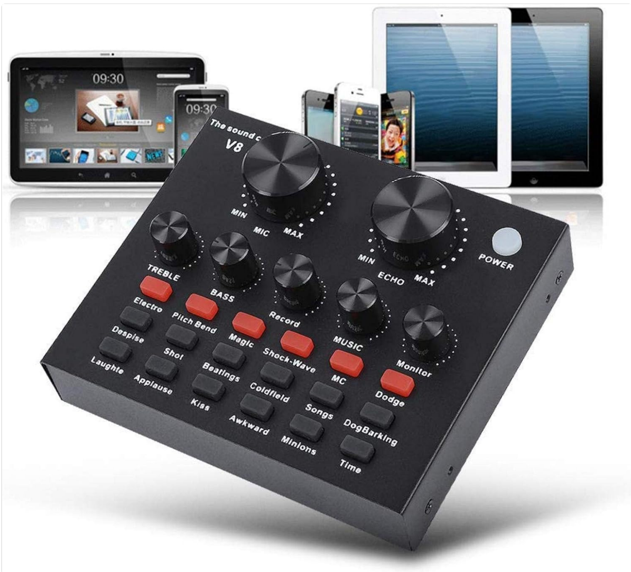
Figure 1: V8 Live Sound Card connected to various devices.