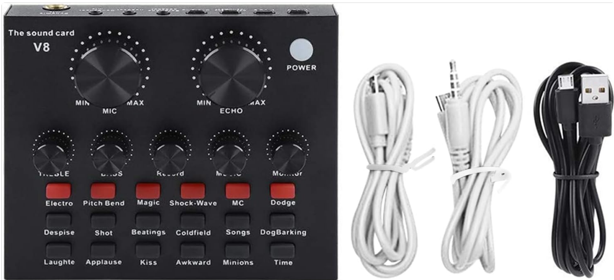
Figure 3: Front panel of the V8 Live Sound Card.