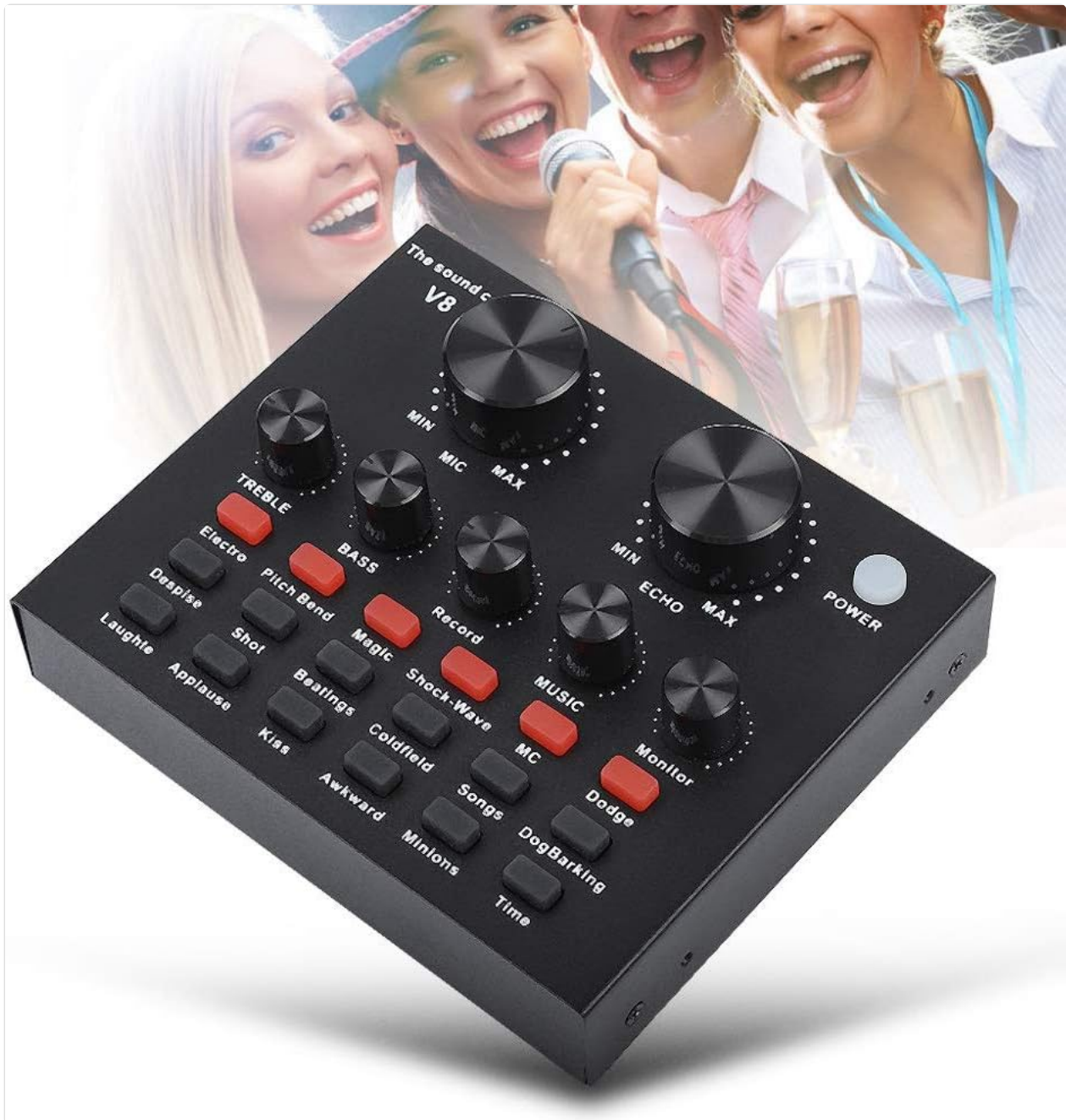
Figure 2: V8 Live Sound Card and its included accessories.