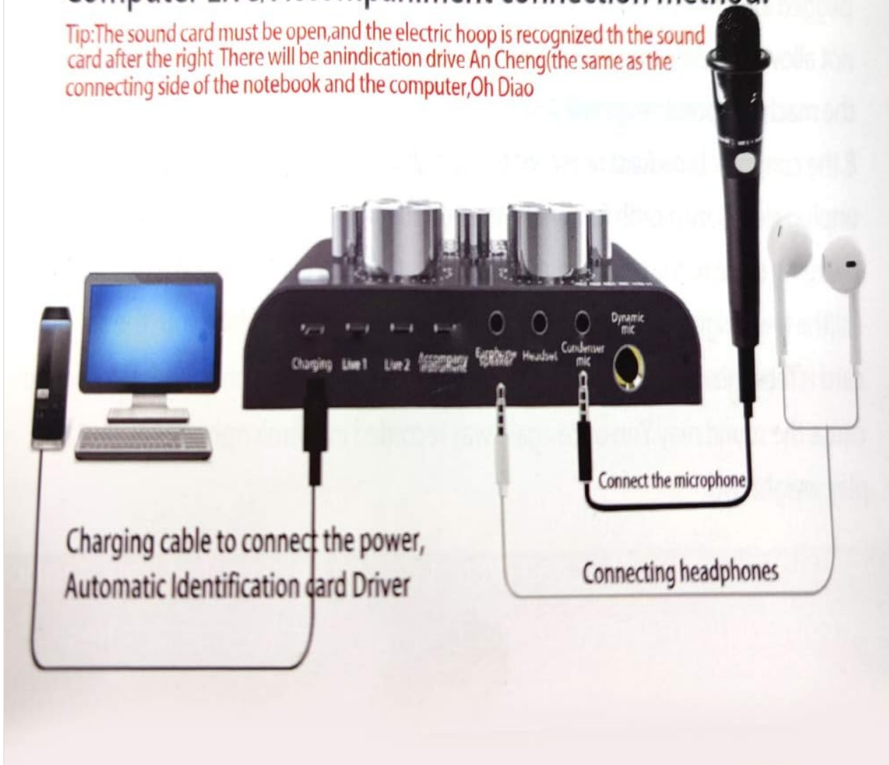
Figure 5: Rear panel ports of the V8 Live Sound Card.

Tip: The sound card must be open, and the electric hoop is recognized by the sound card after the right. There will be an indication drive An Cheng (the same as the connecting side of the notebook and the computer, Oh Diao)