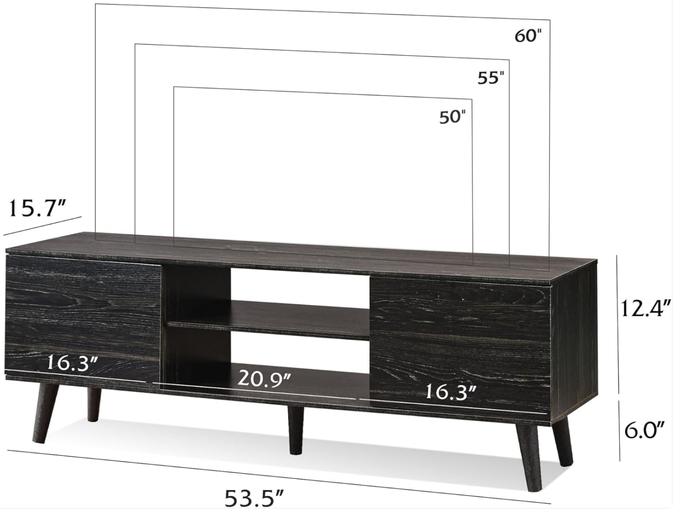
Image: Detailed dimensions of the TV stand, including overall size (53.5" W x 15.7" D x 18.4" H) and maximum weight capacity (150 lbs).