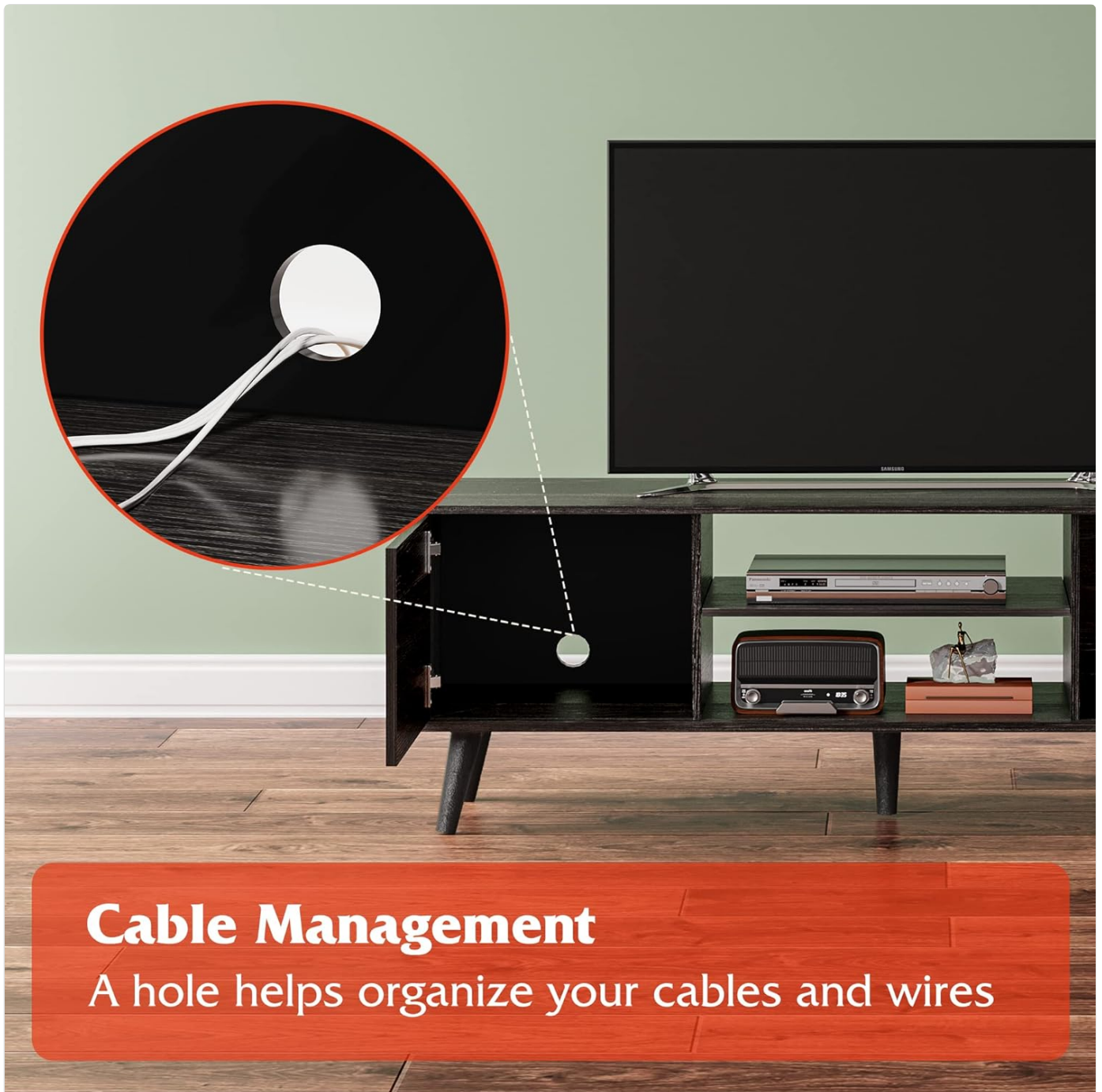
Image: Detail showing the cable management hole located on the back panel of the TV stand, designed for organizing wires.