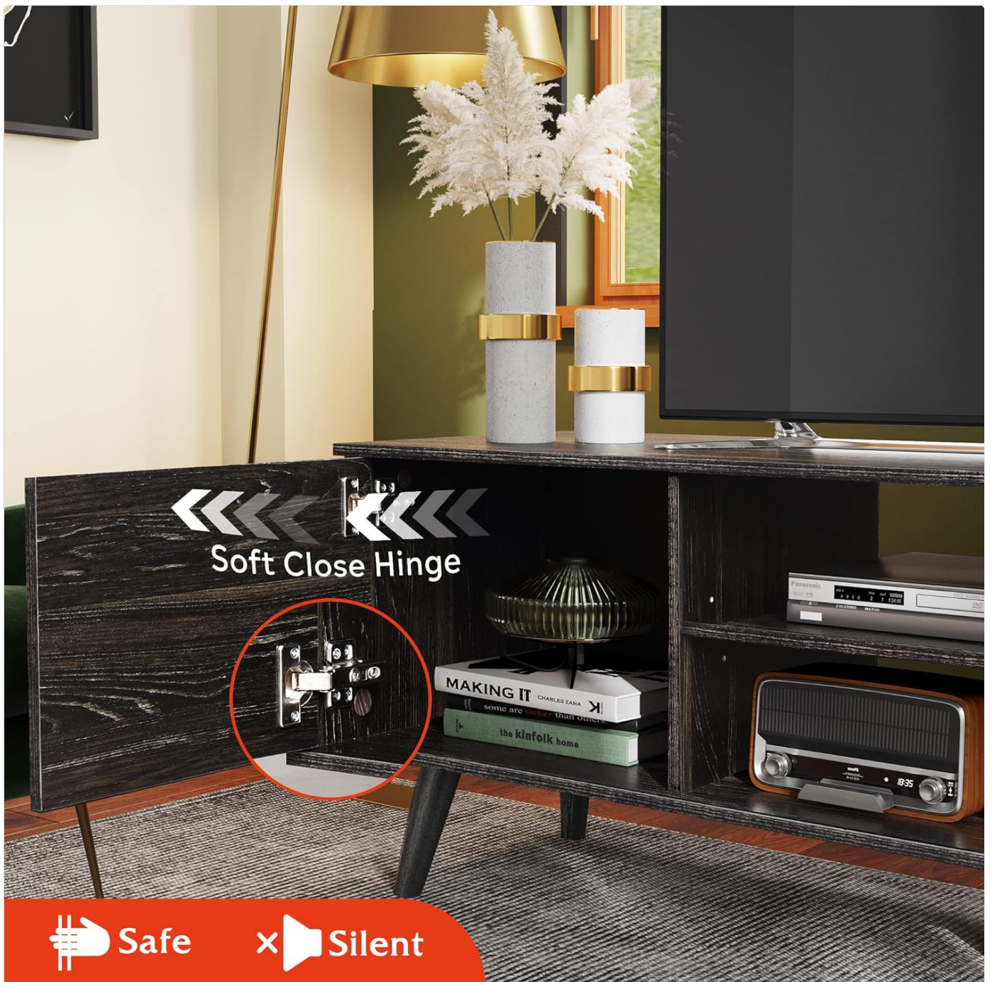
Image: A close-up view of the soft-close hinge mechanism on the cabinet door, highlighting its safe and silent operation.