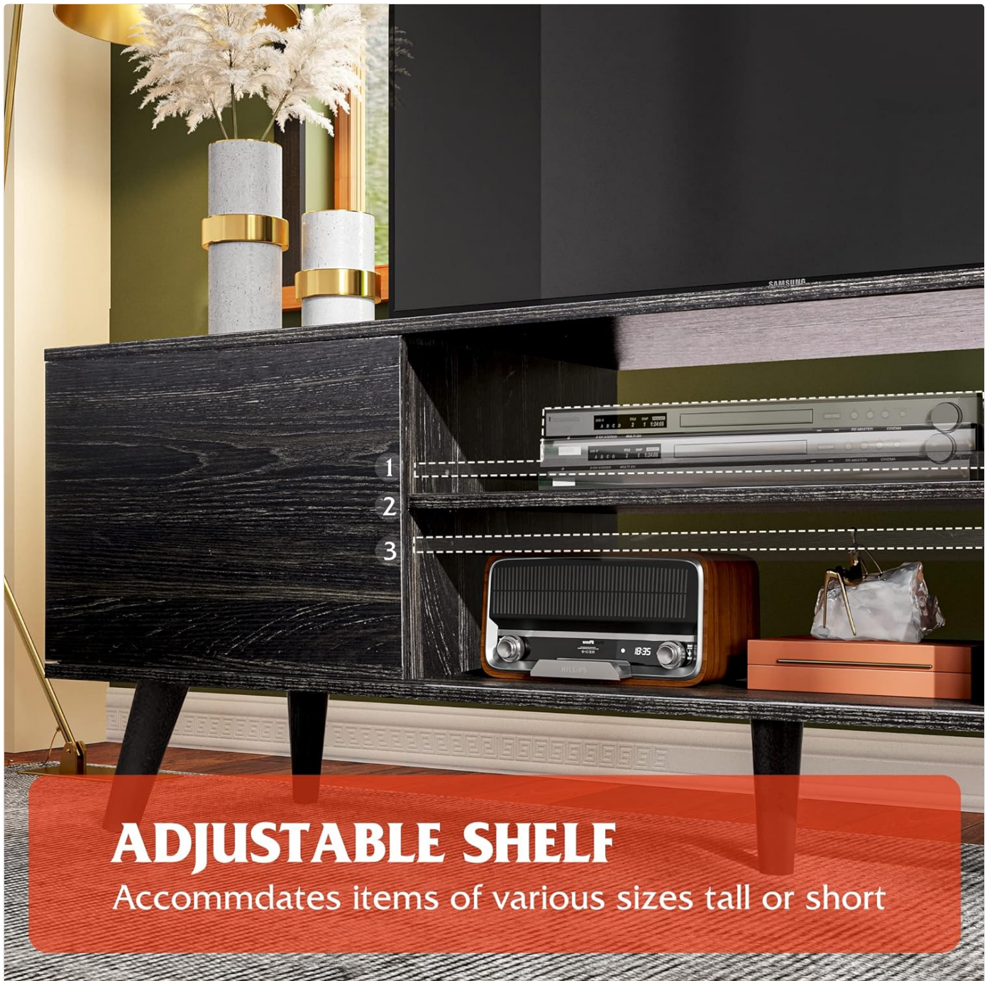
Image: Illustration demonstrating the three-level adjustable shelf in the central compartment, allowing for flexible storage.