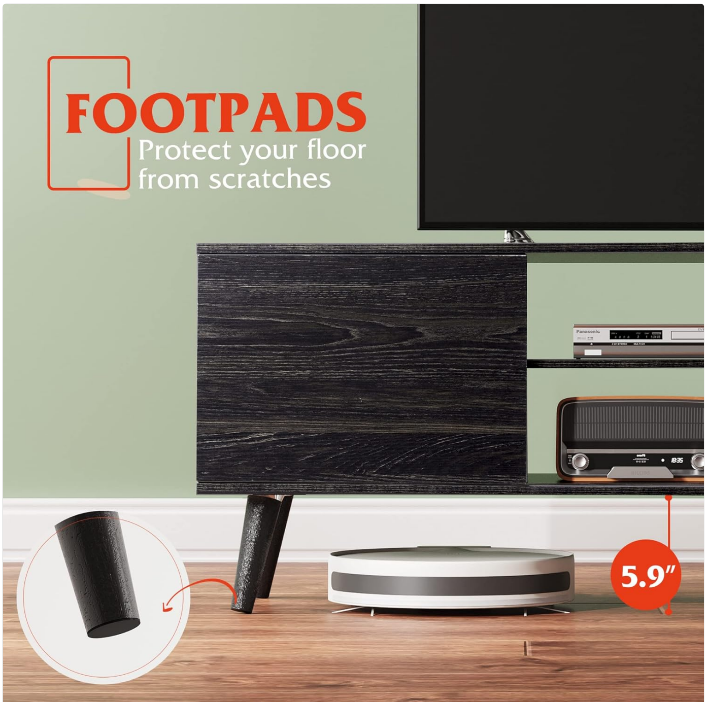
Image: A close-up of the protective footpads on the legs, designed to prevent scratching and damage to your flooring.