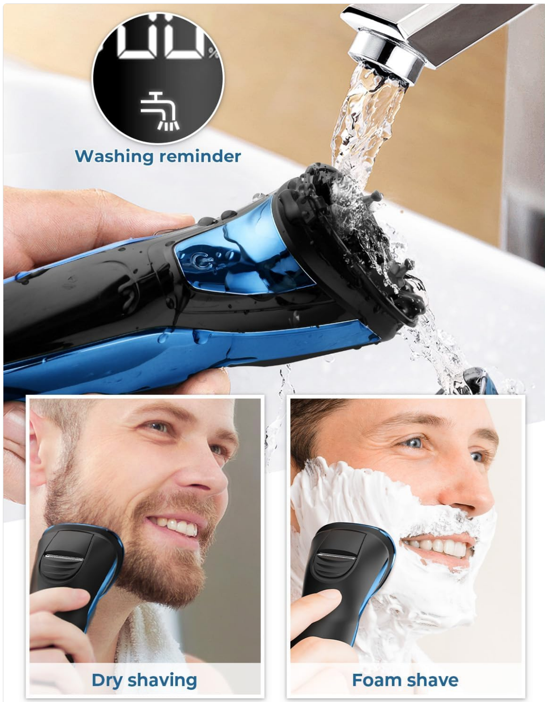
Figure 7: Wet and Dry Shaving. This image illustrates the shaver being used for both dry shaving and wet shaving with foam, highlighting its versatility and waterproof capabilities, including a washing reminder icon.