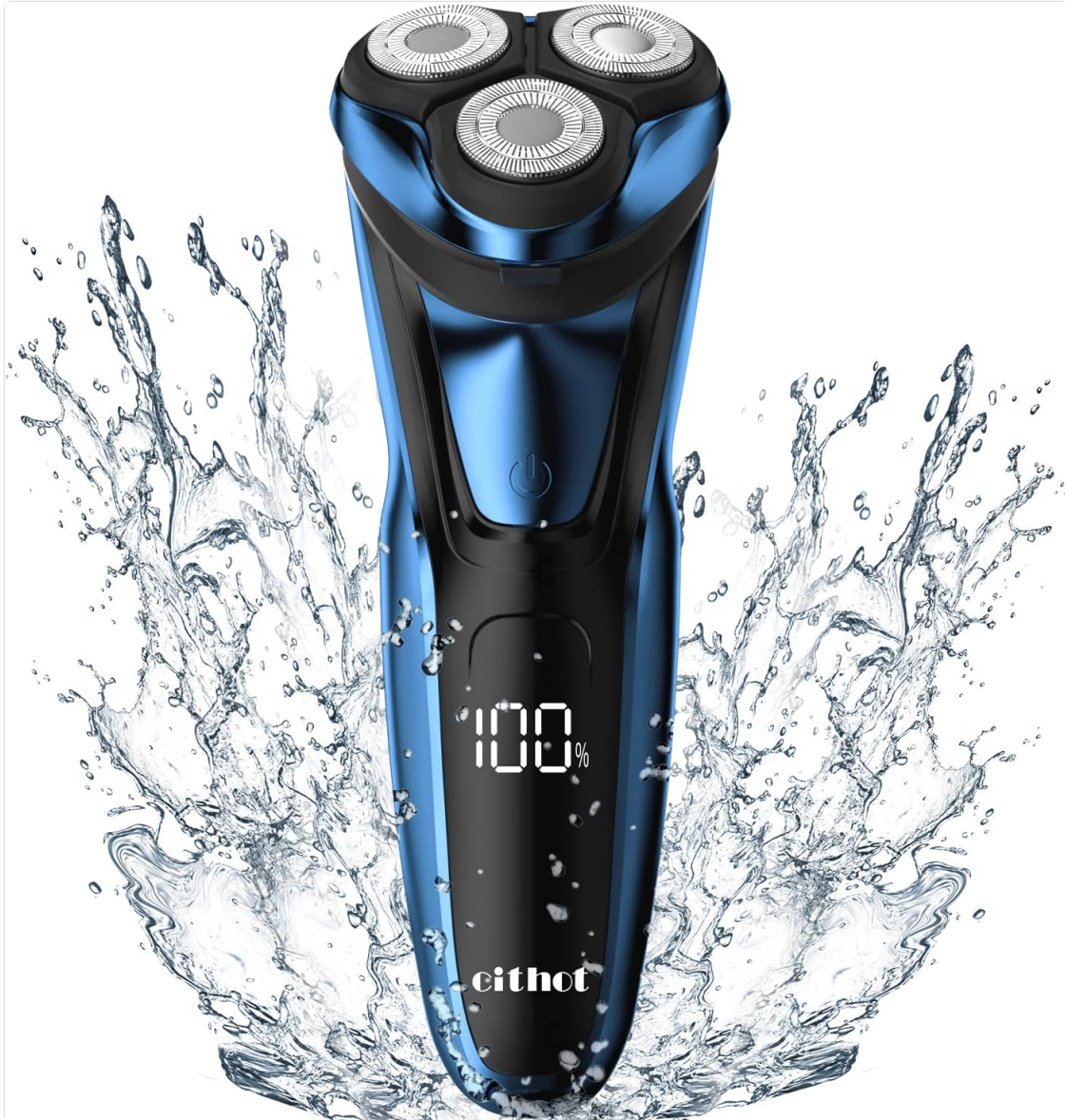
Figure 1: CITHOT Electric Rotary Shaver RS8336-Q. This image displays the shaver with its three rotary heads, power button, and LCD display, surrounded by water splashes indicating its waterproof nature.

Familiarize yourself with the main parts of your CITHOT Electric Rotary Shaver.