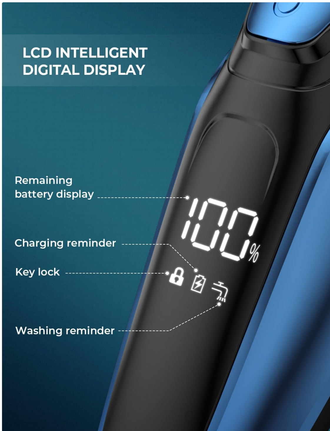
Figure 2: LCD Intelligent Digital Display. This image highlights the shaver's LCD screen, showing indicators for remaining battery percentage, charging reminder, key lock, and washing reminder.