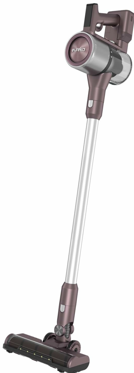
Image: The Eureka AK10 Pet Cordless Stick Vacuum Cleaner, showcasing its sleek design and main components.