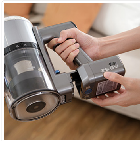
Image: Left: Wall mount for convenient storage. Right: Detachable battery for flexible charging.