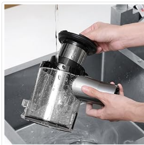
Image: A person rinsing the dust cup and filter under running water.