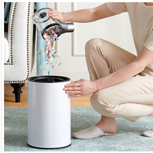
Image: A person emptying the dust cup into a trash bin.

Empty the dust cup after each use or when it reaches the MAX fill line. Press the dust cup release button to detach it from the main body, then open the bottom flap to empty contents into a trash bin.