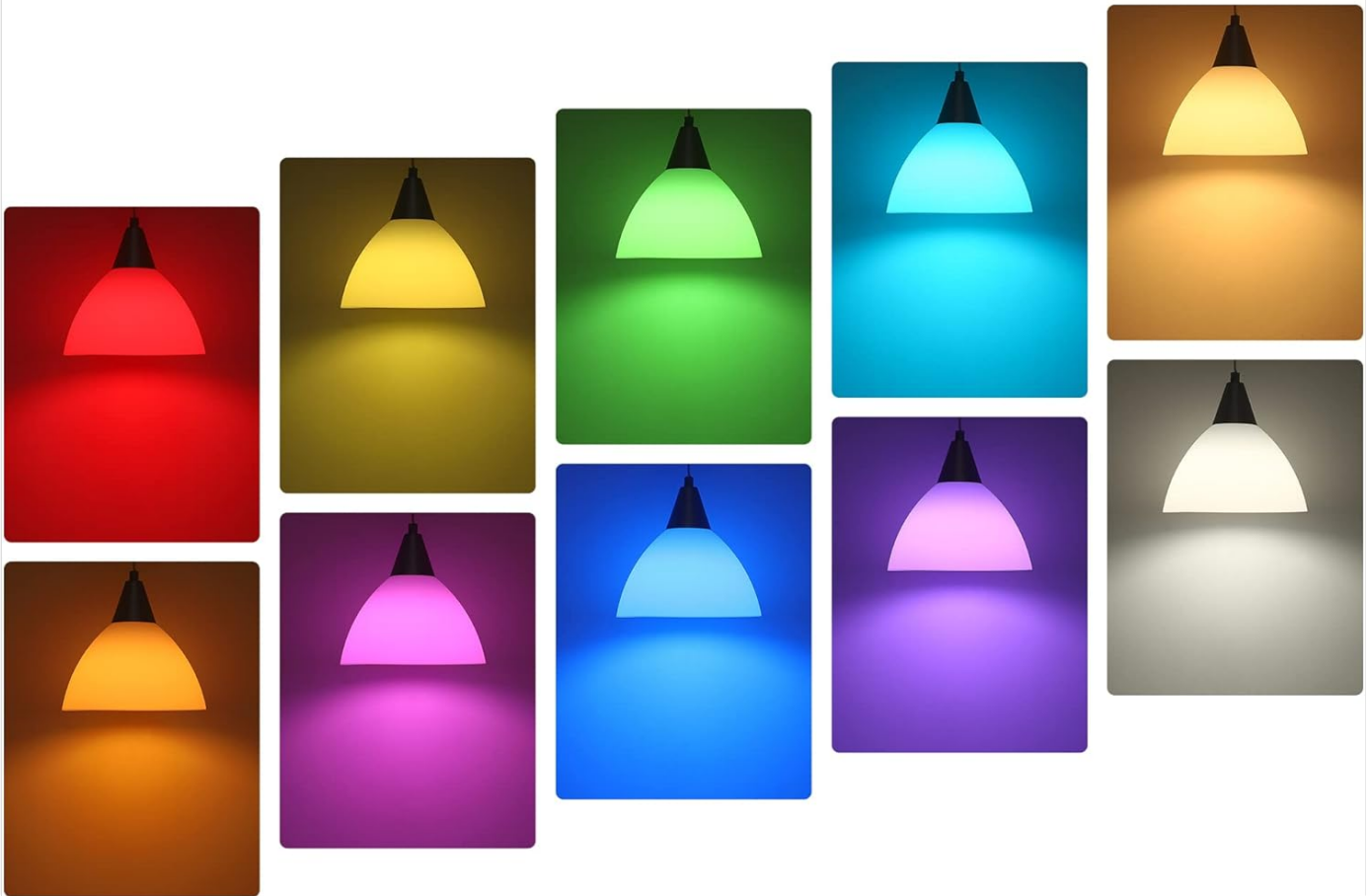
Image: The EDISHINE RGB Color Changing LED Light Bulb displaying a range of colors, highlighting its versatility.