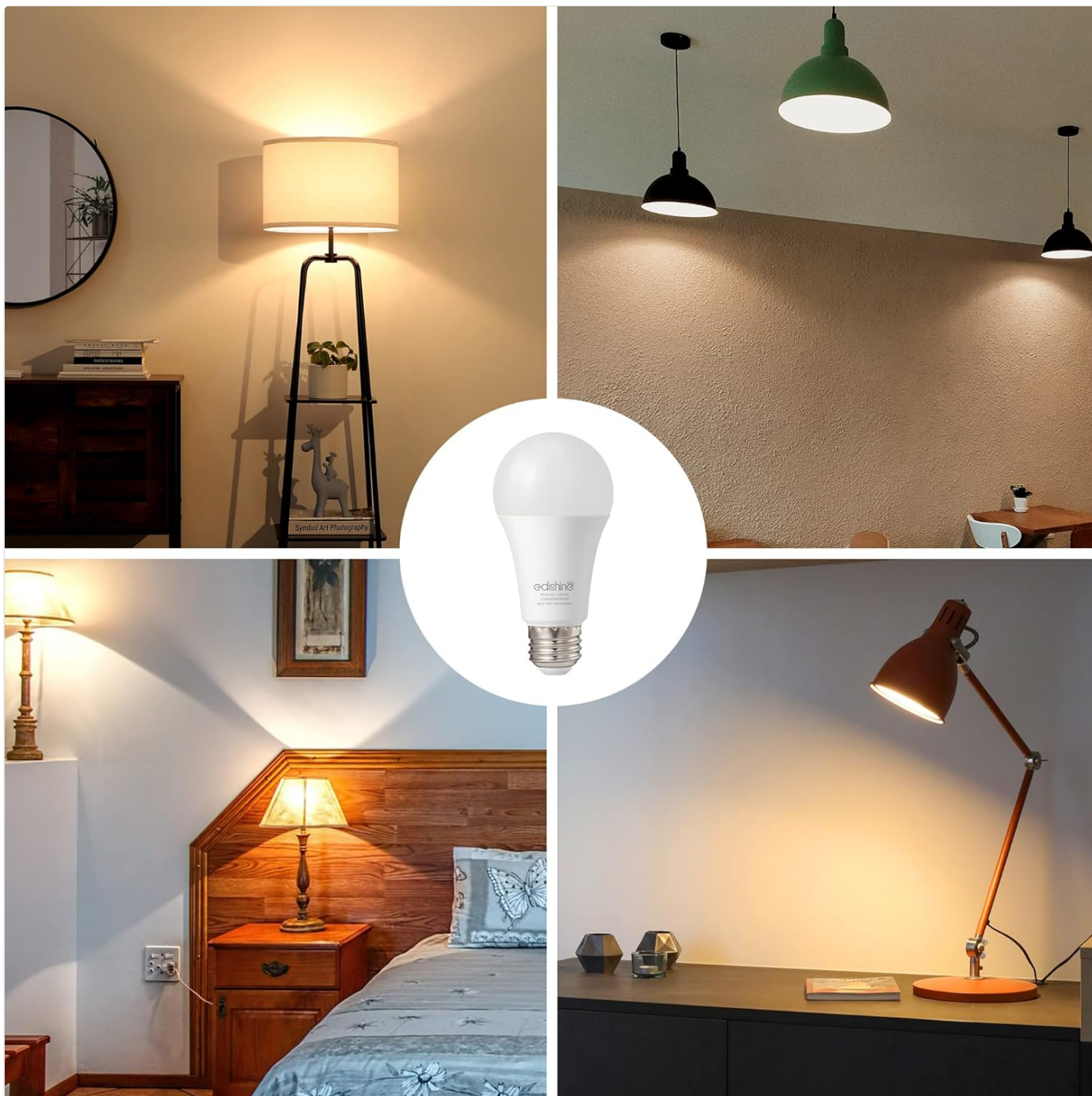
Image: The EDISHINE LED Light Bulb shown in different indoor settings, demonstrating its compatibility with various fixtures.