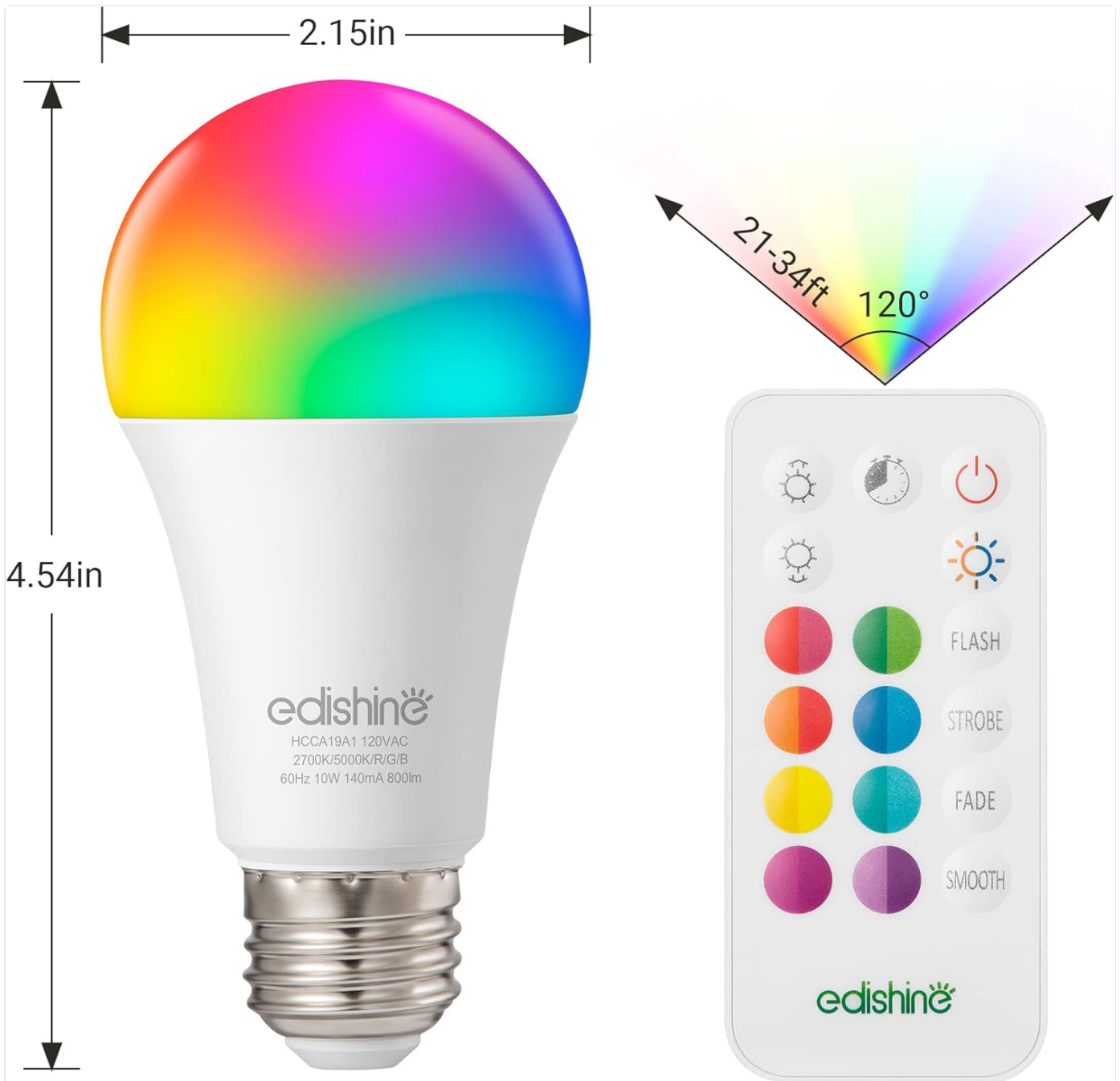
Image: Physical dimensions of the EDISHINE LED Light Bulb and its remote control.