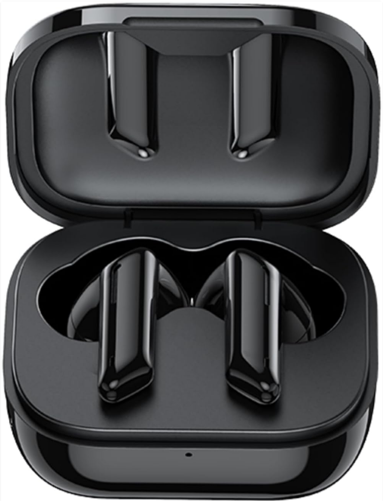
The image displays the Awei T36 TWS Wireless Earbuds securely placed within their open charging case. Both earbuds are black, sleek, and fit perfectly into their designated slots, indicating they are ready for charging or storage.