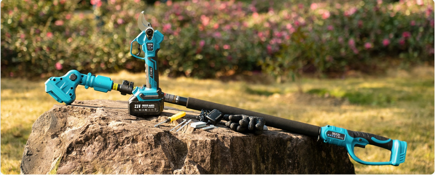
Image: All components included in the Seesii Electric Pruning Shears kit, laid out on a rock. This includes the shears, two batteries, charger, wrenches, and a sharpening stone.