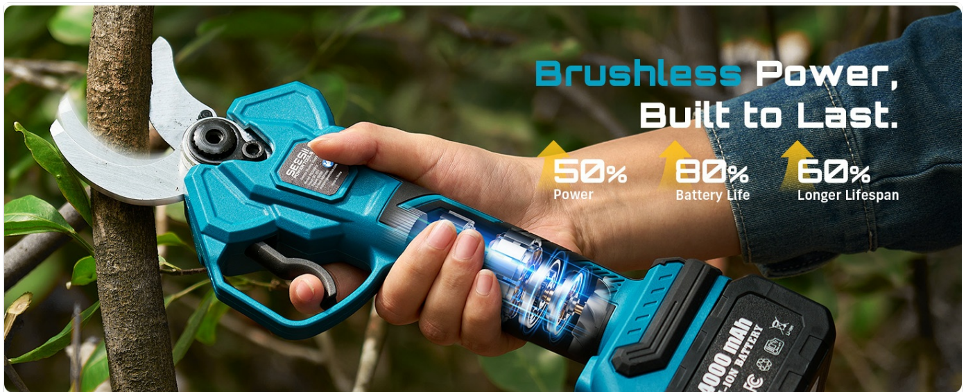
Image: Internal view of the brushless motor in the Seesii Electric Pruning Shears, illustrating its power and durability.