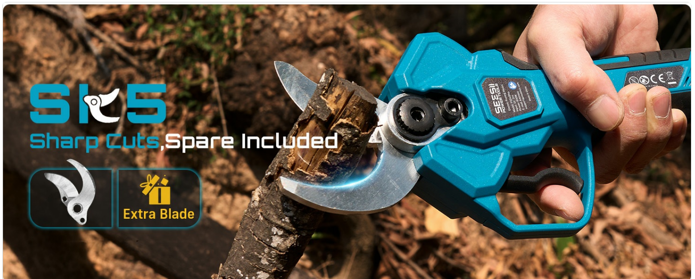
Image: Close-up of the Seesii Electric Pruning Shears blade, highlighting the SK5 material and indicating a spare blade is included for