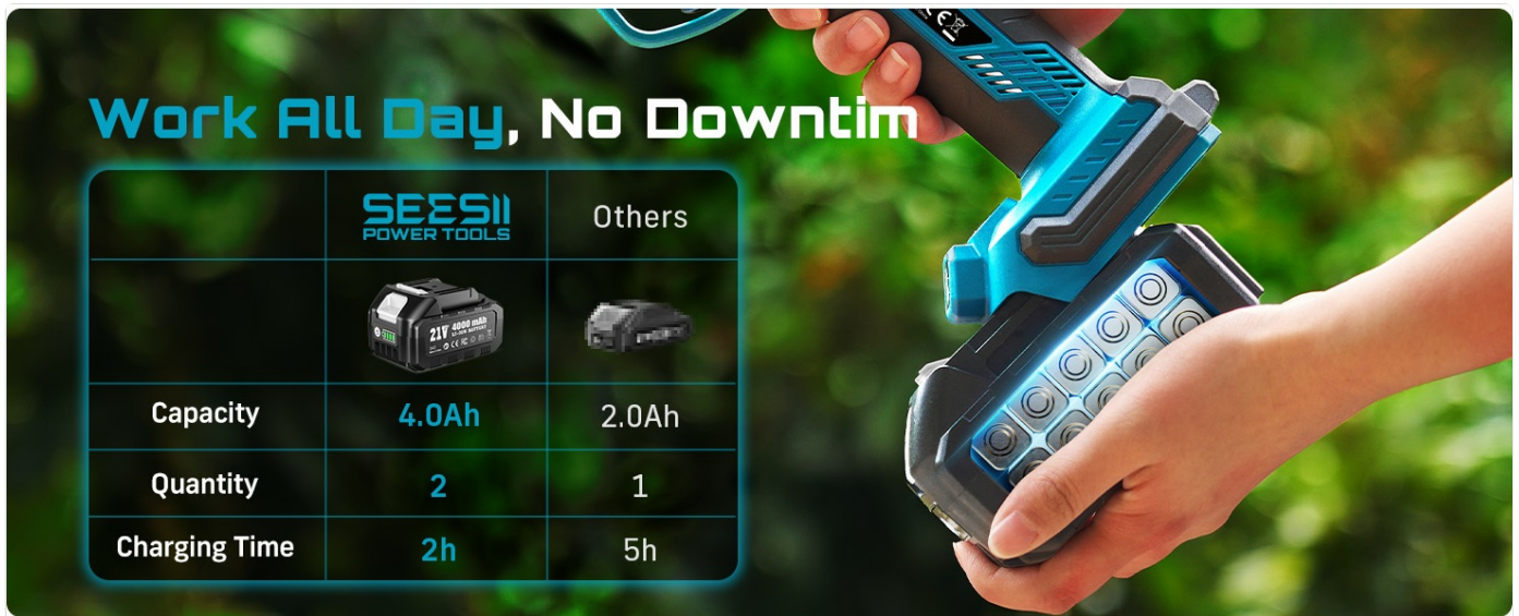
Image: A comparison table showing Seesii batteries with 4.0Ah capacity, 2 batteries included, and 2-hour charging time, compared to other brands.