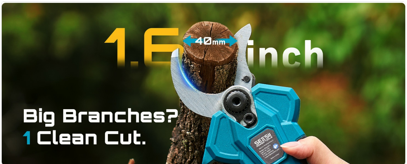
Image: Seesii Electric Pruning Shears cutting a thick branch, demonstrating its 40mm cutting capacity.