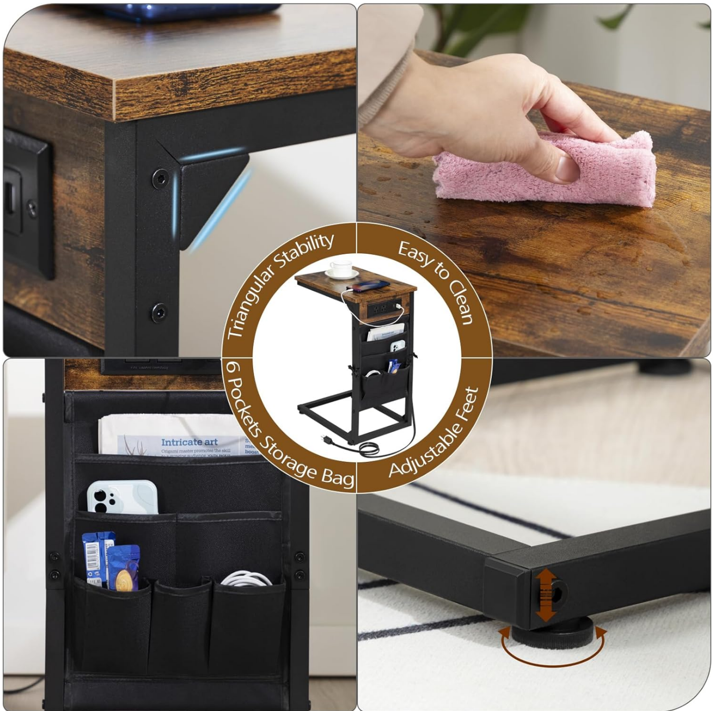
Image: A visual representation of the table's versatility, showcasing its use in different rooms and for various activities.