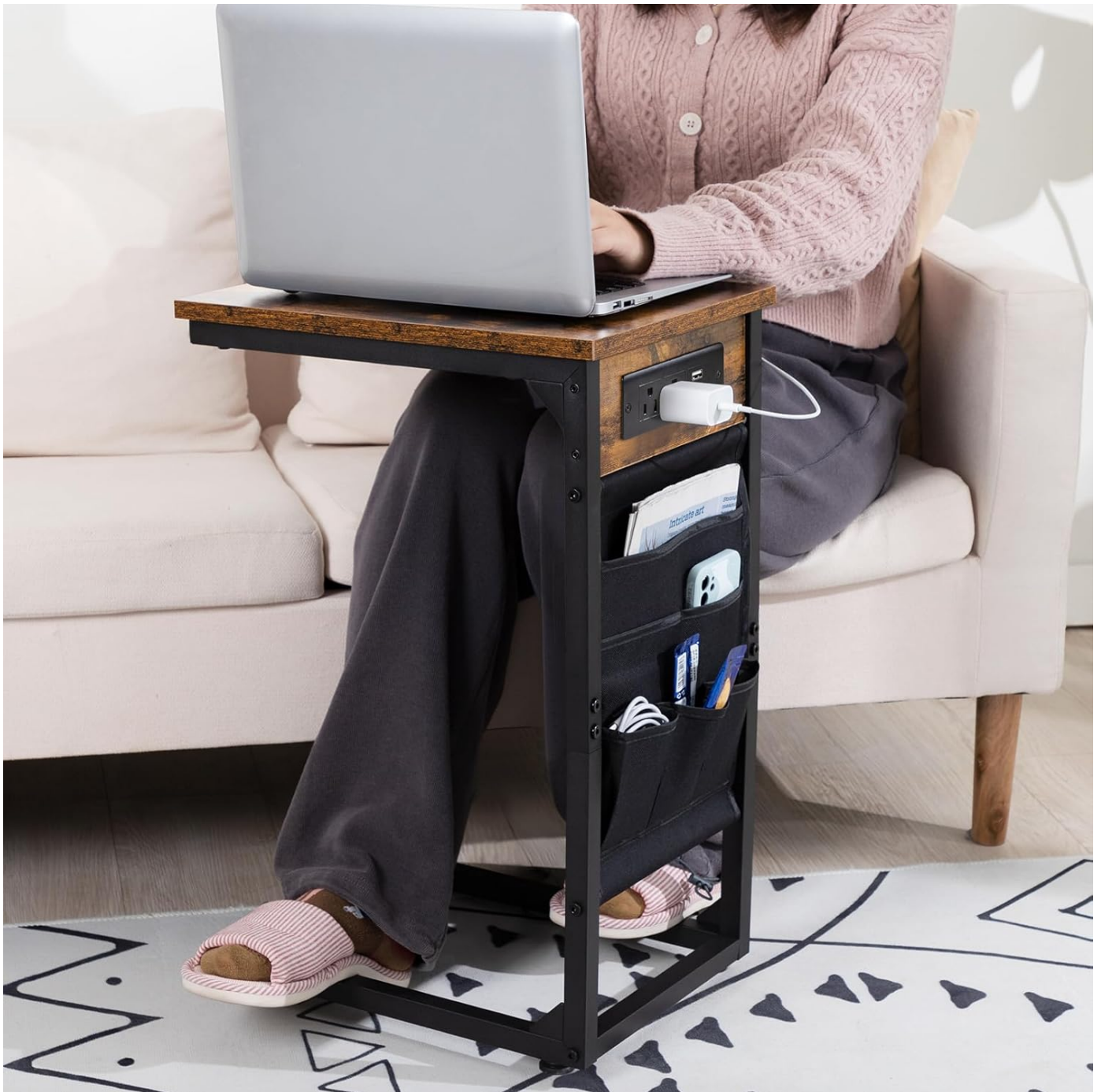
Image: A user comfortably working on a laptop positioned on the C-shaped table, illustrating its ergonomic design for sofa-side use.