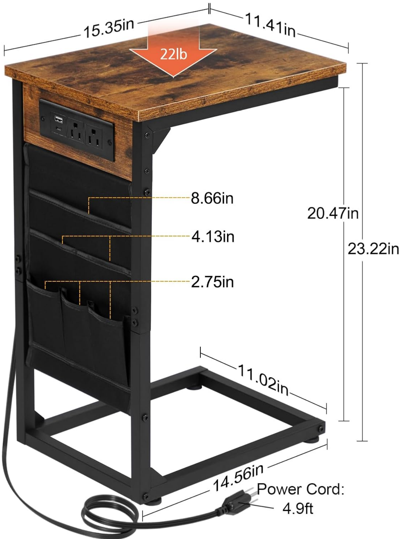
Image: Dimensional diagram of the C-shaped end table, illustrating key measurements for assembly and placement.