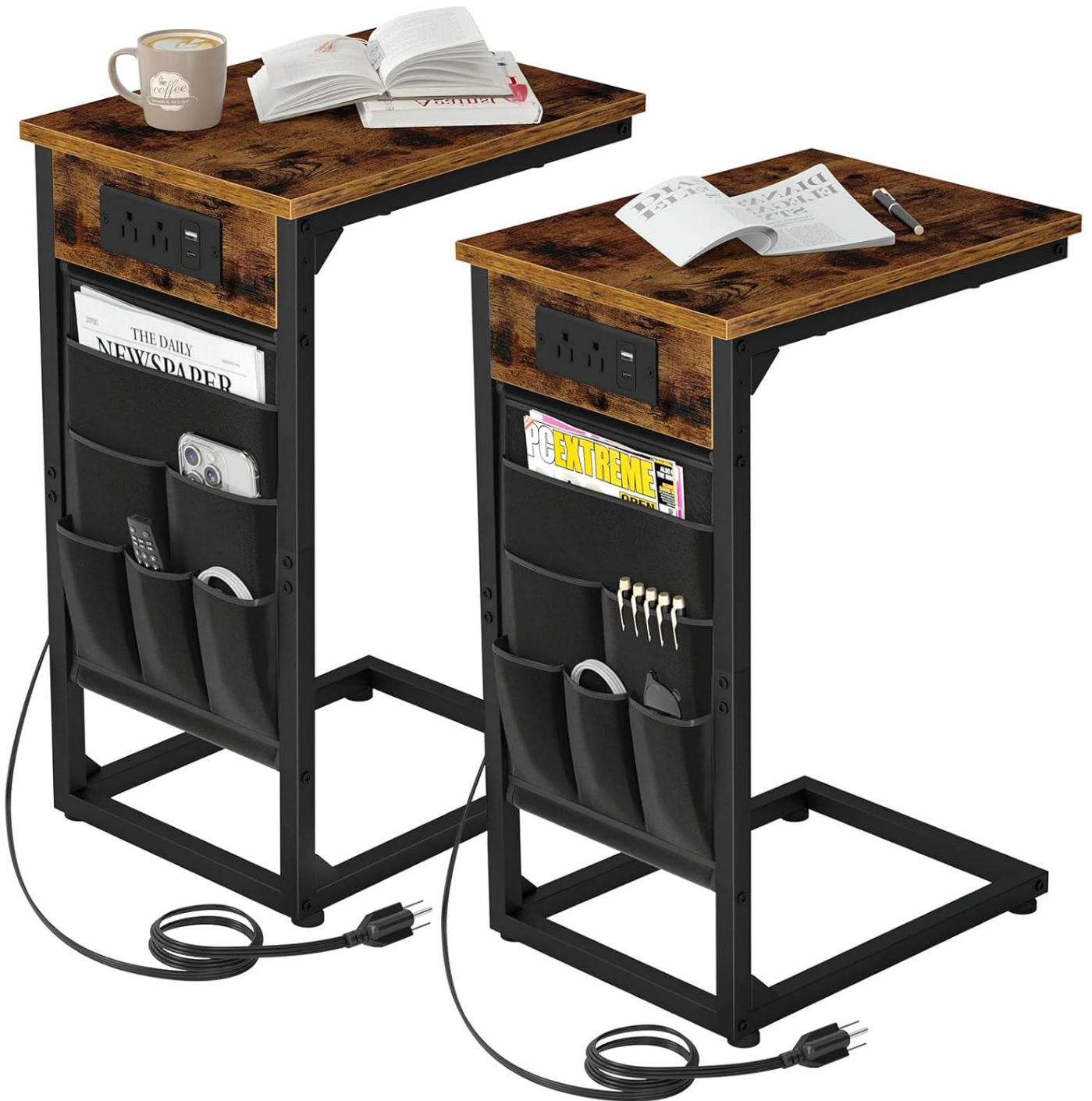
Image: A set of two AMHANCIBLE C Shaped End Tables, showcasing their design, integrated charging stations, and side storage bags.