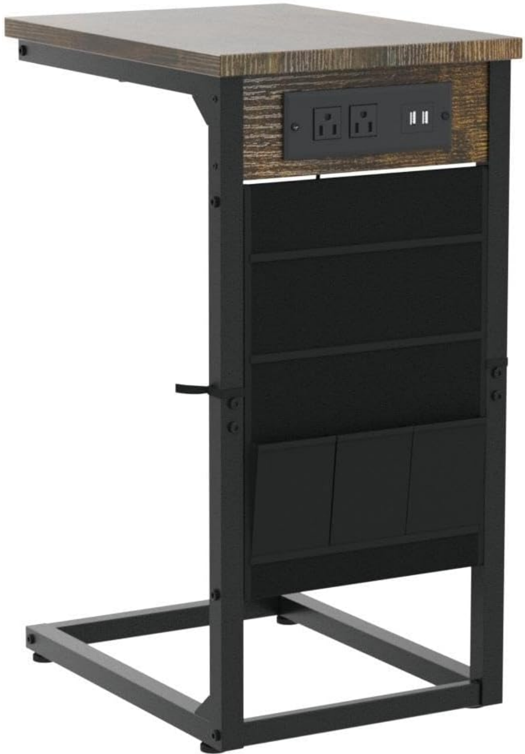
Image: Side view of the table highlighting the integrated storage bag with various pockets for organization.