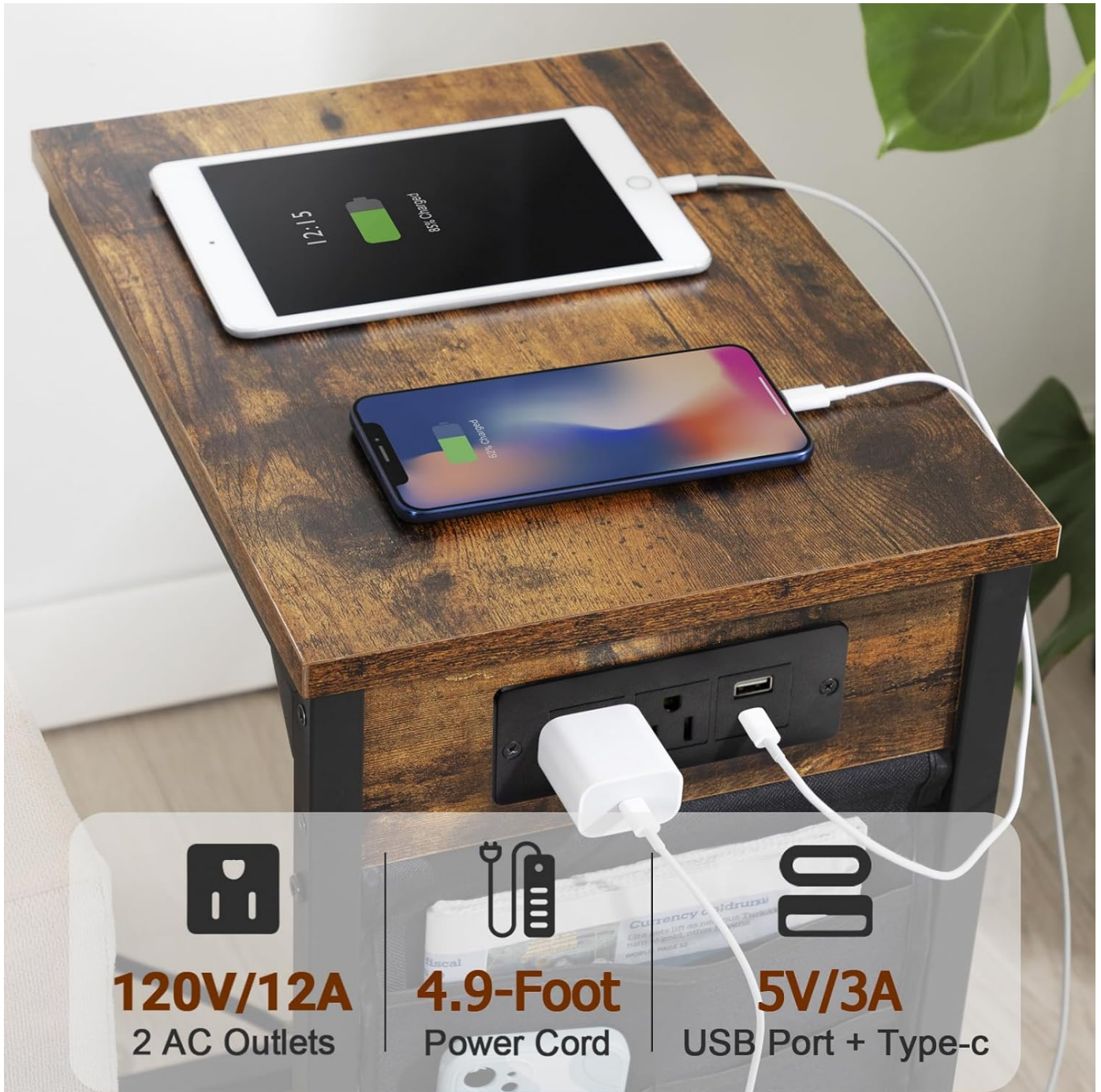
Image: The integrated charging station with two AC outlets and two USB ports, demonstrating its capability to charge multiple devices simultaneously.