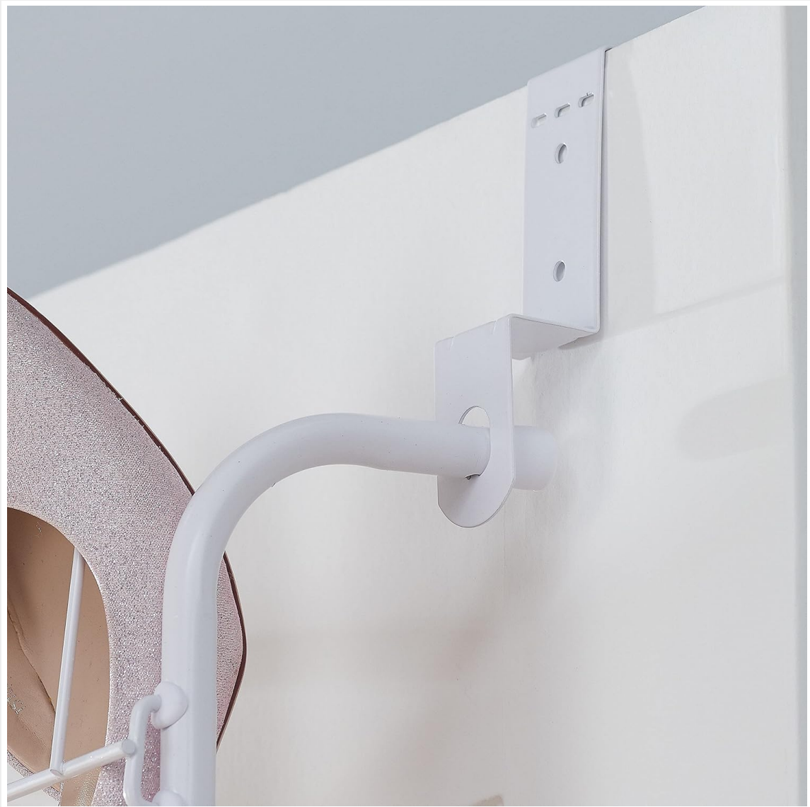
Figure 2: Detail of the sturdy metal hook designed to hang the shoe rack securely over the top edge of a door.