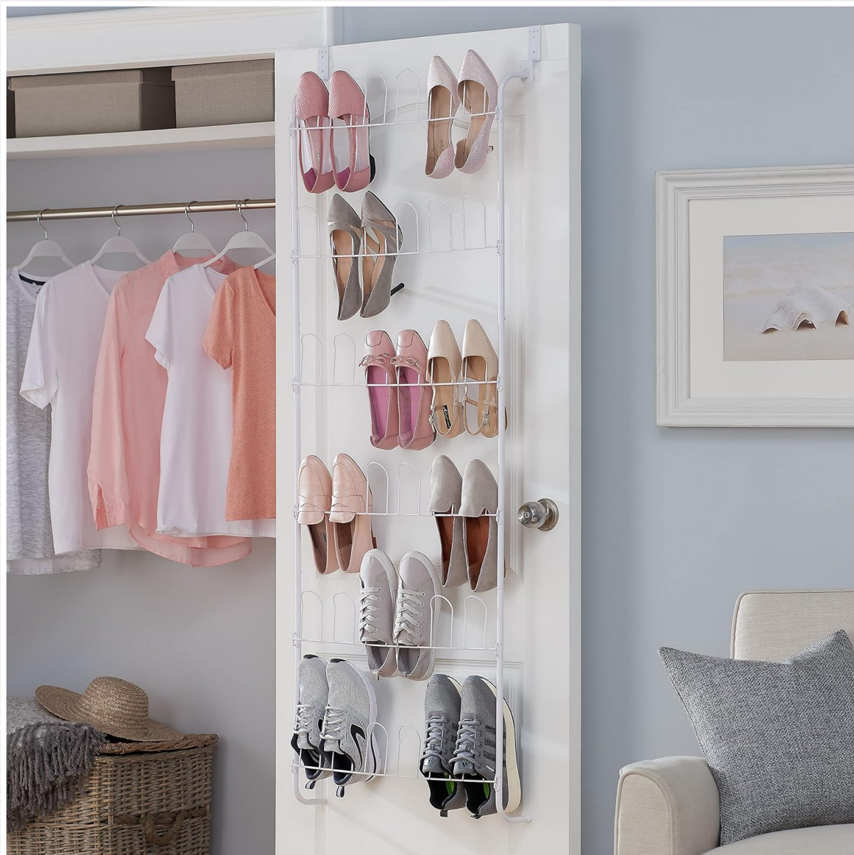
Figure 4: The Mainstays shoe rack installed on a door, demonstrating its capacity to hold multiple pairs of shoes and integrate seamlessly into a closet or room setting.