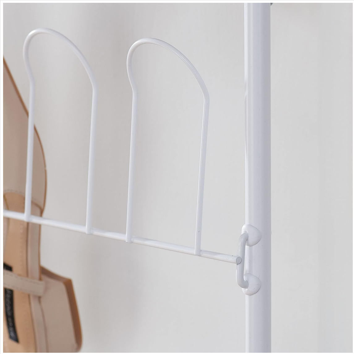
Figure 3: A close-up view of a single shoe slot, demonstrating how footwear rests securely within the rack's design.