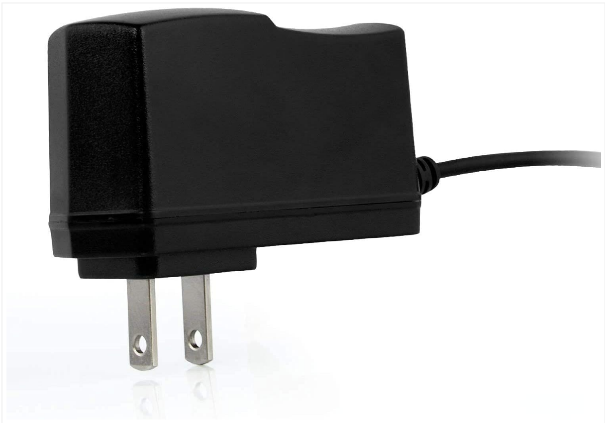
Figure 3.1: The BestCH AC Adapter, showing its compact design with a US-style two-prong plug and integrated power cord.