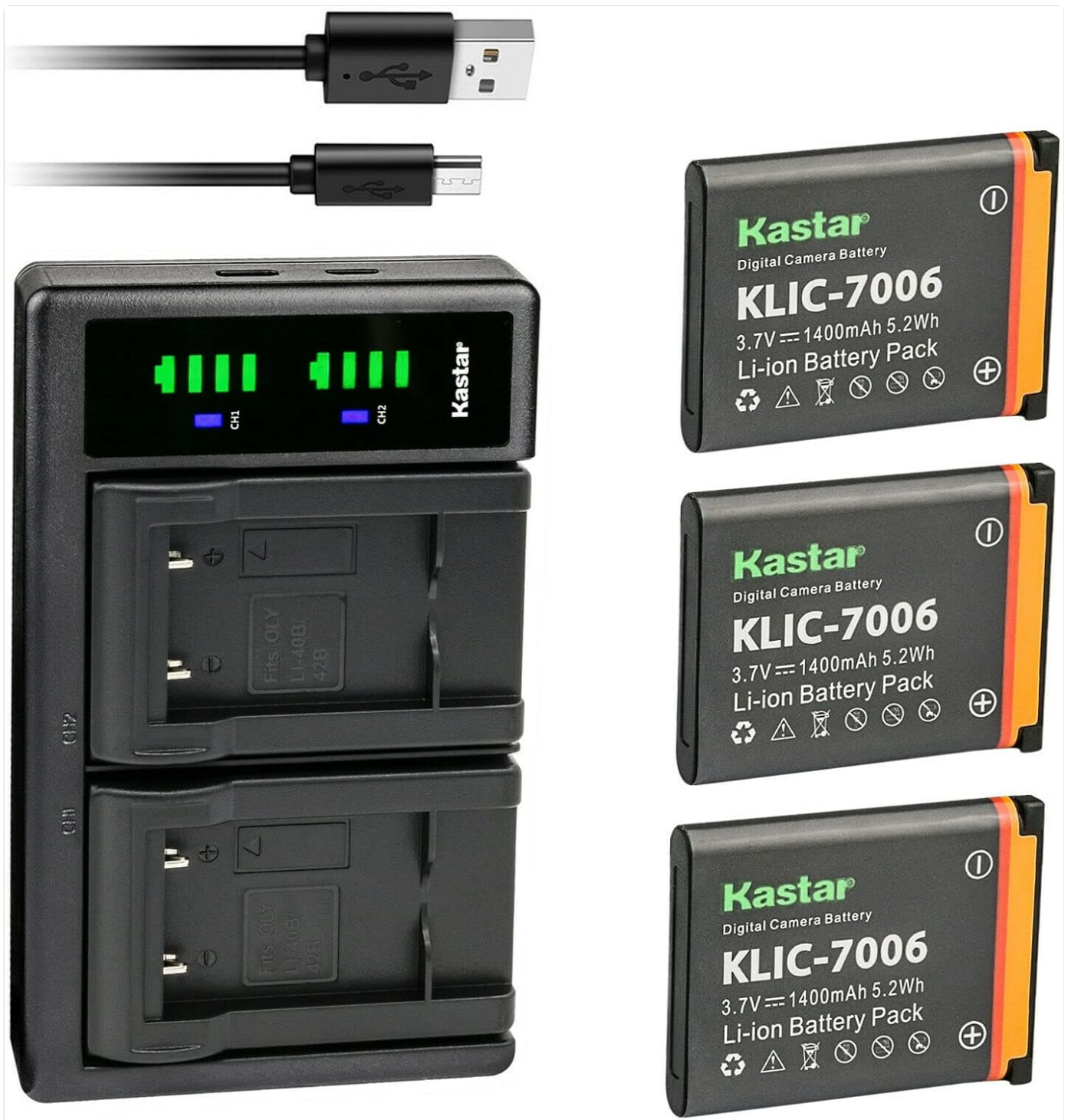
Image: The complete package contents, including the dual charger, three batteries, and connecting cables.