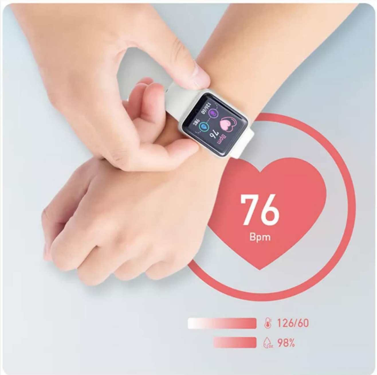
Image 5.2: Close-up of the smart watch on a wrist, displaying a heart rate measurement.