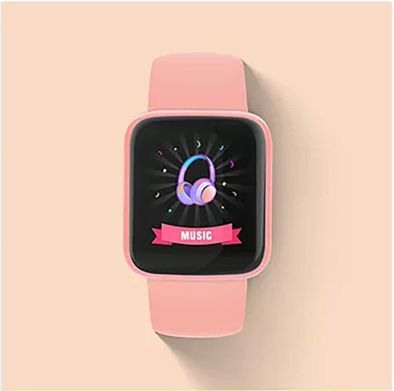
Image 1.1: Front view of the Avista Macaron Smart Watch Model A1, showcasing its display with a music icon.