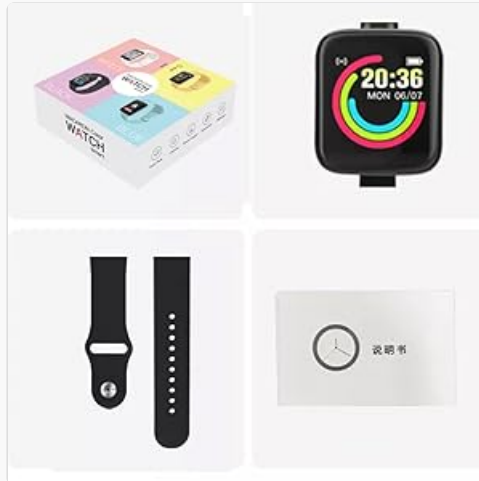
Image 10.1: Overview of the Avista Macaron Smart Watch Model A1 in different color variations.