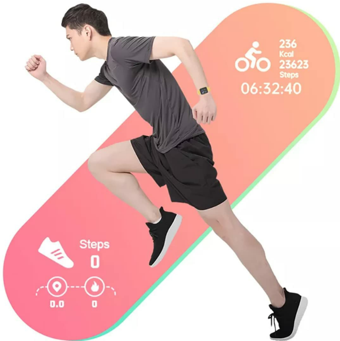
Image 6.1: Fitness tracking in action, showing a user during a run with activity data displayed.