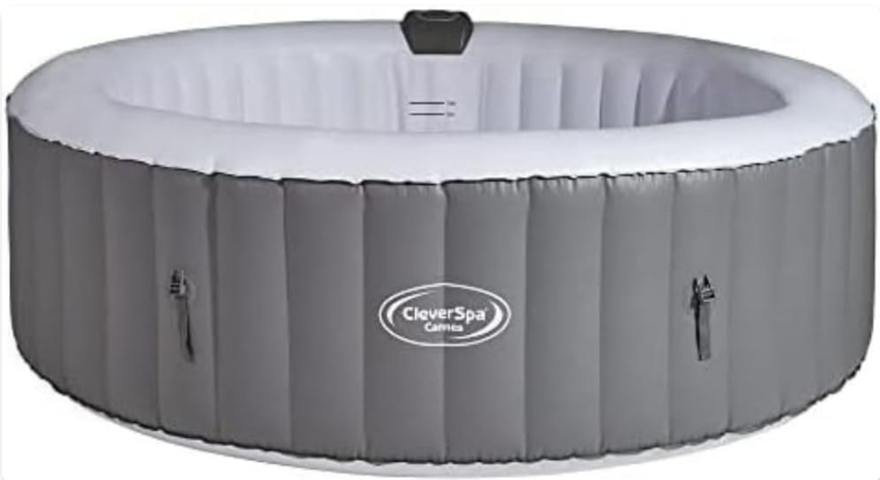
Image: The CleverSpa Cannes 6 Person Inflatable Hot Tub, showcasing its round shape and grey exterior.

This user manual provides comprehensive instructions for the safe and efficient setup, operation, and maintenance of your CleverSpa Cannes 6 Person Round Inflatable Outdoor Bubble Spa Hot Tub. Designed for comfort and durability, this hot tub features 130 airjets and 365 Freezeguard Technology, allowing for year-round enjoyment. Please read this manual thoroughly before initial use to ensure proper functioning and longevity of your product.