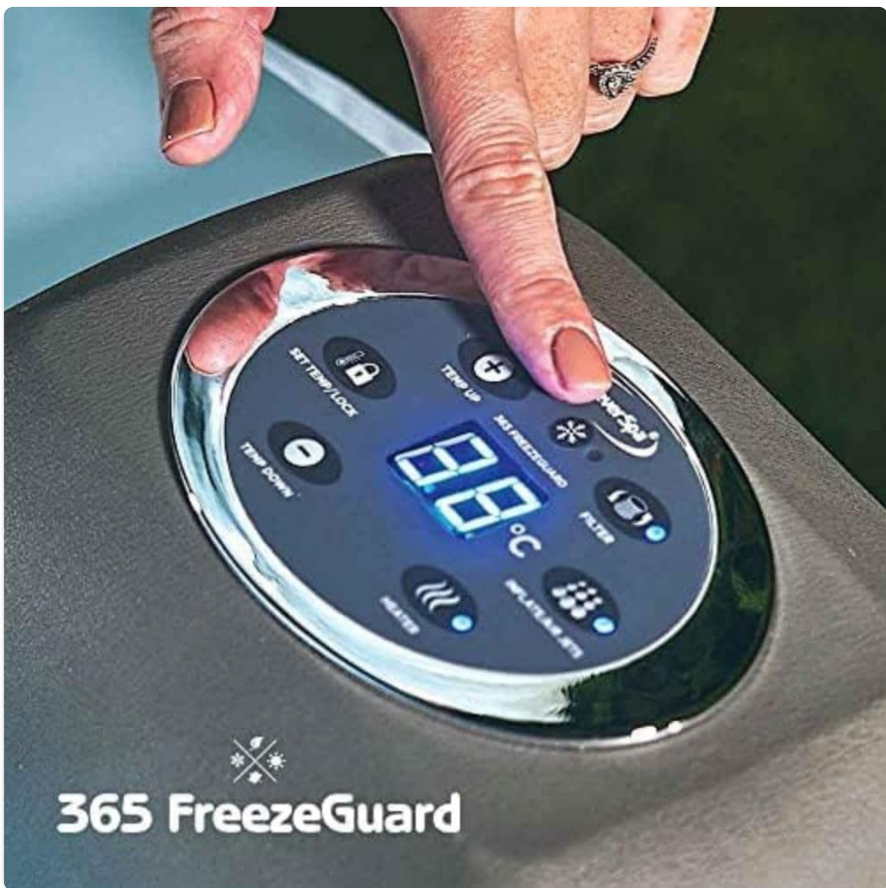
Image: Close-up of the CleverSpa control panel, showing buttons for temperature adjustment, filter, bubbles, and heating functions.