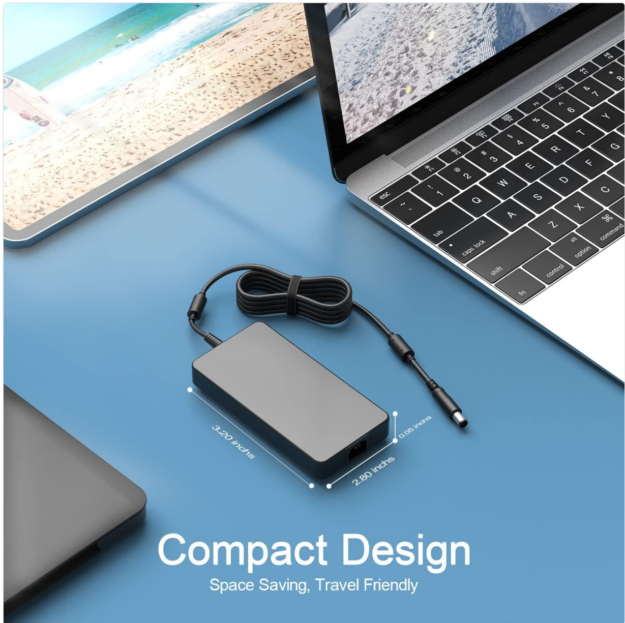
Image Description: The Dexpt AC charger is positioned next to a laptop, with dimensions (3.20 inches and 2.80 inches) overlaid on the image, highlighting its compact design. The image is titled "Compact Design."