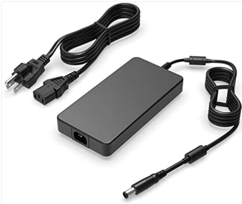
Image Description: A top-down view of the Dext 240W AC charger unit and its accompanying power cord. The charger is a black rectangular block, and the power cord consists of two parts: one connecting to the wall outlet and the other connecting to the charger's output port, ending in a barrel connector.