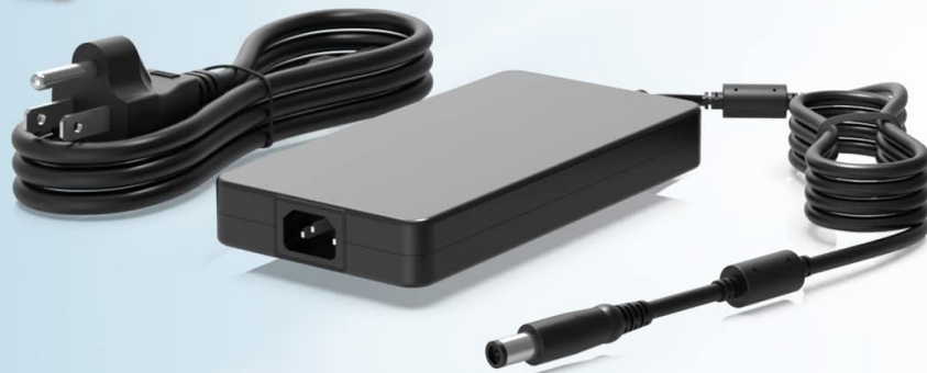
Image Description: An image titled "Superior Safety" showing four icons representing different protection features: Overvoltage Protection (a 'V' with a checkmark), Overcurrent Protection (a wavy line with a checkmark), Short Circuit Protection (a circuit diagram with a checkmark), and Overheating Protection (a thermometer with a checkmark). Below the icons, the charger and power cord are visible on a light blue surface.