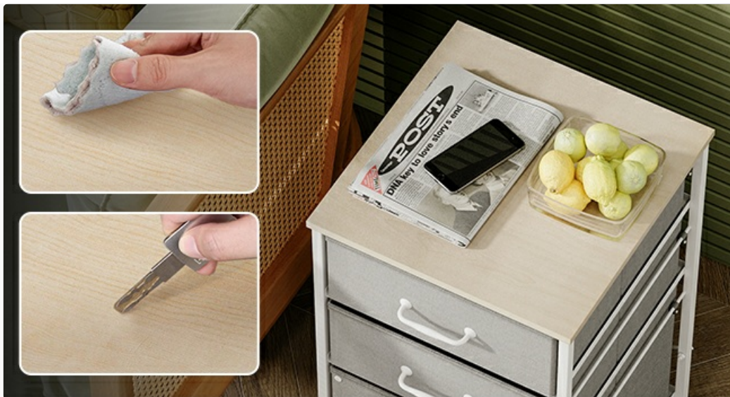
Image 7.1: Cleaning and durability features of the wooden top surface.