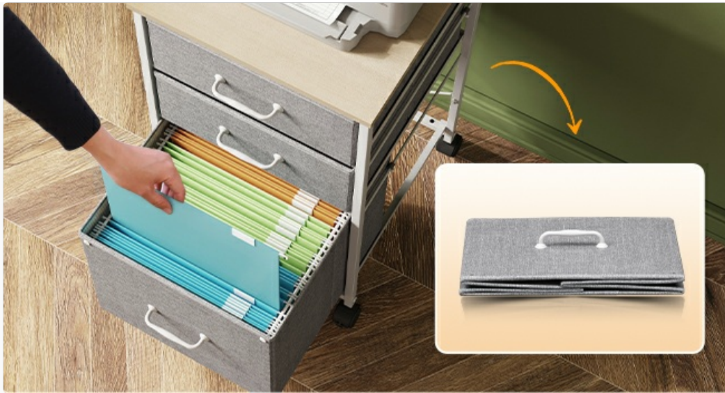
Image 5.2: Illustration of a foldable fabric drawer and its capacity for files.