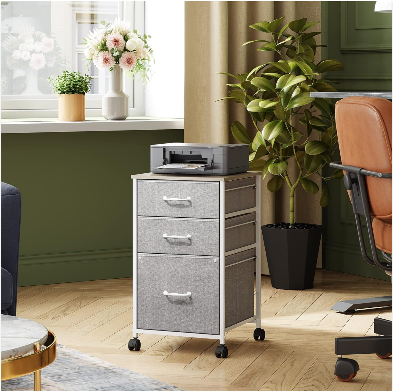
Image 1.1: The DEVAISE Mobile File Cabinet in a typical home office environment, serving as a printer stand and storage unit.