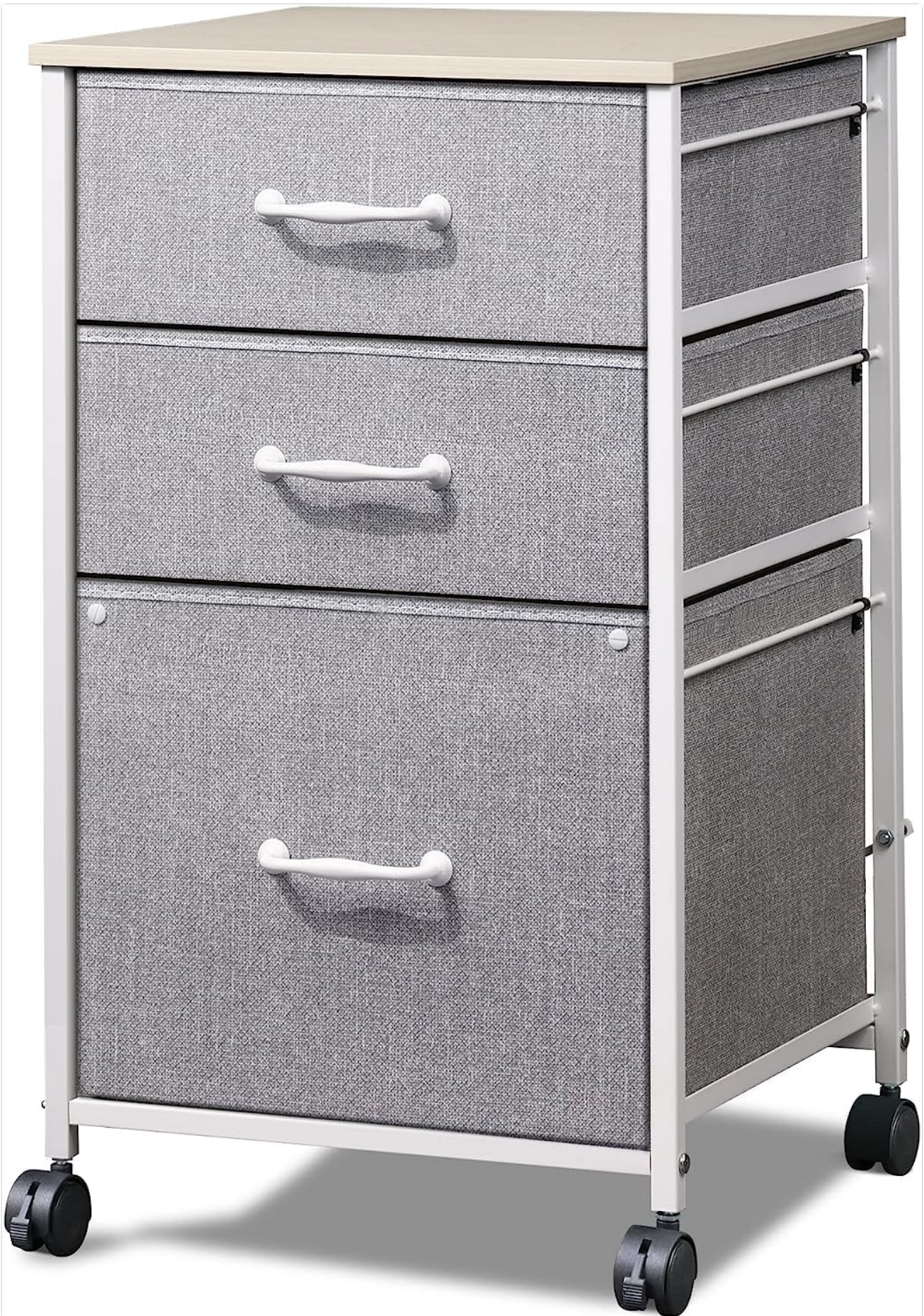
Image 2.1: Front view of the assembled DEVAISE Mobile File Cabinet, highlighting its three fabric drawers and mobile design.