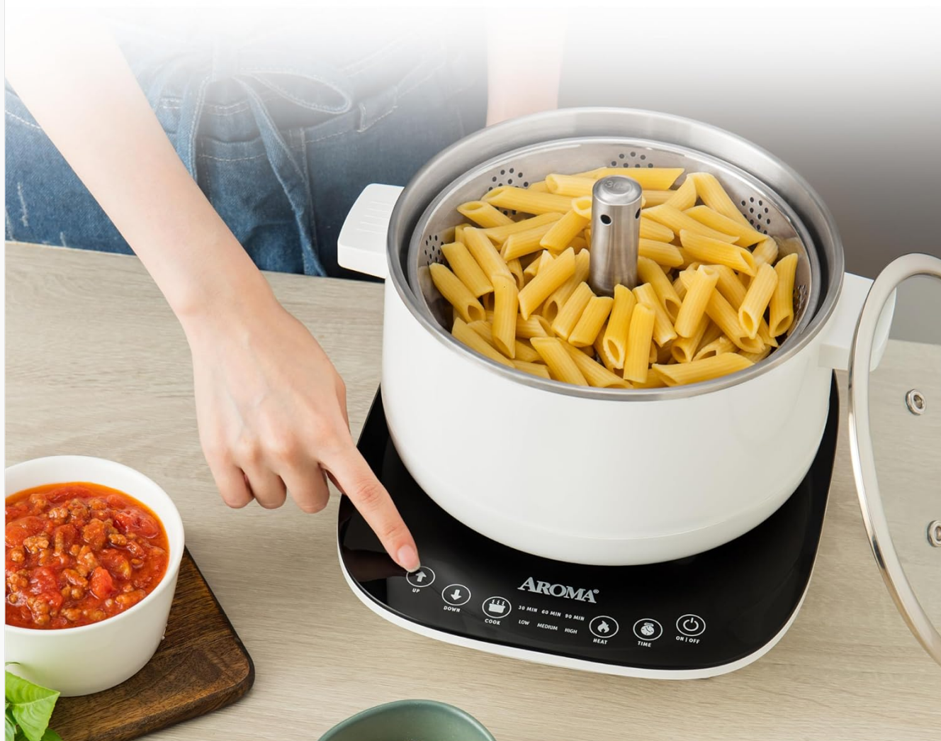
Figure 4: Operating the smart lift function to lower the steamer basket.

LED lights display clear settings, no matter what you're cooking. Plus, the BPA-free cooker has a stay-cool pot, handles, and base.