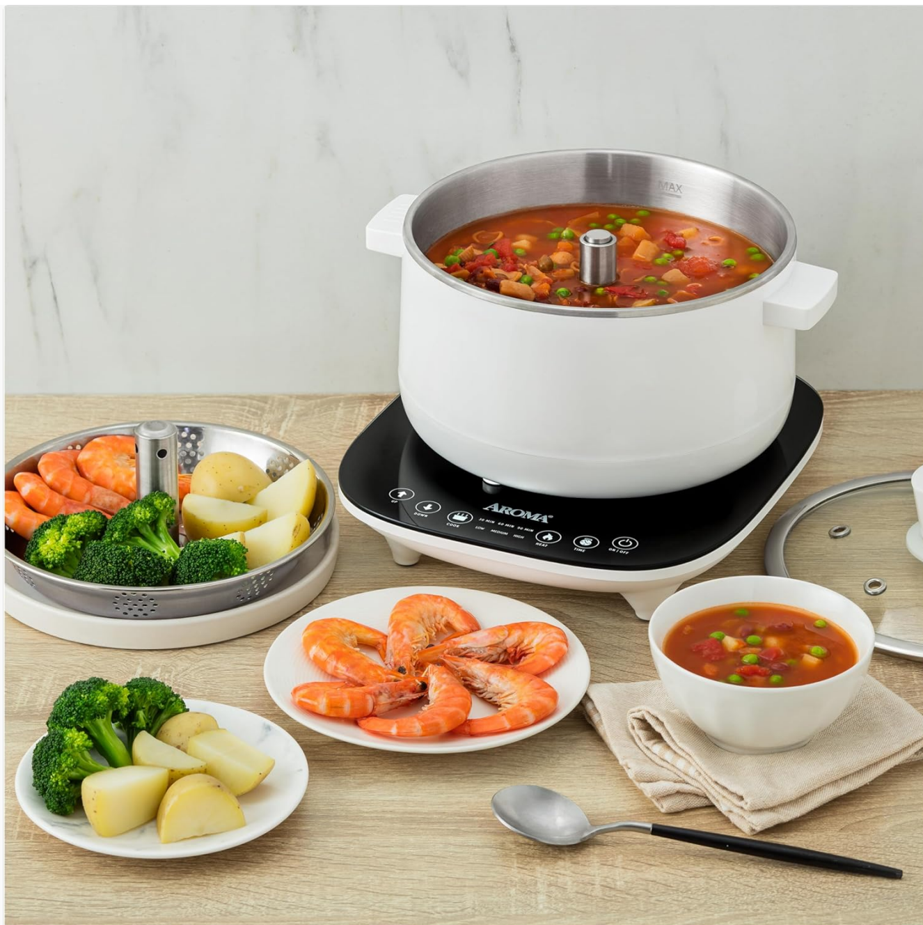
Figure 6: Steaming function in action, preparing shrimp and vegetables.