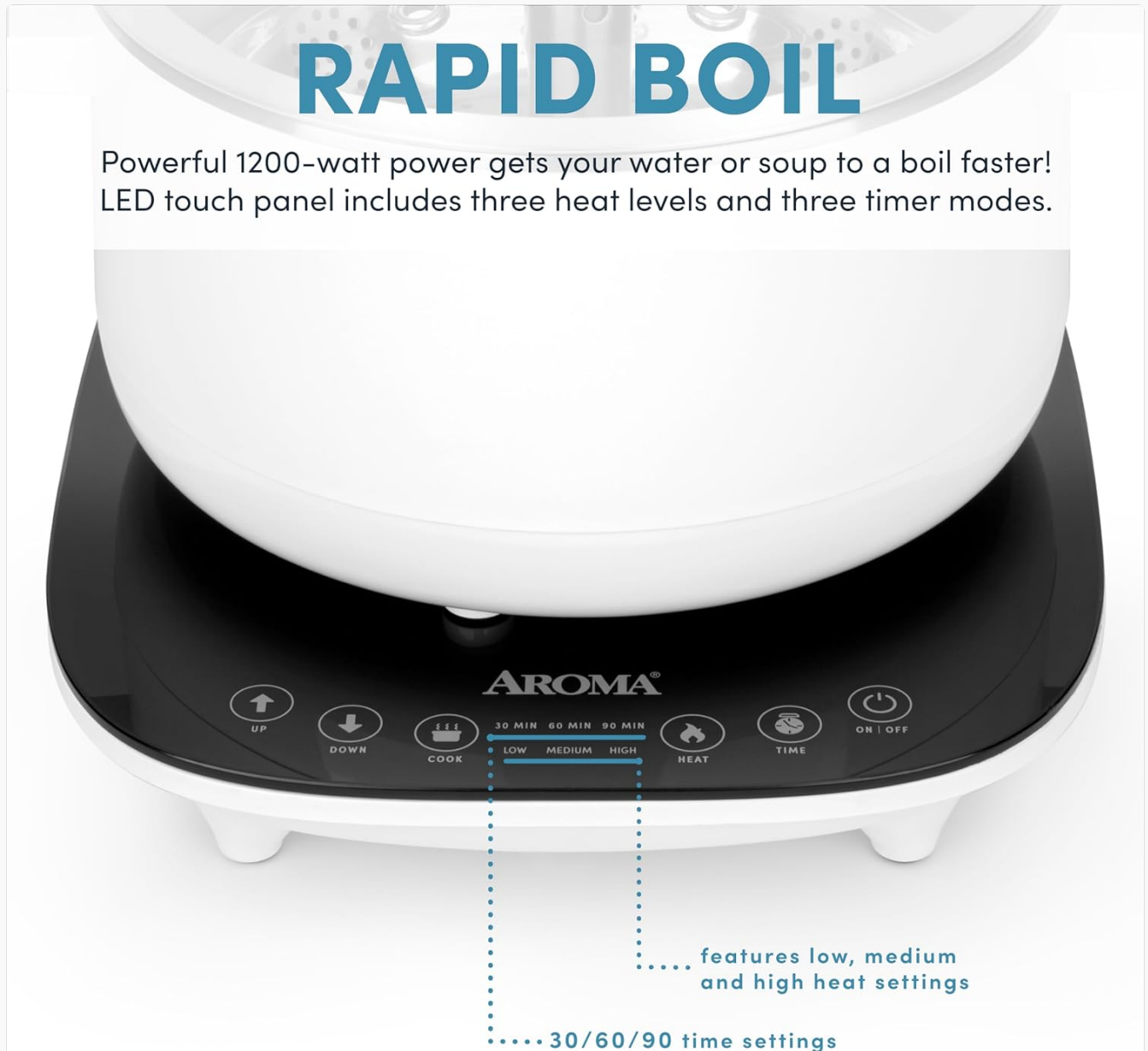
Figure 3: The intuitive touch control panel with heat and timer settings.