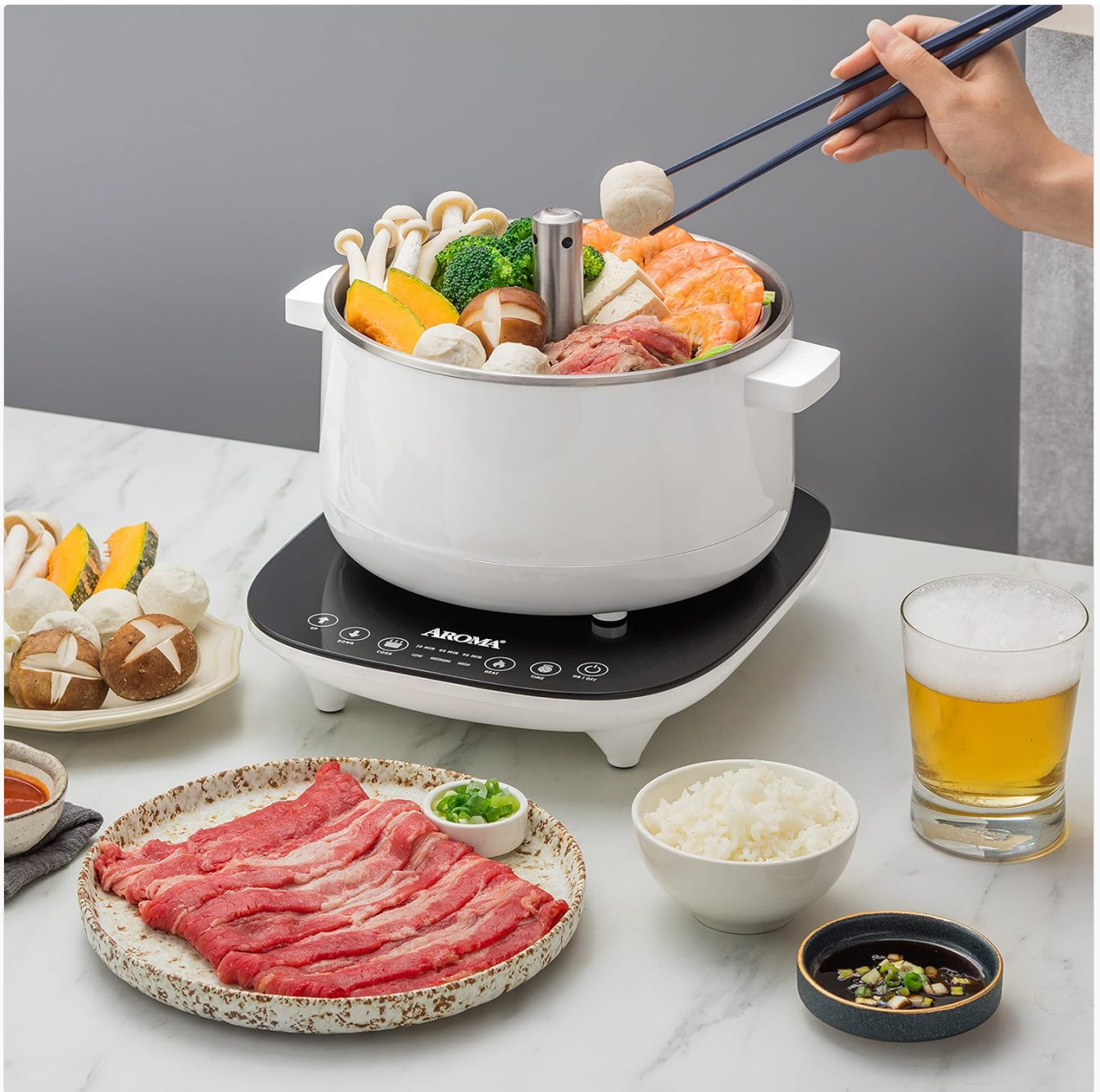
Figure 5: The hot pot in use, filled with a variety of ingredients.