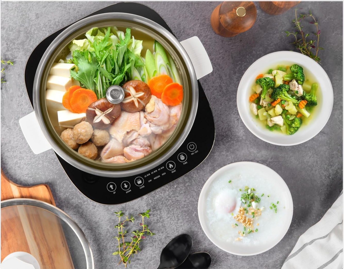
Figure 1: The Aroma ASP-700 Smart Electric Hot Pot, showcasing its all-in-one capabilities for hot pot, soup, porridge, pasta, and steamed favorites.

2.5-liter capacity, perfect for preparing hot pot, soup, porridge, pasta, and healthy steamed favorites.