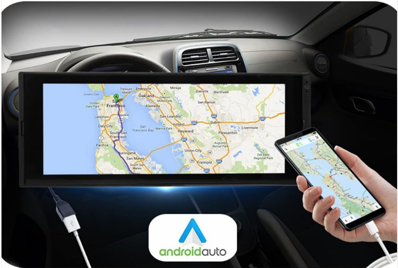
Image: The Eaglerich SP-7069 car stereo displaying the Android Auto interface. An Android phone is shown connected via USB, with the Android Auto logo, demonstrating how phone apps are controlled from the unit.

Simply connected by USB cable, You only need to download the APPs from GooglePlay to your mobile phone and fully control of all APPs by operate from the unit.