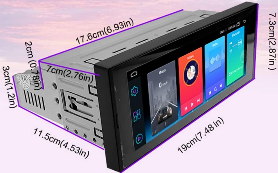
Image: Diagram showing the dimensions of the Eaglerich SP-7069 car stereo. The image indicates a width of 19cm (7.48in), height of 7.3cm (2.87in), and depth of 11.5cm (4.53in) for the main body, with the screen extending slightly.

Once all connections are secure, slide the unit into the dashboard slot until it clicks into place. Test all functions before fully reassembling your dashboard.