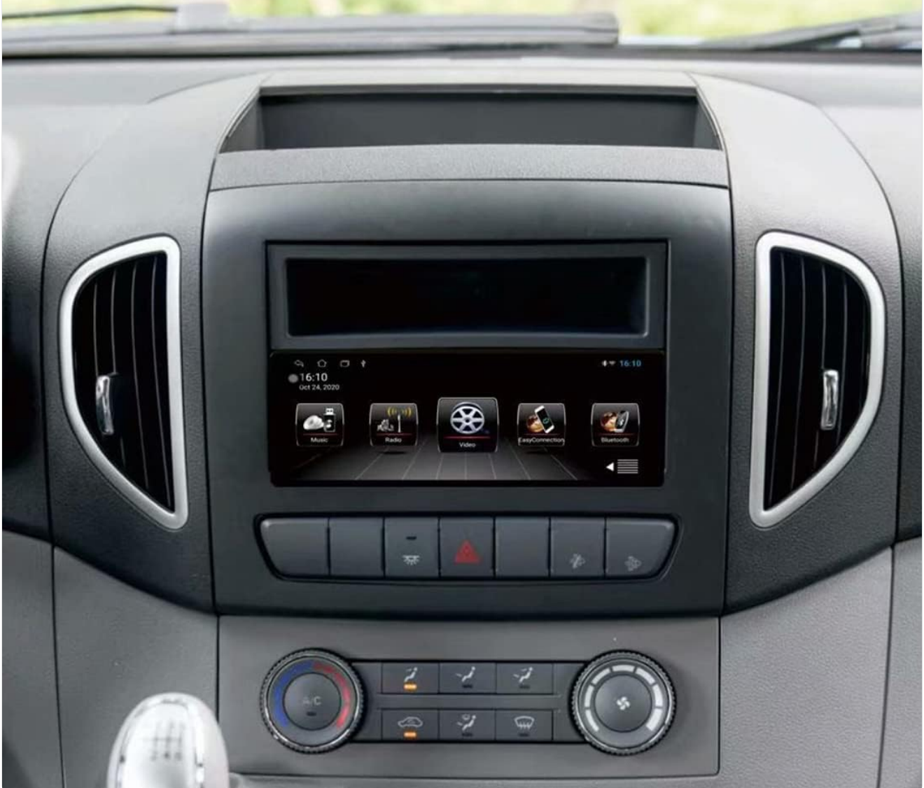
Image: Example of the Eaglerich SP-7069 car stereo installed in a vehicle dashboard. This image demonstrates how the unit fits into a standard car stereo slot, showing the screen and surrounding controls.

Use the provided disassembly keys to remove your existing car stereo. Carefully connect the power cord, antenna, GPS cable, USB cables, and RCA audio cables to the corresponding ports on the new unit. If installing a rearview camera, connect its cable as well.