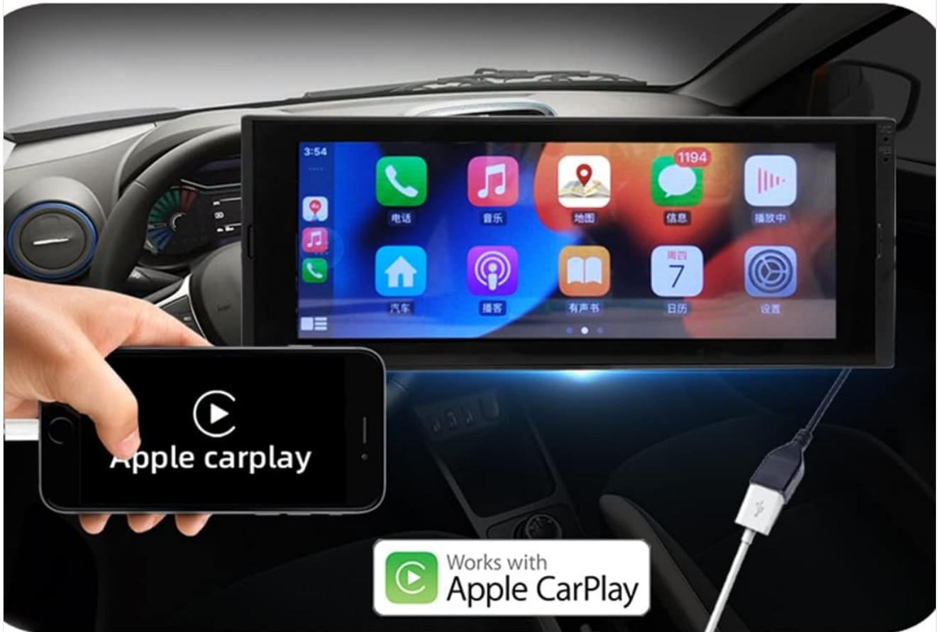
Image: The Eaglerich SP-7069 car stereo displaying the Apple CarPlay interface. An iPhone is shown connected via USB, with the CarPlay logo visible, illustrating the integration of phone features onto the car's screen.

How does Carplay operate the iPhone They were all moved to the central control display in the car, Keep your focus on driving at the same time You can also use navigation, enjoy music, make calls and send and receive information