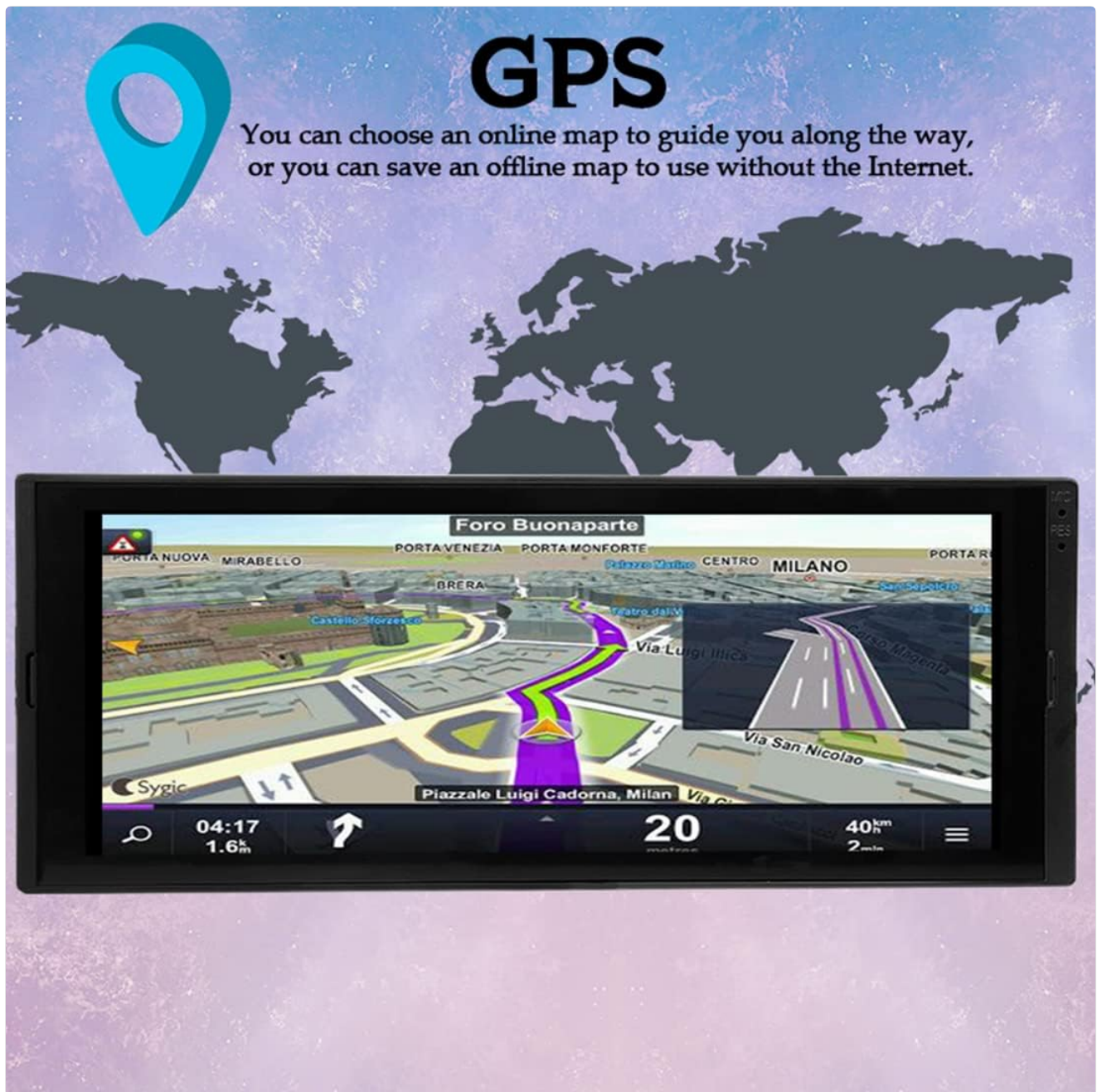
Image: The Eaglerich SP-7069 car stereo displaying a GPS navigation map. The map shows a route with directions, indicating the unit's capability for guiding users to their destination.