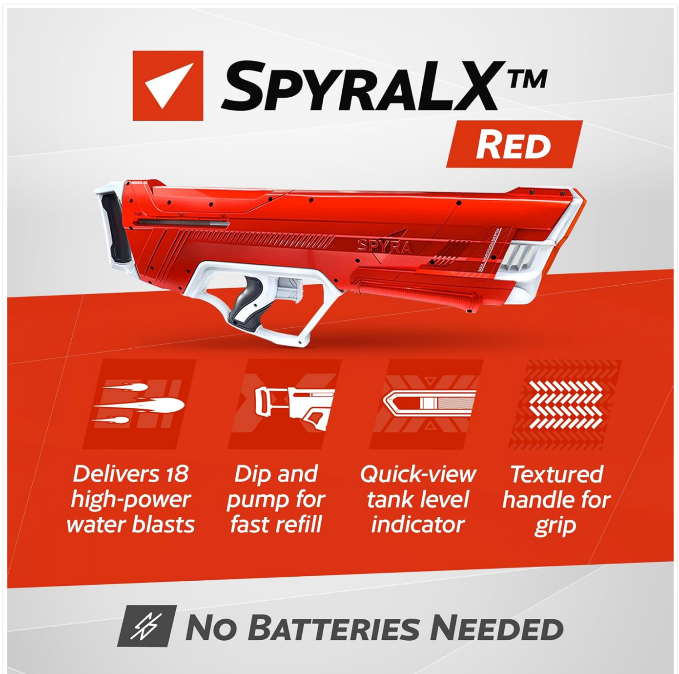
Image 1.2: Overview of SpyraLX™ features including 18 high-power water blasts, fast refill, quick-view tank level indicator, and textured handle.