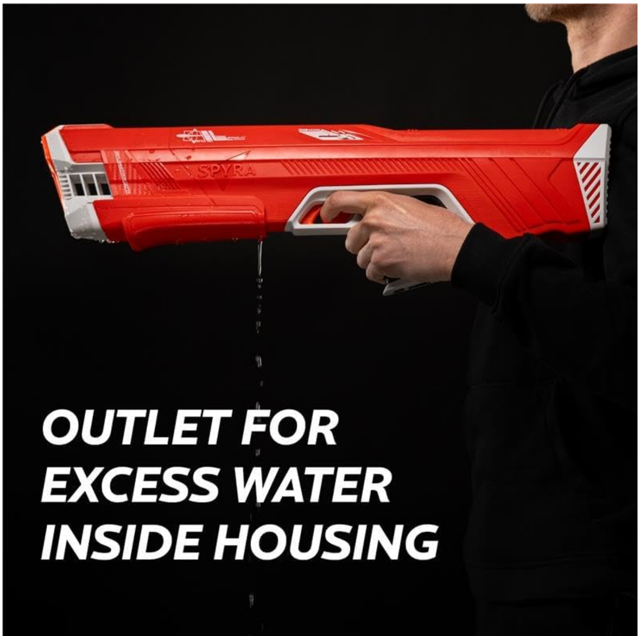
Image 5.1: The outlet designed to release excess water from inside the blaster's housing, aiding in drainage and drying.