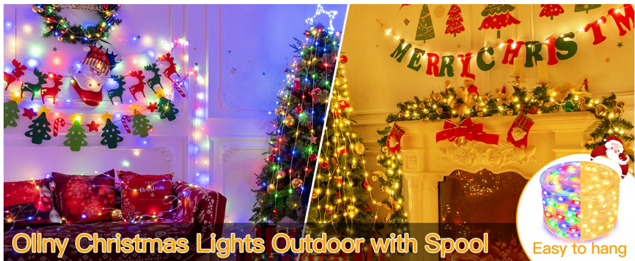
Image: The string lights neatly wound on a spool, illustrating the ease of unrolling for installation.