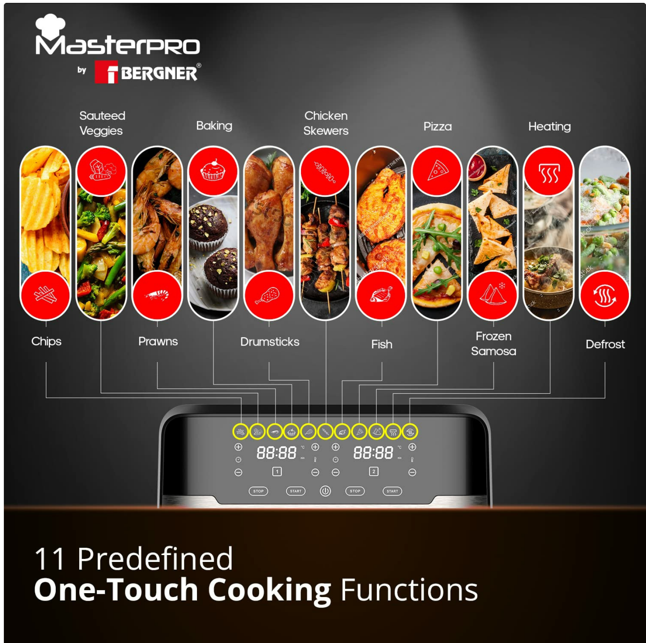
The LED touchscreen display showing the 11 predefined one-touch cooking functions.

The appliance features an intuitive LED touchscreen display. Each basket has its own set of controls for temperature and time, along with dedicated start/stop buttons.