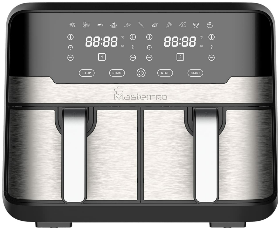
Front view of the Bergner Master Pro Dual Air Fryer, showcasing its sleek design and digital display.