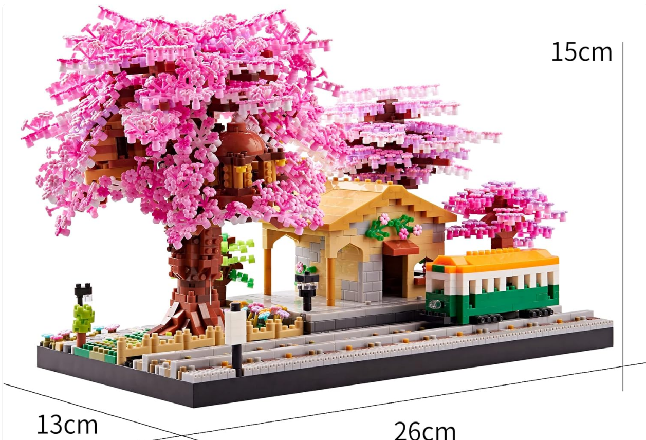
Figure 5: Dimensions of the assembled model.