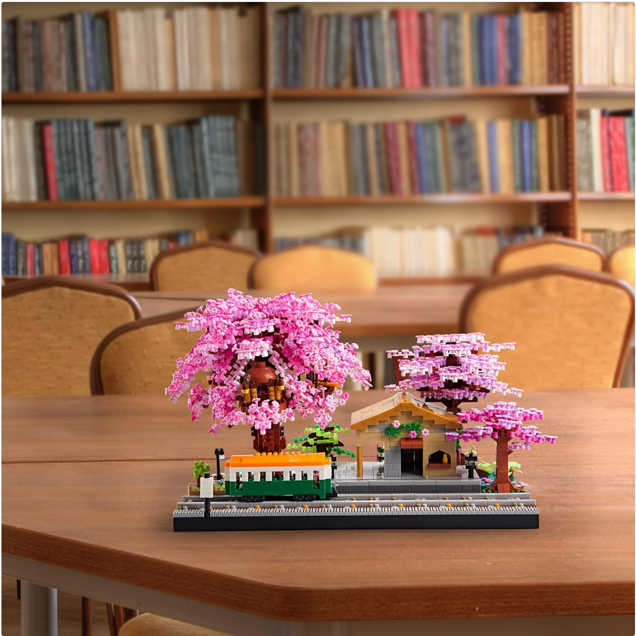
Figure 4: The assembled model as a decorative display piece.