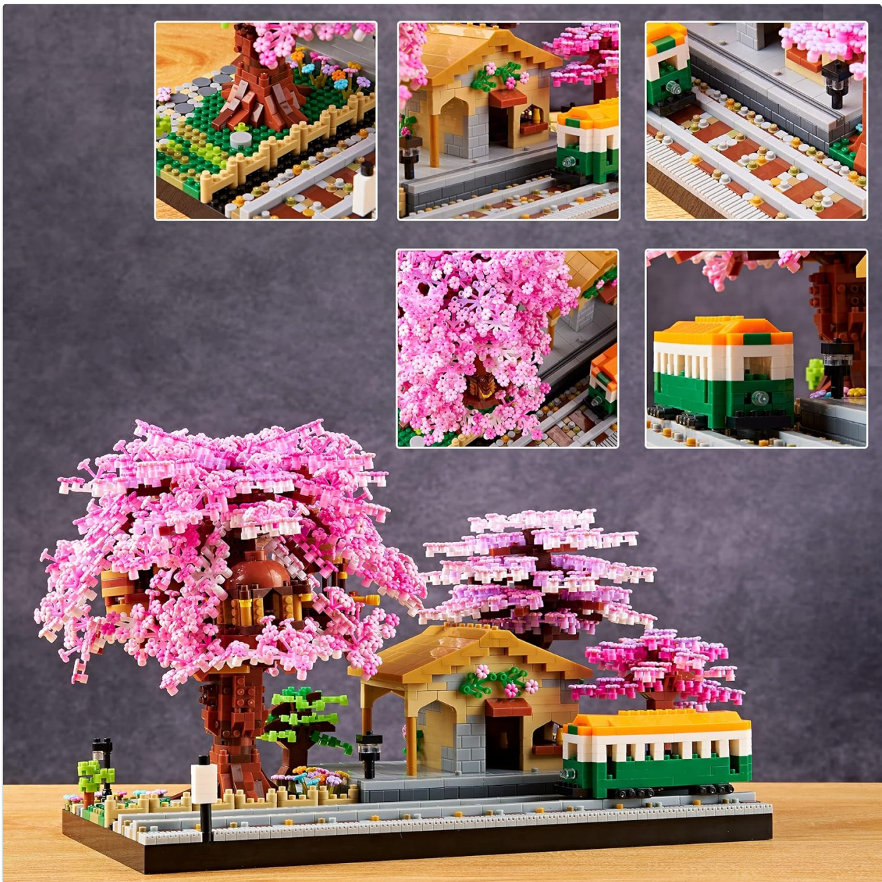
Figure 3: Detailed views of the assembled model, showcasing various sections.