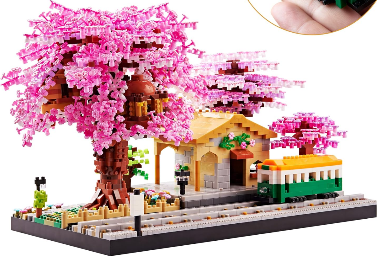
Figure 1: Fully assembled Cherry Blossom Train Station Micro Building Blocks Set.